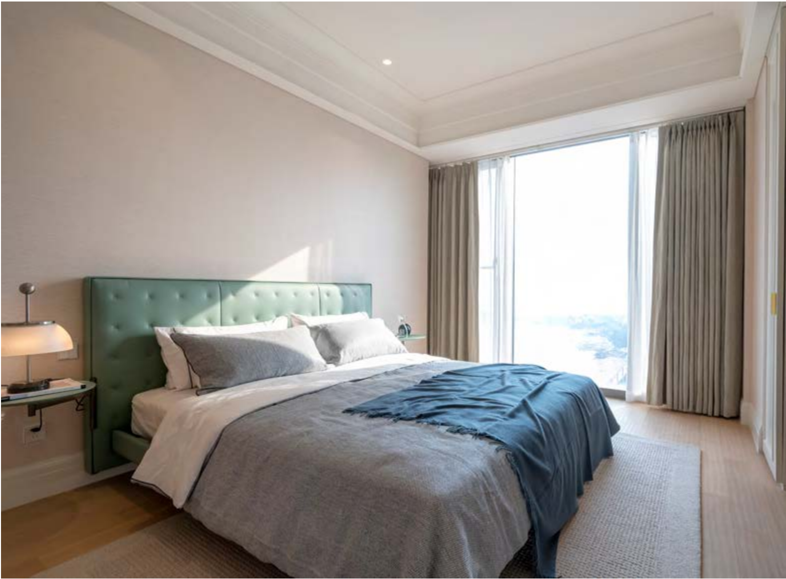
↑ Jack bed with side table, Pelle Frau® leather SC 184 Atollo* ↖ Moondance cest of drawer, Pelle Frau® leather SC 189 Menta* / Canaletto walnut top ↖ Leather Pot ø 19 cm wide vase, Pelle Frau® leather Nest Larimar ↖ Leather Pot ø 10 cm small vase, Pelle Frau® leather SC 26 Topo