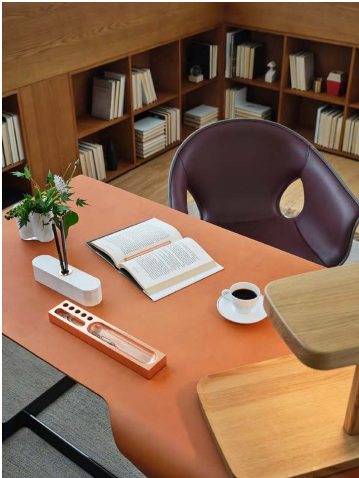
↑ ↗ Fred desk ,Pelle Frau® leather Saddle Extra Cammello / ash in a wengè stain ↑ ↗ Ginger Ale swivel chair, Pelle Frau® leather Saddle Extra Polvere / Pelle Frau® leather SC 99 Carrubo