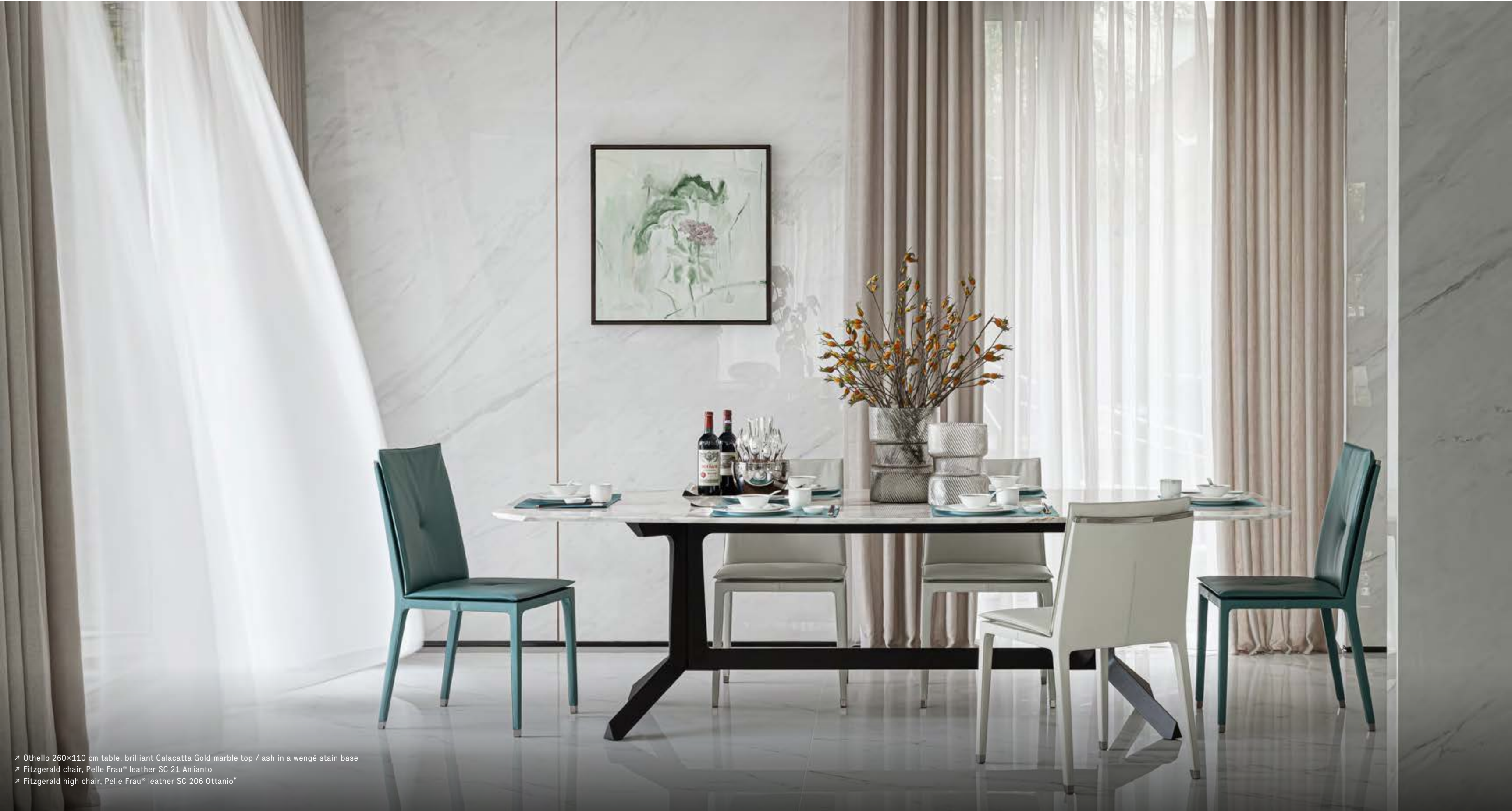
➤ Othello 260×110 cm table, brilliant Calacatta Gold marble top / ash in a wengè stain base ➤ Fitzgerald chair, Pelle Frau® leather SC 21 Amianto ➤ Fitzgerald high chair, Pelle Frau® leather SC 206 Ottanio*