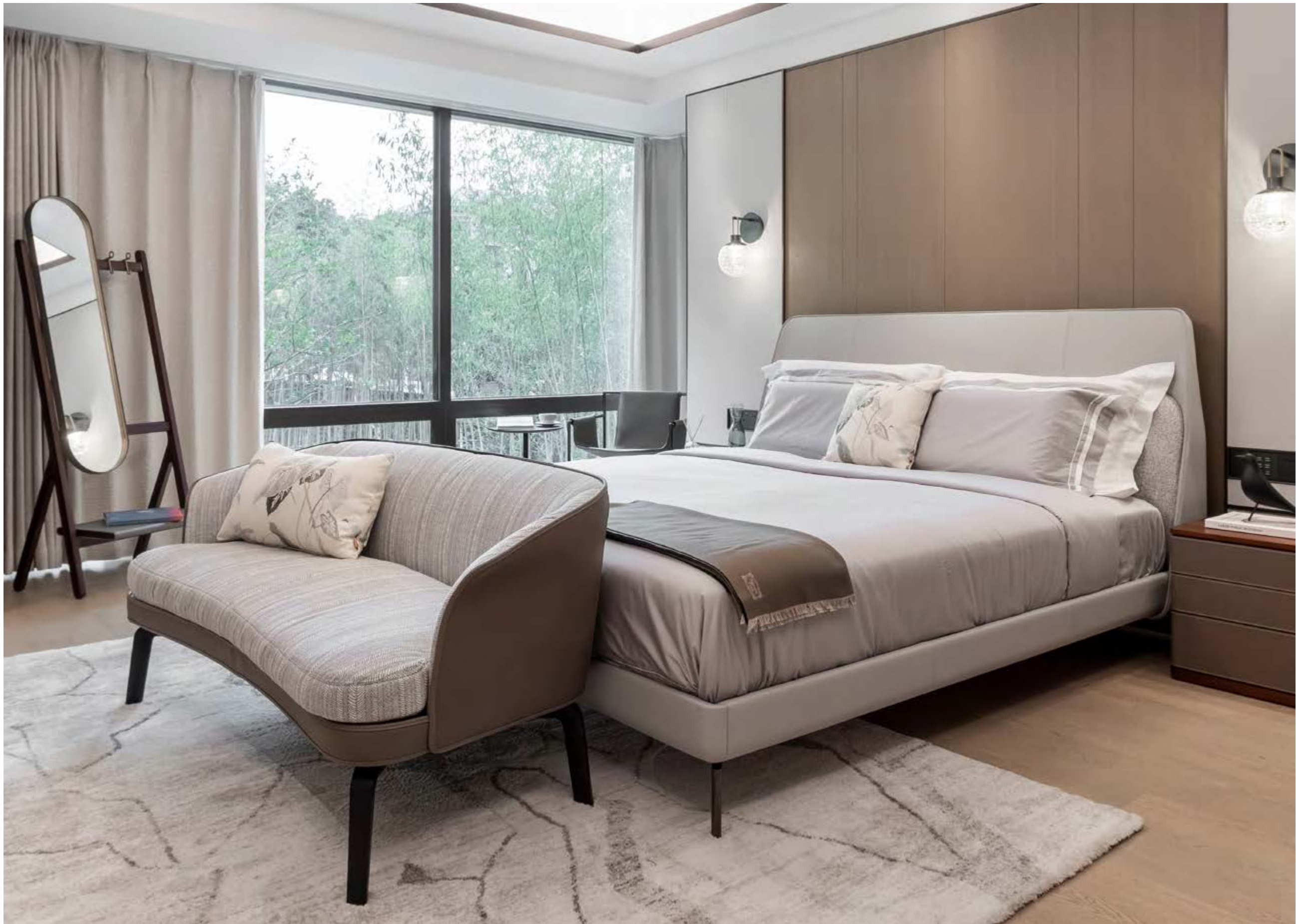
↵ Coupè bed , Pelle Frau® leather SC 23 Tortora / fabric Melange col. 6 Argento ↵ Fidelio Notte night table, Pelle Frau® leather Saddle Extra Polvere / Canaletto walnut ↵ Nivola sofa, Pelle Frau® leather Saddle Extra Polvere / fabric Nouveau col. 10 Grafite - lighter side ↵ Ren dressing table, Pelle Frau® leather Saddle Extra Corda ↵ Ming's Heart armchair, Pelle Frau® leather Saddle Extra Corda