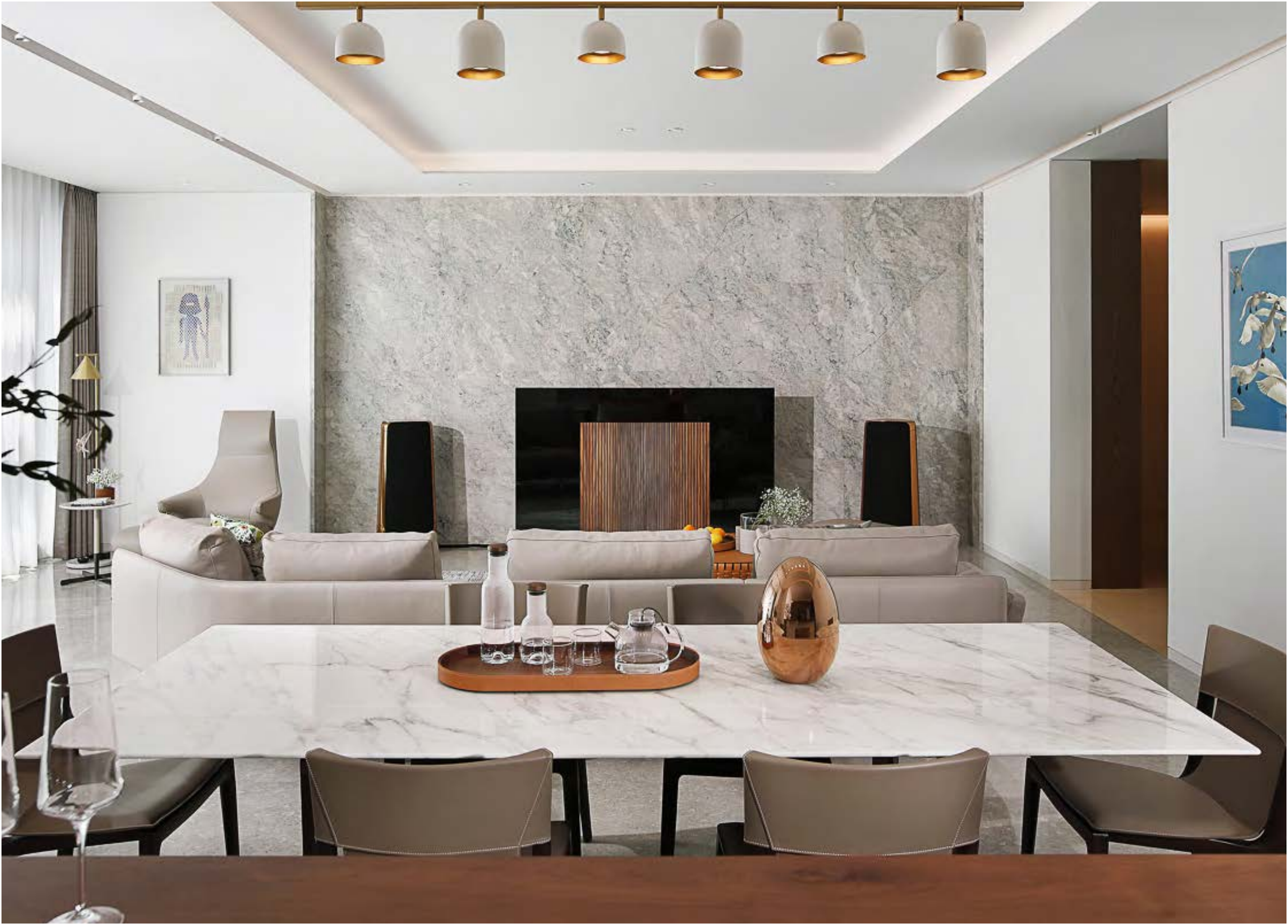
➤ Bolero 250 × 100 table, brilliant marble top / ash in a moka stain ➤ Isadora chair, Pelle Frau® leather Saddle Extra Talpa / ash in a moka stain structure ➤ Jay Lounge armchair and ottoman, Pelle Frau® leather Soul Whitney ➤ Zhuang oval tray, Pelle Frau® leather Saddle Extra Cammello