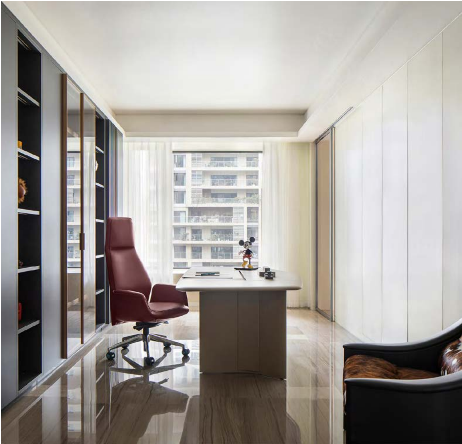
↖ Dezza 48 armchair, Pelle Frau® leather SC 20 Inchiostro / Cavallino / black lacquered ash ↖ Holly lamp ↑ Trust desk, Pelle Frau® leather Saddle Executive Havana ↑ Downtown President armchair, Pelle Frau® leather SC 92 Garnet