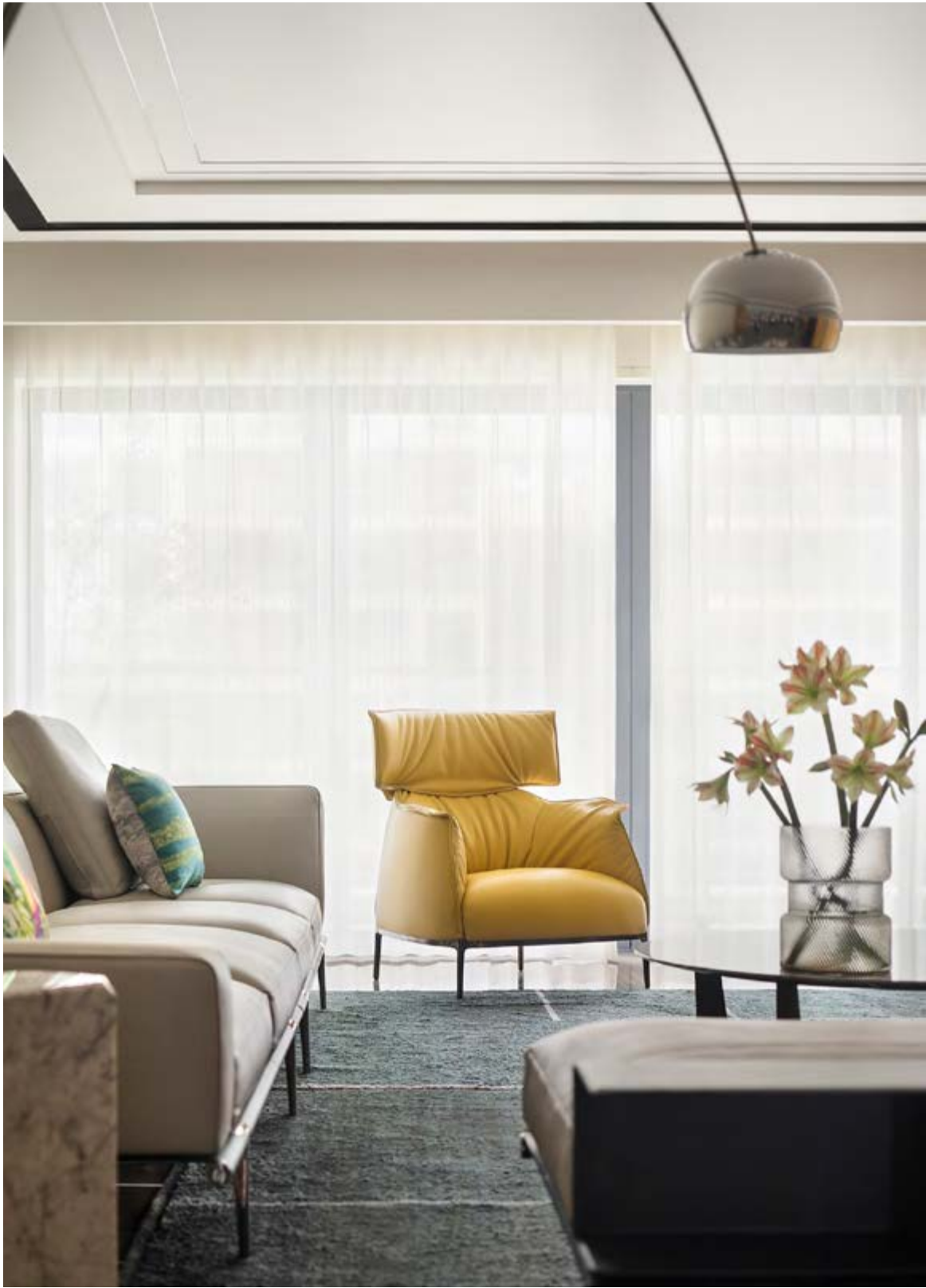
↑ ↗ Archibald King armchair, Pelle Frau® leather Nest Ambra ↑ Rips vase, large ↗ Let it Be sofa, Pelle Frau® leather SC 23 Tortora / Saddle Avocado ↗ Ilary ø 110 h 35 small table, brilliant Fior di Pesco marble top / ash in a moka stain base ↗ Bob ø 45 h 52 small table, brilliant Calacatta marble top / gunmetal base