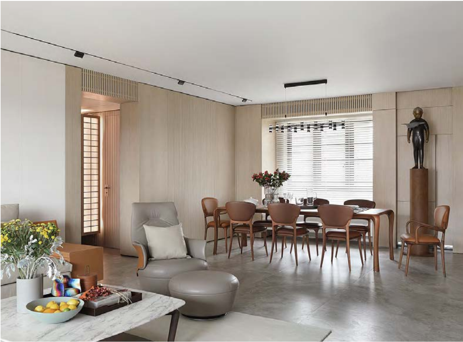
CECCOTTICOLLEZIONI products ↑ ↖ Rips vase ↑ Leather Pot vase, Pelle Frau® leather Nest Salgemma ↑ Mini Archibald Anniversary Limited Edition ↑ ↖ Whity 260×106 table, walnut ↑ ↖ Teresa chair with armrests, walnut / Pelle Frau® leather SC 66 India ↑ Teresa chair, walnut / Pelle Frau® leather SC 69 Iroko