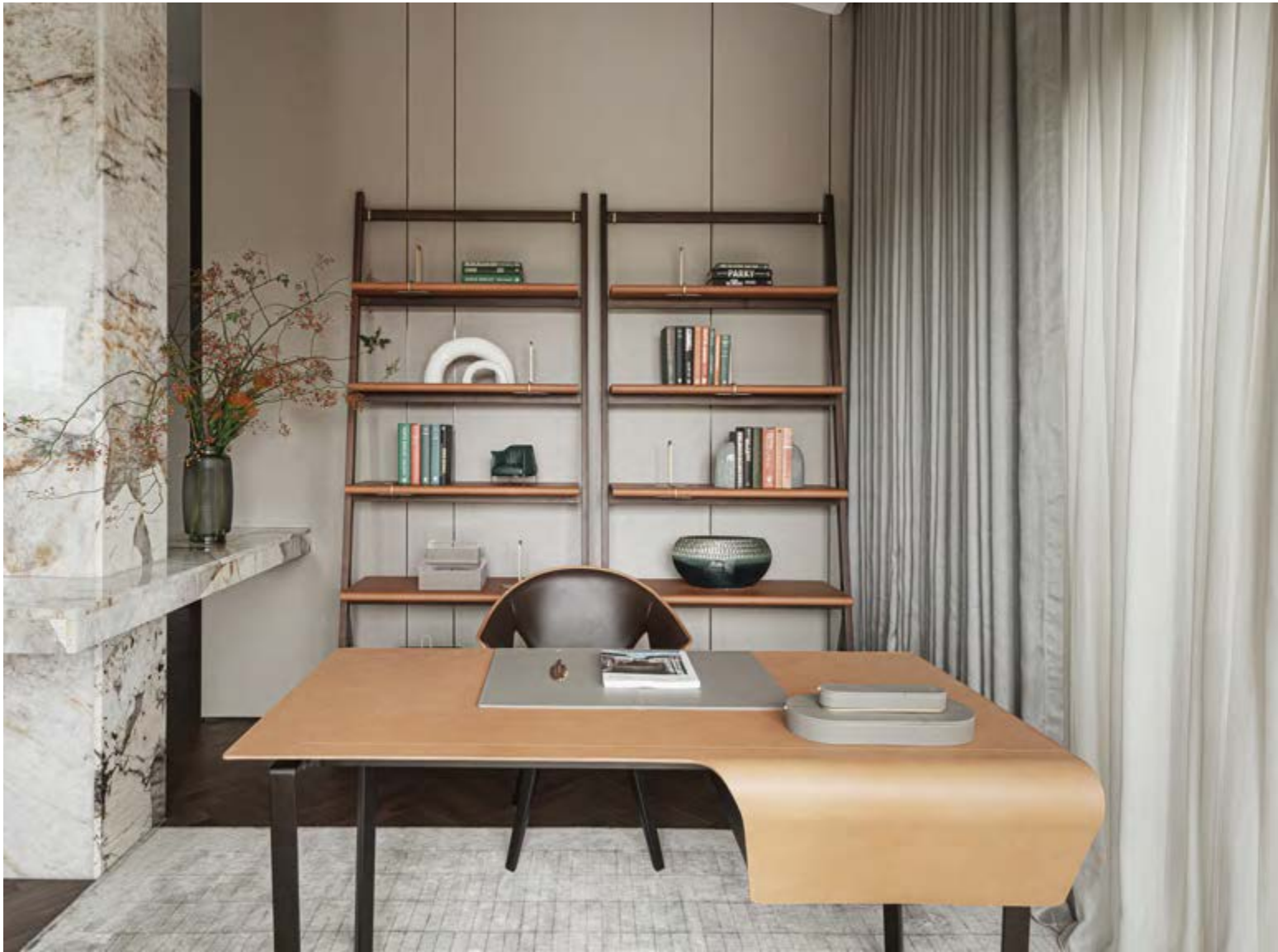
↑ 𐀀 Fred desk, Pelle Frau® leather Saddle Extra Cammello / ash in a wenge stain ↑ 𐀀 Ginger armchair, Pelle Frau® leather Saddle Extra Cammello / SC 80 Bruno Havana / ash in a wengè stain ↑ 𐀀 Ren Bookcase, Pelle Frau® leather Saddle Extra Cammello / Canaletto walnut structure ↑ 𐀀 Zhuang Desk, Pelle Frau® leather Saddle Tortora