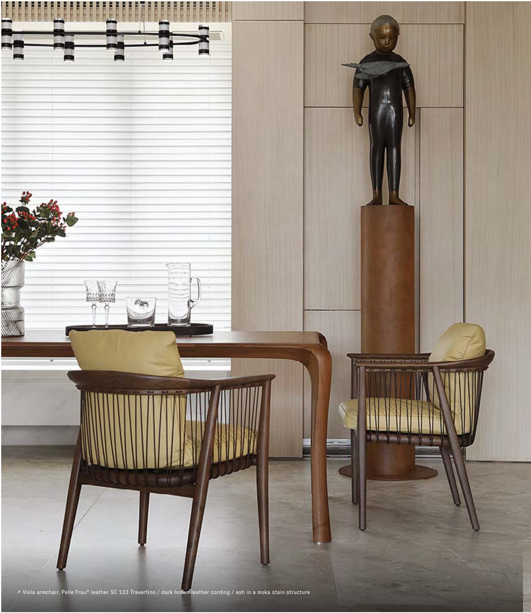
➤ Viola armchair, Pelle Frau® leather SC 133 Travertino / dark brown leather cording / ash in a moka stain structure

The project owner has been engaged in the investment management industry for many years, and she expects to realize her expectations and investment planning for her ideal home. The designer has created an extremely elegant home space for the owner, abandoning the complicated decoration design, from the whole to the details, condensed and elegant, with a sense of art in the simplicity, which can make the family take a break from the busy work and relax.