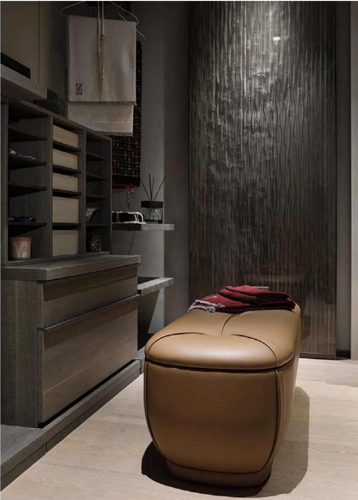
↖ Fumoir armchair, fabric Barkley col. 027 Lichene ↑ Lepilì 121×145 h 42 cm ottoman, Pelle Frau® leather SC 56 Siena ↑ Chamonix plaid, Cardinal