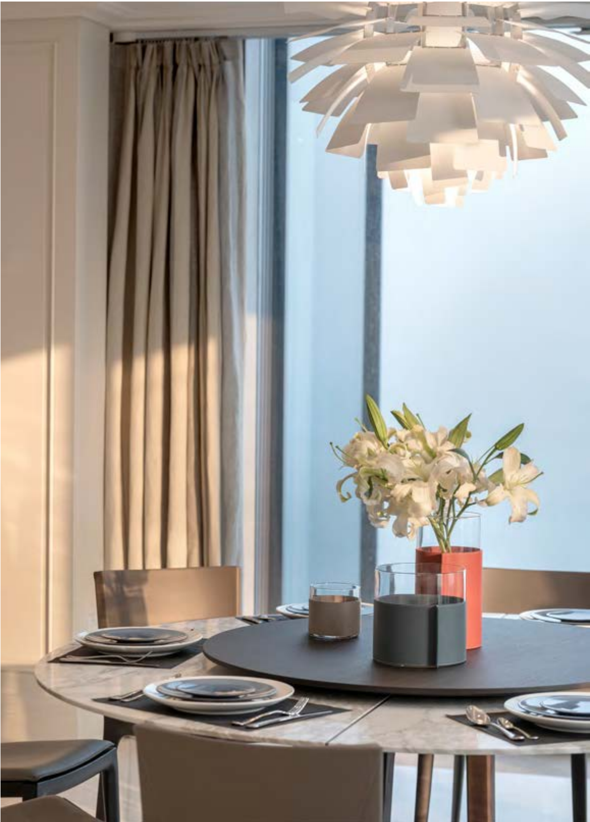
↑ ↖ Isadora chair, Pelle Frau® leather Saddle Extra Polvere / ash in a moka stain structure ↑ Leather Pot ø15 high vase, Pelle Frau® leather Nest Marte ↑ Leather Pot ø10 small vase, Pelle Frau® leather Nest Salgemma ↑ Leather Pot ø19 wide vase, Pelle Frau® leather Nest Larimar