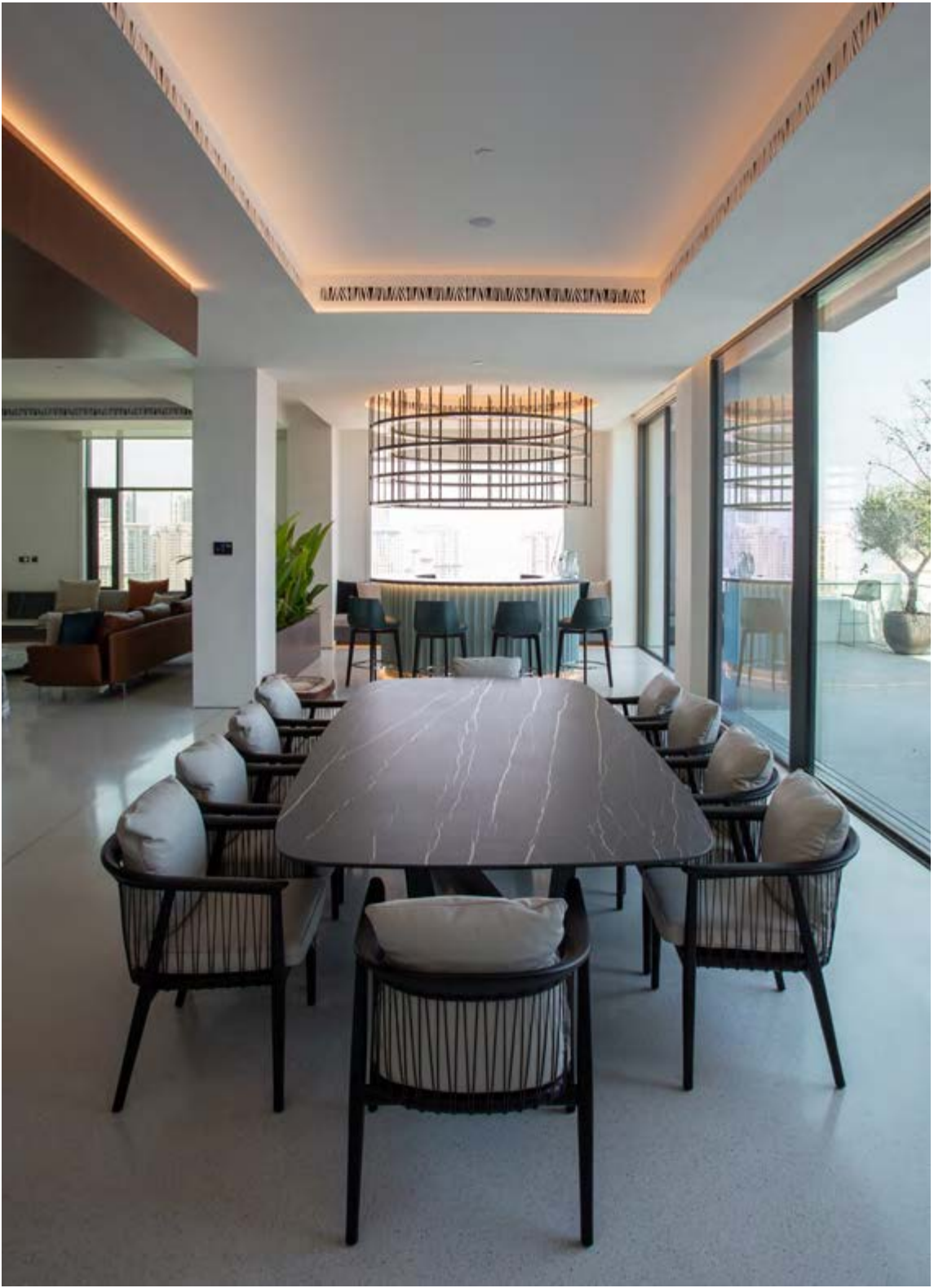
↑ ↗ Viola chair, Pelle Frau® leather SC 22 Chiffon / ash in a moka stain structure ↑ Archibald stool, Pelle Frau® leather SC 187 Selva / ash in a wenge stain