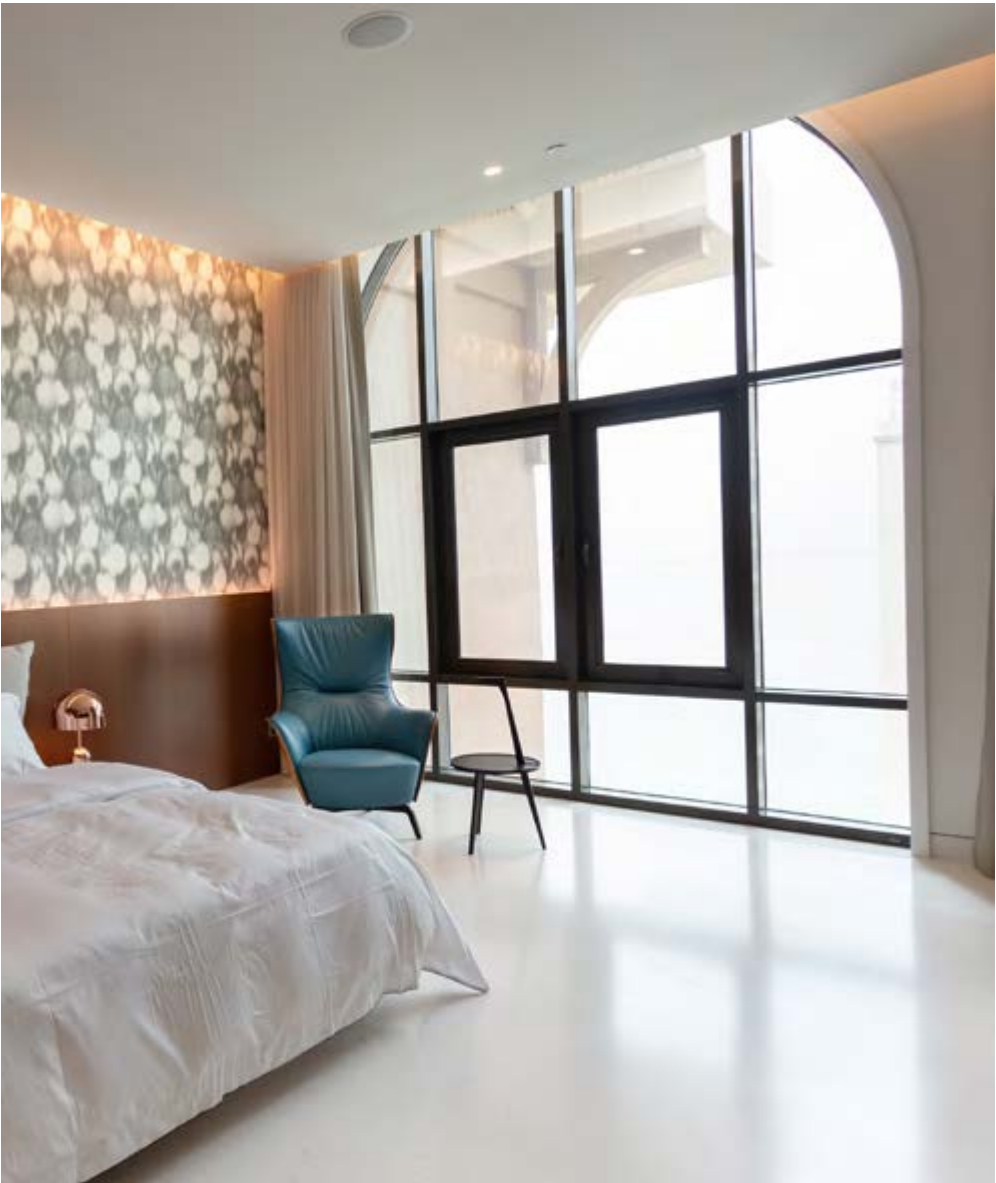
↑ Mamy Blue armchair, Pelle Frau® leather Nest Azul / Pelle Frau® leather Saddle Extra Cammello / ash in a moka stain base ↗ Suzie Wong bed, Pelle Frau® leather SC 53 Creta ↗ Fidelio Notte night table, Pelle Frau® leather Saddle Avorio / Canaletto walnut top