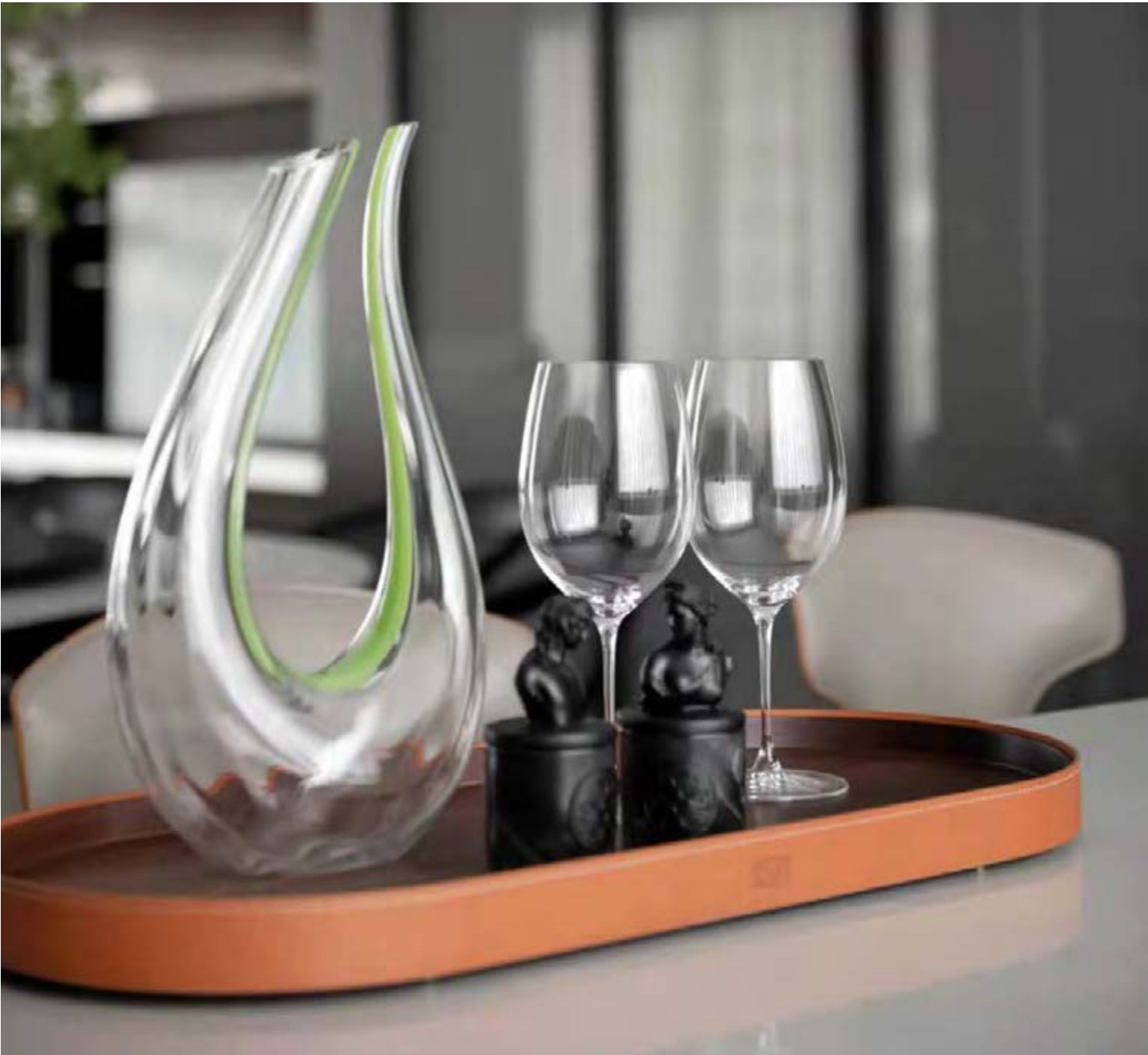
↑ ↗ Zhuang oval tray, Pelle Frau® leather SC Saddle Extra Cammello / Canaletto walnut ↗ Montera column-base stool, Pelle Frau® leather SC 68 India / SC 233 Bardiglio