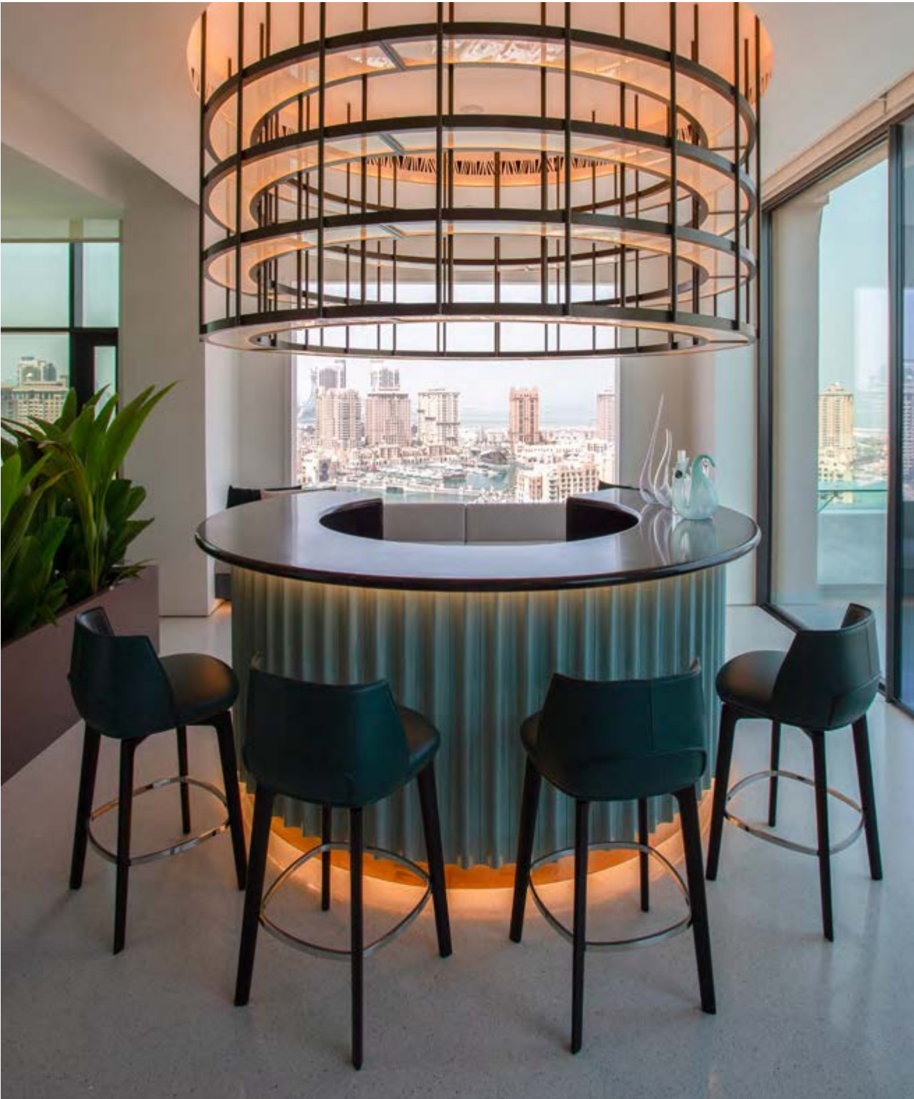
↖ H_0 Desk president desk, Pelle Frau® leather Saddle Tortora / ash in a teak stain top / white porphyry colour ↖ Cercle President office chair, Pelle Frau® leather Saddle Executive Ink / fabric Bouclè col. 104 / Aluminum in black finish base ↖ Ming's Heart armchair, Pelle Frau® leather Saddle Extra Cammello / galvanised gunmetal grey finish structure ↖ Massimosistema sofa, Pelle Frau® leather SC 28 Seppia ↖ Decorative Cushions, Pelle Frau® leather SC 22 Chiffon ↑ Archibald stool, Pelle Frau® leather SC 187 Selva / ash in a wenge stain