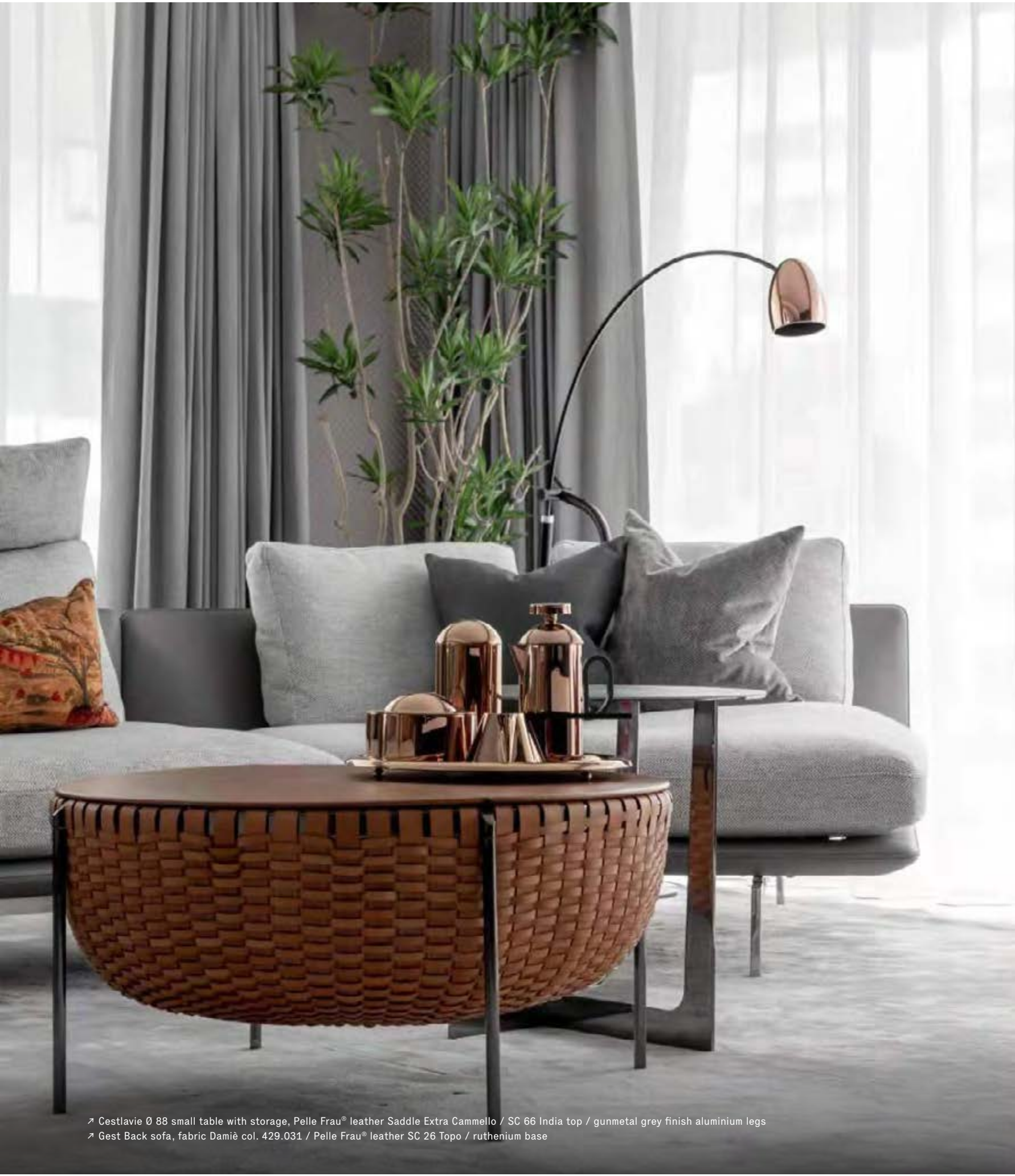
➤ Cestlavie Ø 88 small table with storage, Pelle Frau® leather Saddle Extra Cammello / SC 66 India top / gunmetal grey finish aluminium legs ➤ Gest Back sofa, fabric Damiè col. 429.031 / Pelle Frau® leather SC 26 Topo / ruthenium base

The design ensures the vast landscape vision and sufficient family activity space, and tells the internal and external repair of quality life from the details.