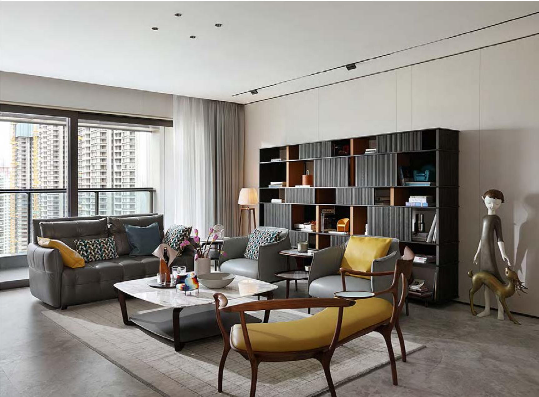
↑ ↗ Fiorile 120×120 cm dual-shelf table, veined Arabescato marble / Pelle Frau® leather SC 26 Topo / ash in a moka stain ↑ ↗ Lloyd 280×42 h 188 cm freestanding bookcase, Pelle Frau® leather Saddle Extra Cammello ↑ ↗ Chado 200x300 cm rug, Pearl Grey ↑ ↗ Mini Vanity Fair, Pelle Frau® leather SC 217 Pacifico* ↑ ↗ Mini Intervista, Pelle Frau® leather SC 143 Carioca* ↗ Archibald armchair, Pelle Frau® leather Nest Cemento ↑ Mini Archibald Anniversary Limited Edition