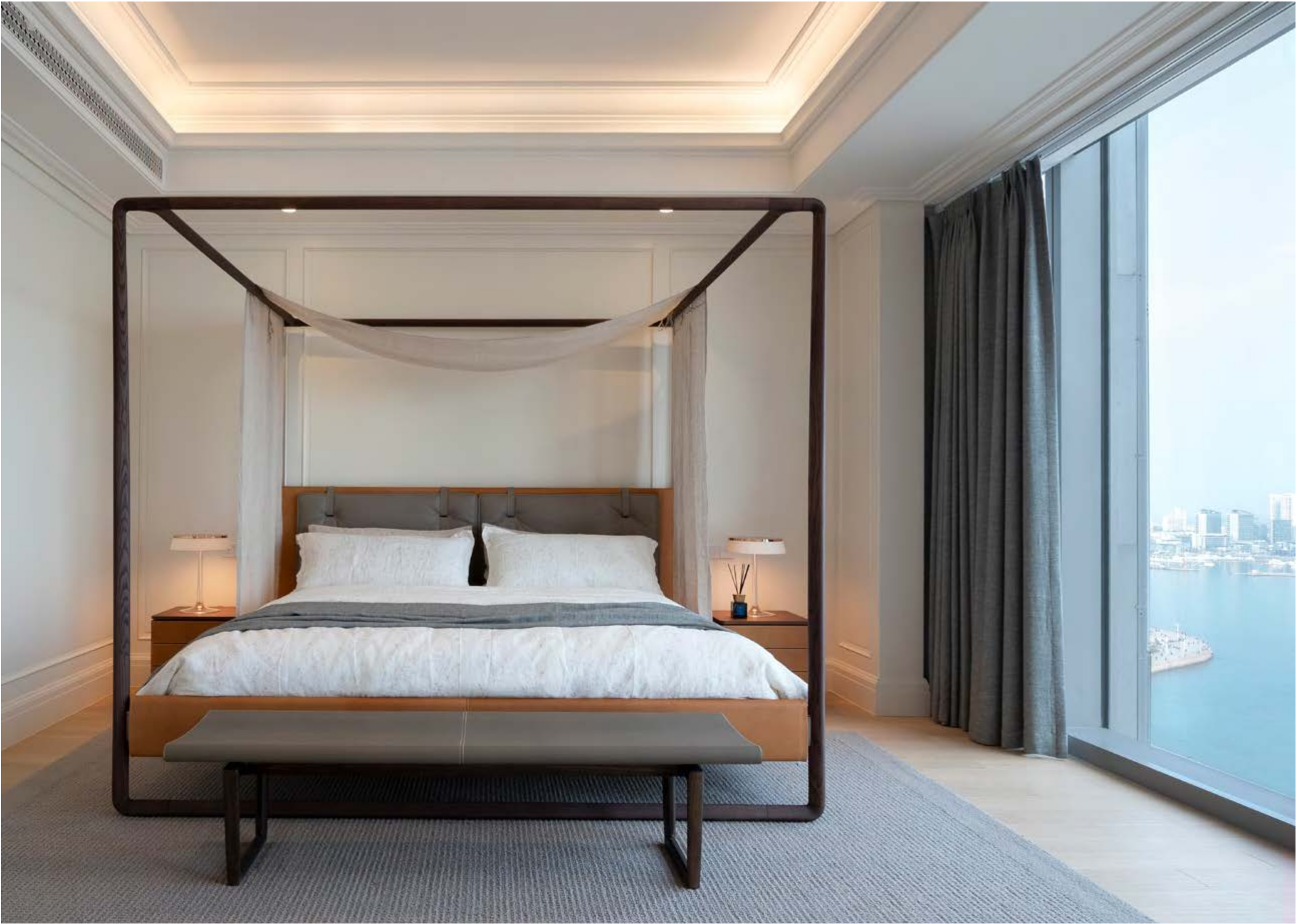
➤ Volare bed, Pelle Frau® leather Nest Pomice / Saddle Extra Cammello ➤ Fidelio Notte night table, Pelle Frau® leather Saddle Extra Cammello / Canaletto walnut top ➤ Fidelio Bench, Pelle Frau® leather Talpa