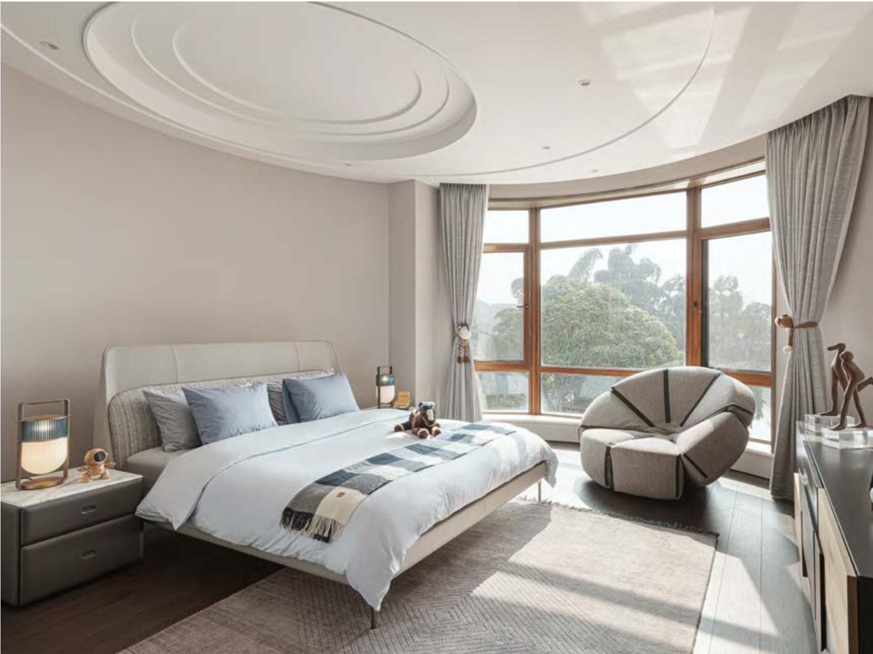
↑ Coupè bed, Pelle Frau® leather SC 23 Tortora / fabric Nouveau col. 10 Grafite (lighter side)* / gunmetal steel feet ↑ Moondance night table, Pelle Frau® leather SC 28 Seppia / semi-brilliant Calacatta Gold marble top / Canaletto walnut back ↑ Xi lamp table, Sapphire glass ↗ Turner bookcase, Pelle Frau® leather Saddle Executive Ink / Canaletto walnut structure ↗ Dezza 48 armchair, Pelle Frau® leather SC 20 Inchiostro / Cavallino / black lasquered ash legs ↗ Lepli 39x39 ottoman, fabric Nouveau col. 13 Blu scuro* / Pelle Frau® leather SC 239 Prussia*