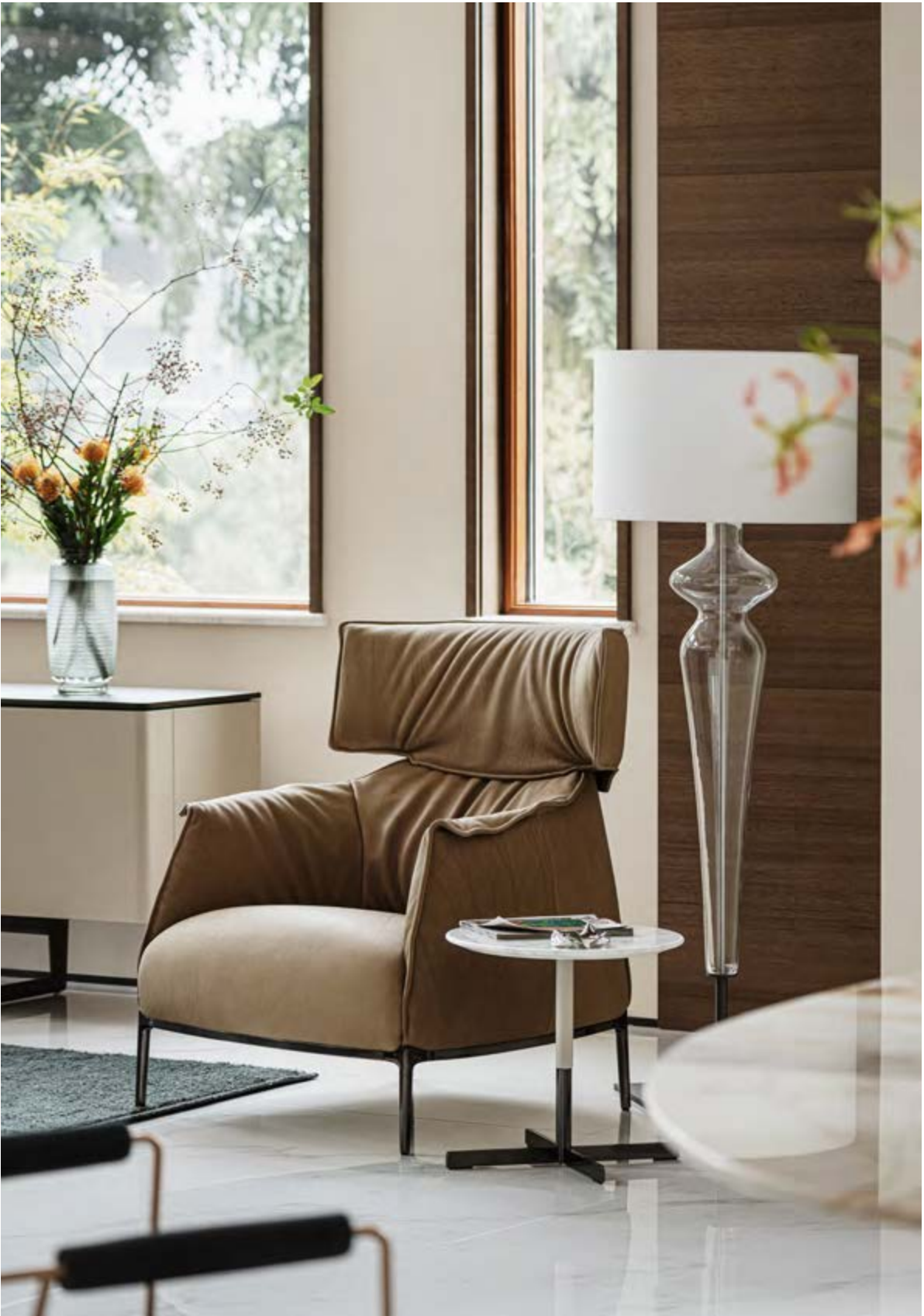
↶ 1919 armchair, Pelle Frau® leather Century Foresta* ↑ Archibald King armchair, Pelle Frau® leather Century Khaki* ↑ Bob ø45 h 43 cm, semi-brilliant Calacatta Gold marble / Pelle Frau® leather Nest Silice column / gunmental base ↑ Holly lamp