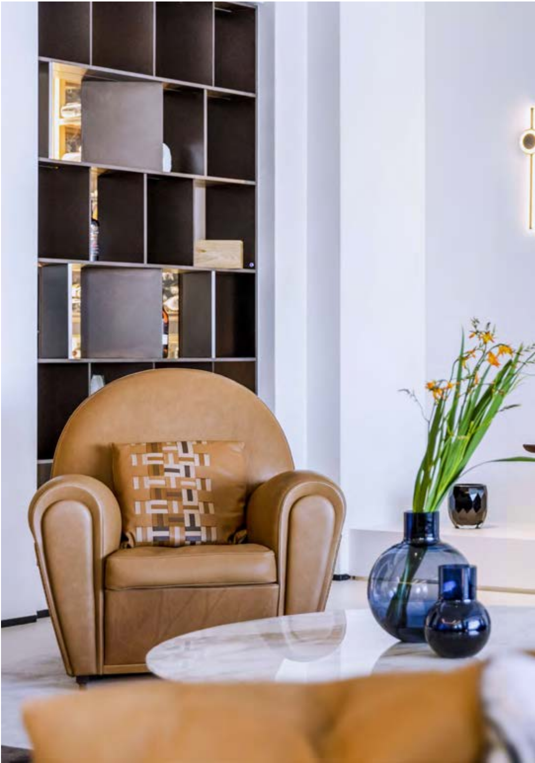
↑ Vanity Fair armchair, Pelle Frau® leather Century Tabacco® ↑ Journey cushion 47×47, Tannery ↑ Blue Pallo vases, Small and Medium ↖ 1919 armchair, Pelle Frau® leather SC 05 Stucco