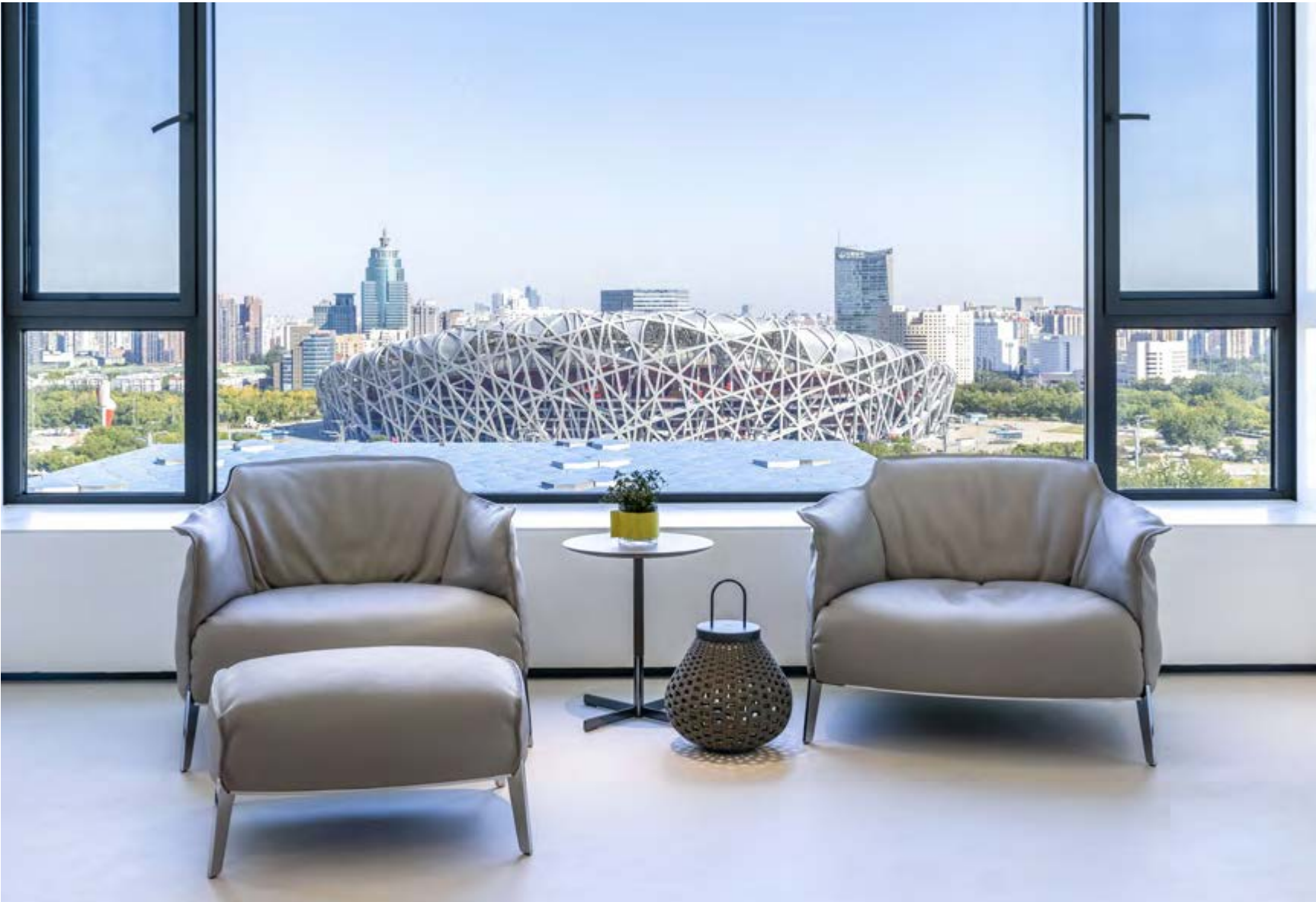
↑ ↗ Archibald Gran Comfort armchair with ottoman, Pelle Frau® leather Safari Elefante ↑ ↗ Bob Ø45 h52 small table, Pelle Frau® leather SC 69 Iroko ↑ ↗ Sparkler lantern, Medium ↑ ↗ Leather Pot small with cover, Pelle Frau® leather SC 140 Mimosa