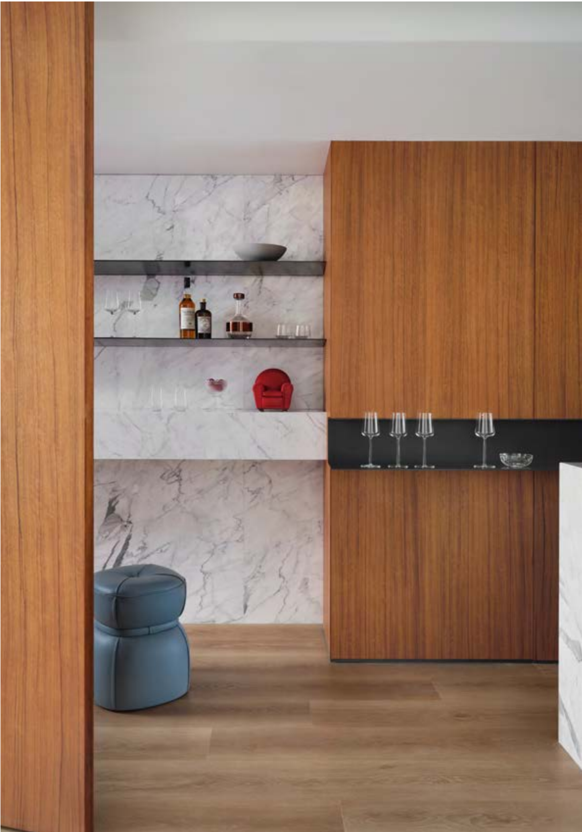
↵ Montera stool, Pelle Frau® leather Saddle Extra Testa di Moro / Pelle Frau® leather SC 233 Bardiglio ↵ 1919 armchair, Pelle Frau® leather Nest Ambra ↑ Lepli 39×39 ottoman, Pelle Frau® leather SC 274 Fresco Blue