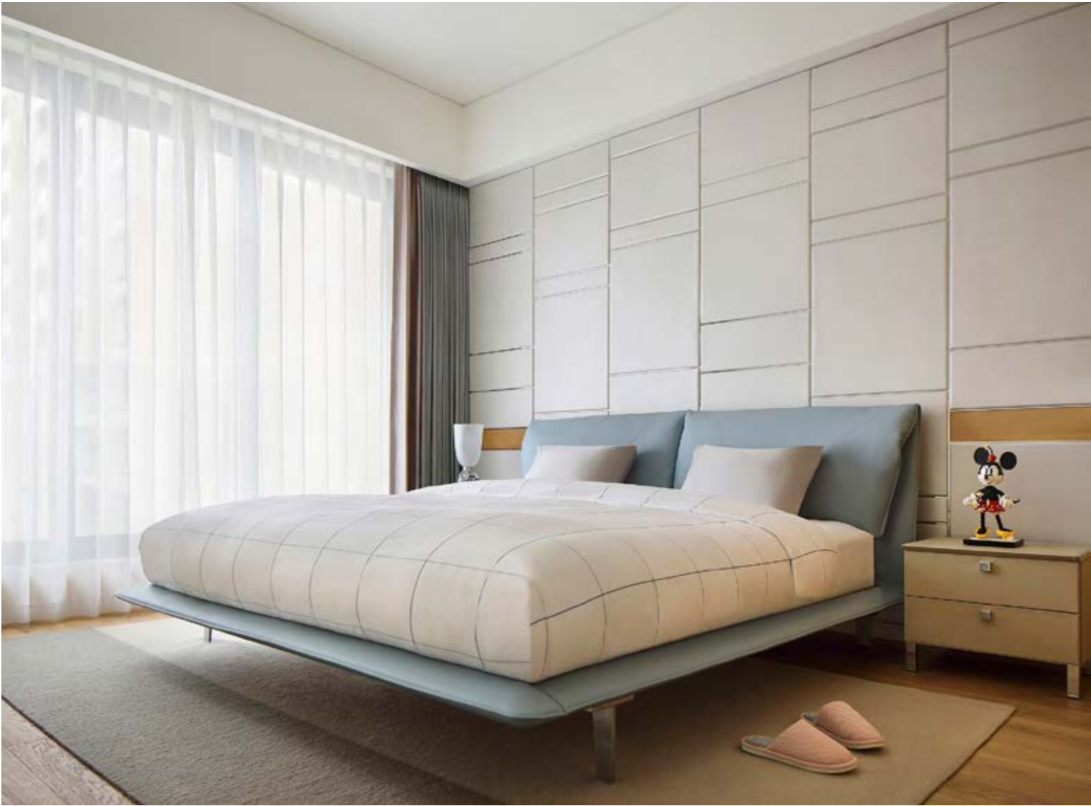
↶ Martha rocking armchair, Pelle Frau® leather Saddle Extra Talpa / fabric Millerighe col. Rosa Antico* ↑ John-John bed, Pelle Frau® leather SC 233 Bardiglio ↑ Più Notte drawer night table, Pelle Frau® leather Saddle Avorio ↑ Alma table lamp