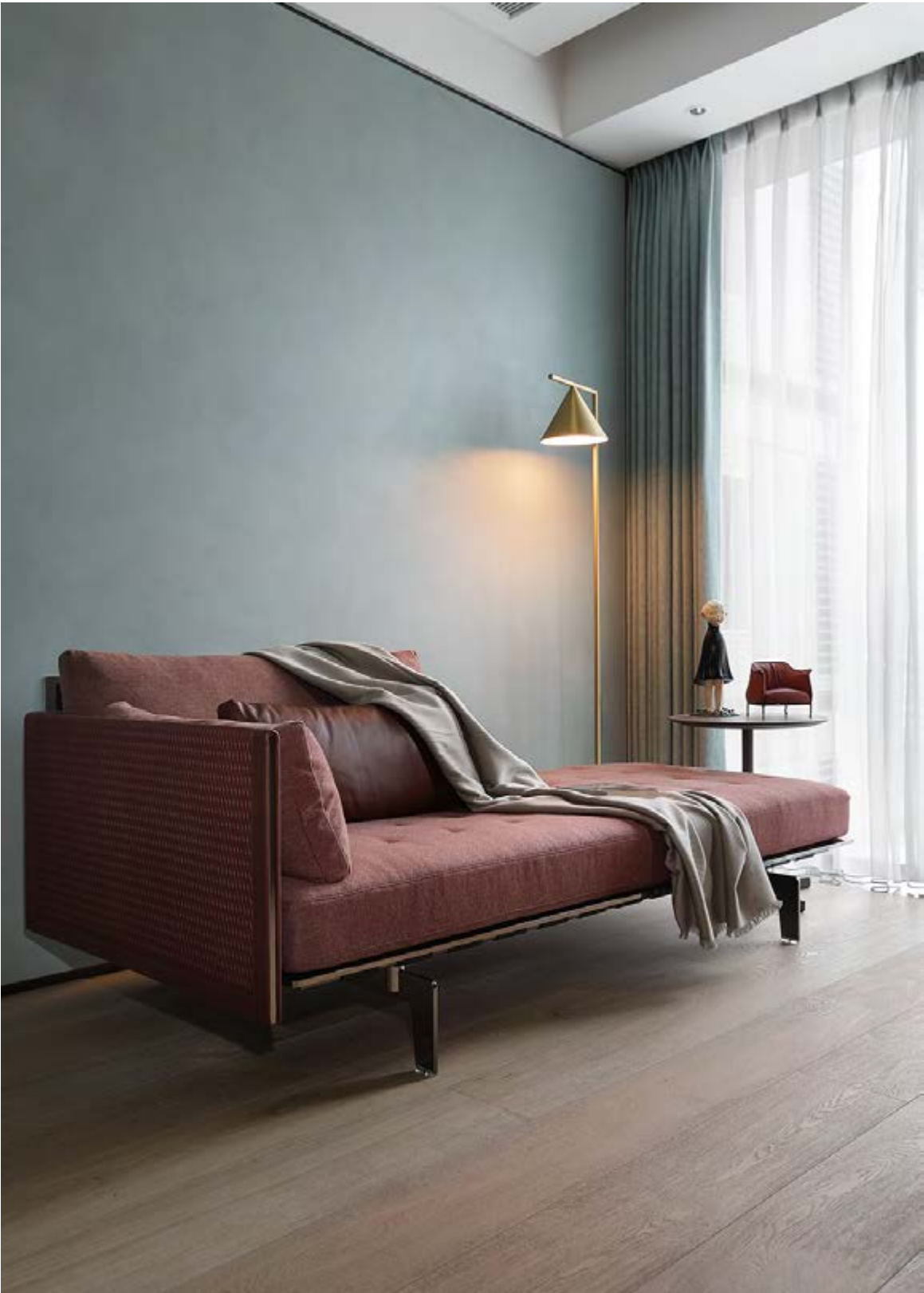
↑ Clayton armchair with bench, Pelle Frau® leather Soul Diana / fabric Giano col. 9 lighter side / Ruthenium feet ↑ Chamonix plaid, Sparrow ↑ Bob Ø 45 h 52 cm coffee table, Pelle Frau® leather SC 26 Topo top / Gunmetal Grey feet ↑ Mini Archibald, Pelle Frau® leather SC 96 Mattone ↗ Ren valet stand, Pelle Frau® leather Saddle Extra Cammello / Canaletto walnut structure