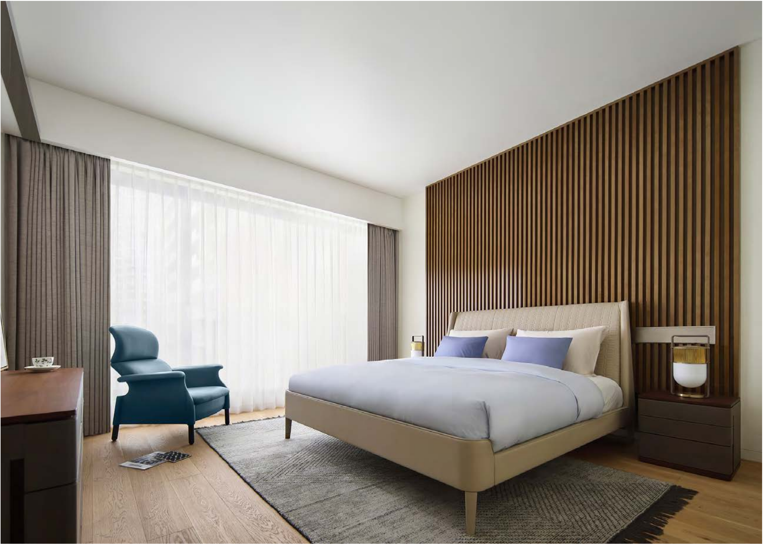
➤ Suzie Wong bed, Pelle Frau® leather Nest Madreperla ➤ Sanluca armchair, Pelle Frau® leather SC 274 Fresco Blue ➤ Fidelio Notte night table, Canaletto walnut top / Pelle Frau® leather Saddle Extra Polvere ➤ Xi table lamp, amber glass