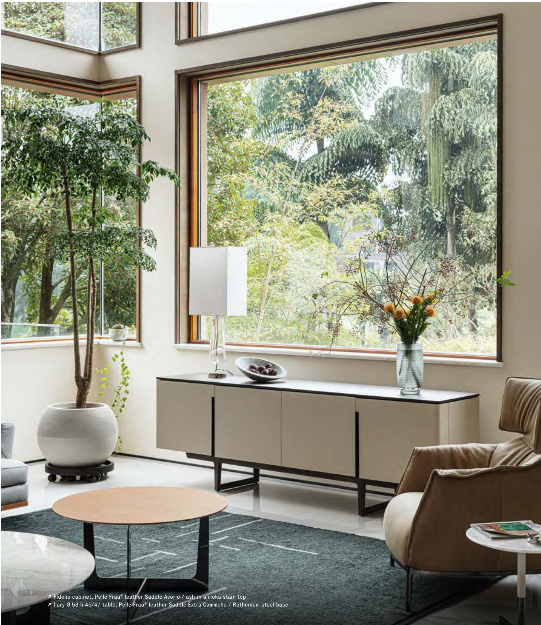
➤ Fidelio cabinet, Pelle Frau® leather Saddle Avorio / ash in a moka stain top ➤ Ilary Ø 53 h 45/47 table, Pelle Frau® leather Saddle Extra Cammello / Ruthenium steel base

Upon entering, the unassuming and warm temperament became even more apparent. Within the fluid spaces, the changing seasons served as the backdrop, while the architecture itself acted as an instrument. All the interior decorations followed the principles of classic elegance, comfort, and naturalness. They linked together the poetry of daily life and conveyed a profound emotional connection to beauty.