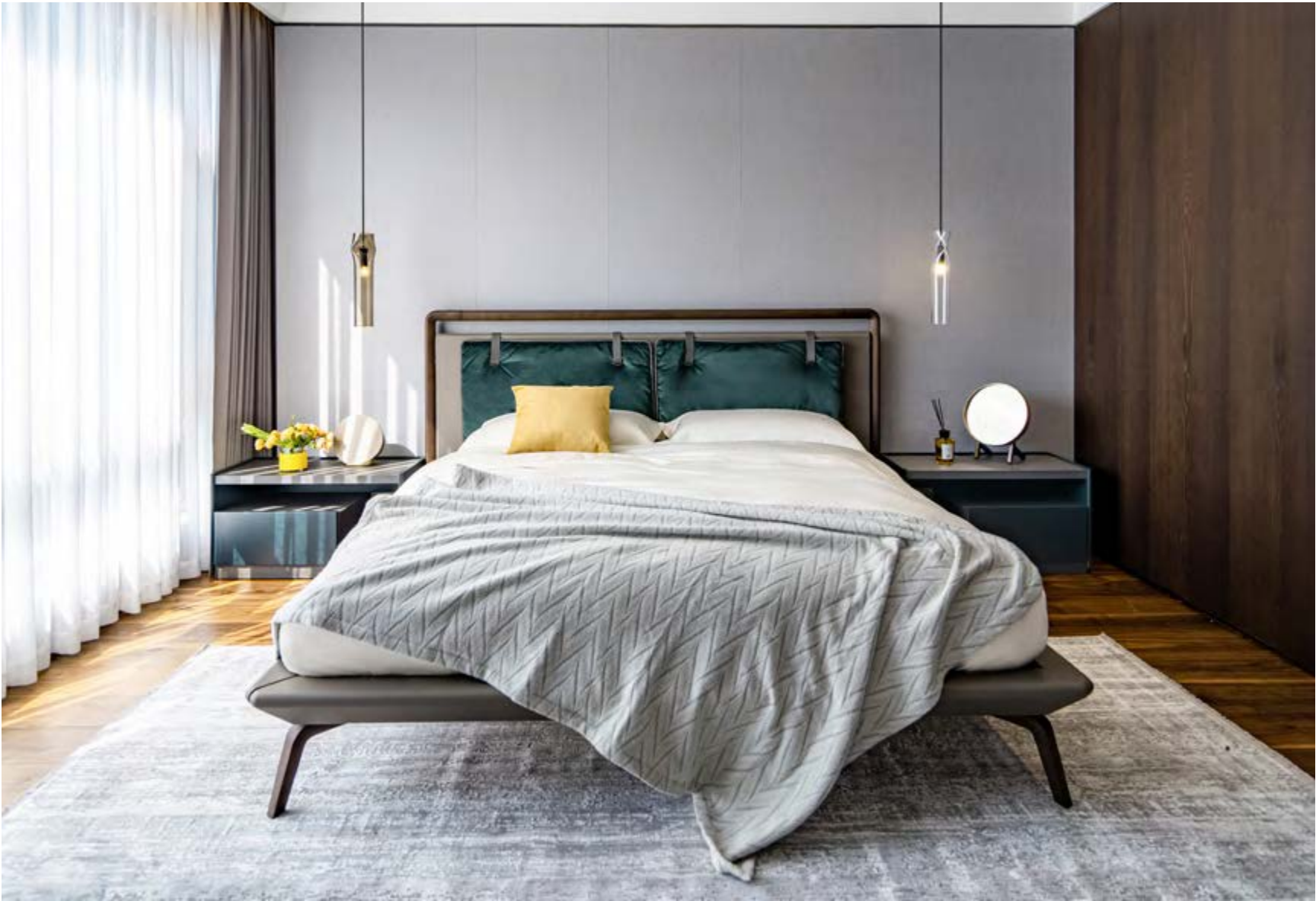
↑ ↗ Volare Due bed, Pelle Frau® leather Saddle Extra Polvere / fabric Vega col. 303 / ash in moka stain