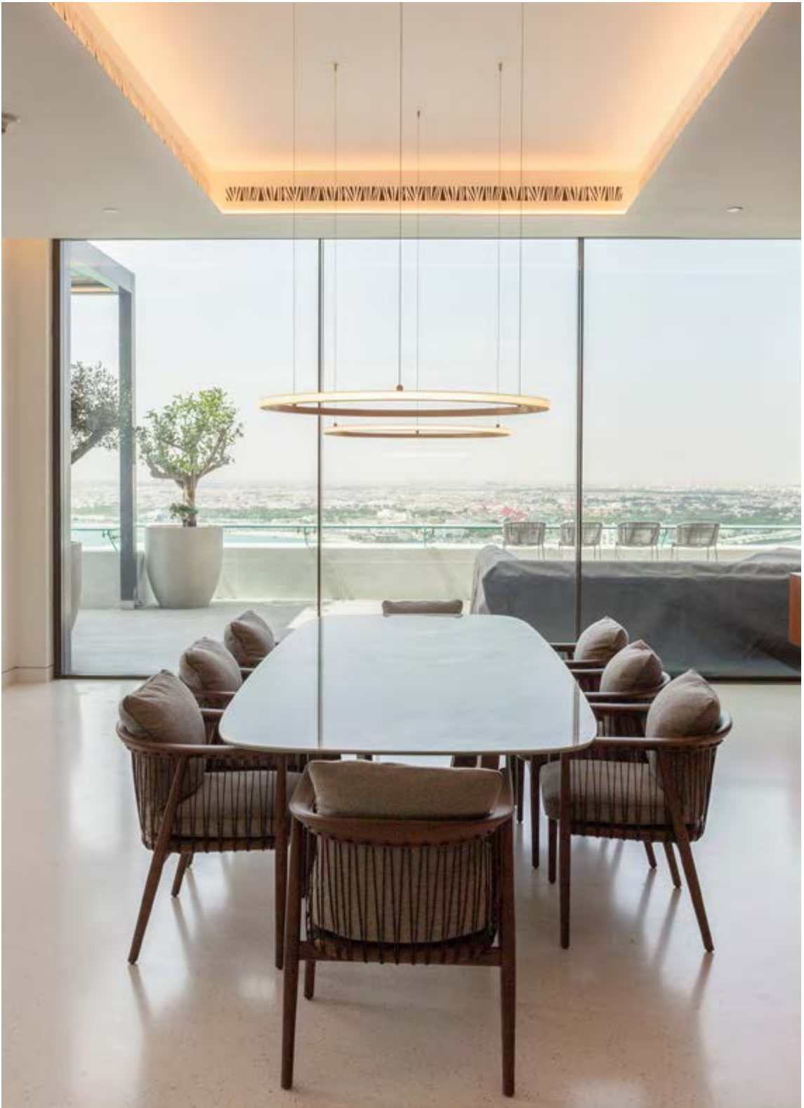
↶ ↑ Viola chair, fabric Bouclè col. 102 / ash in a moka stain structure ↶ Archibald stool, Pelle Frau® leather 274 Fresco Blue / ash in a moka stain base