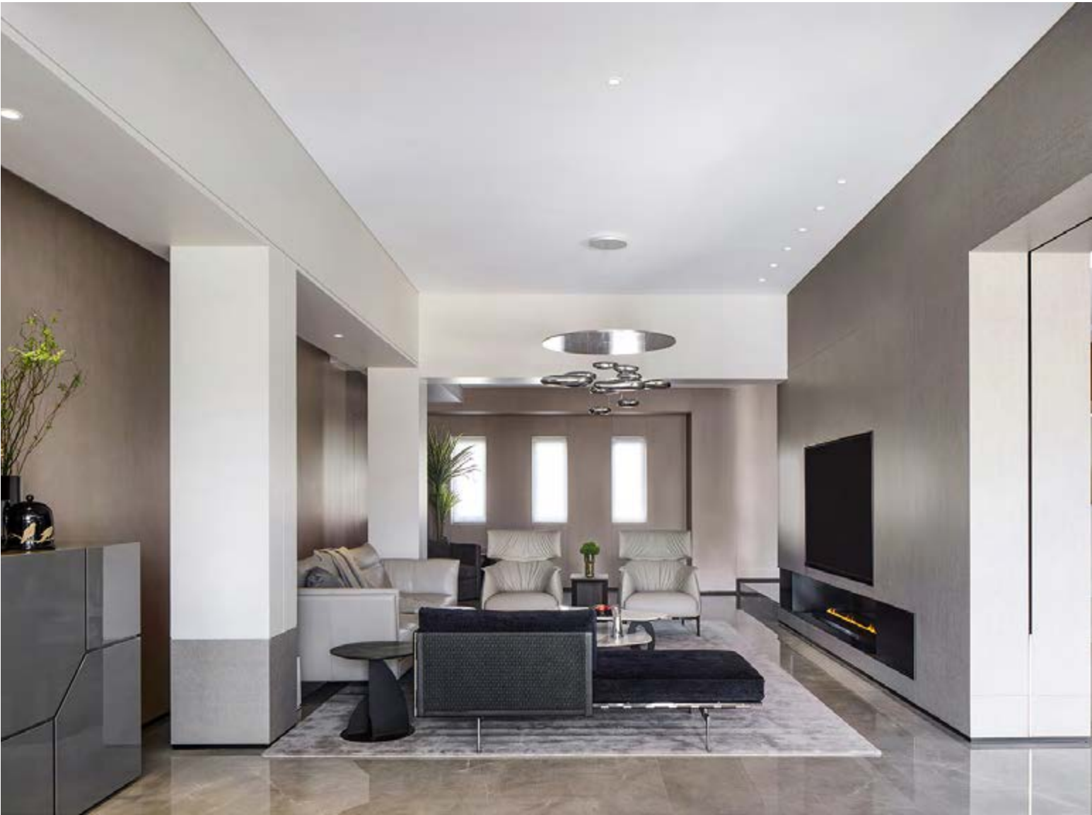
↑ ↗ Archibald King armchairs, Pelle Frau® leather SC 34 Maggese ↑ Bretagne sofa, Pelle Frau® leather Nest Salgamma ↑ Clayton chase longue, Pelle Frau® leather SC 20 Inchiostro / fabric Shine col. Black Iris