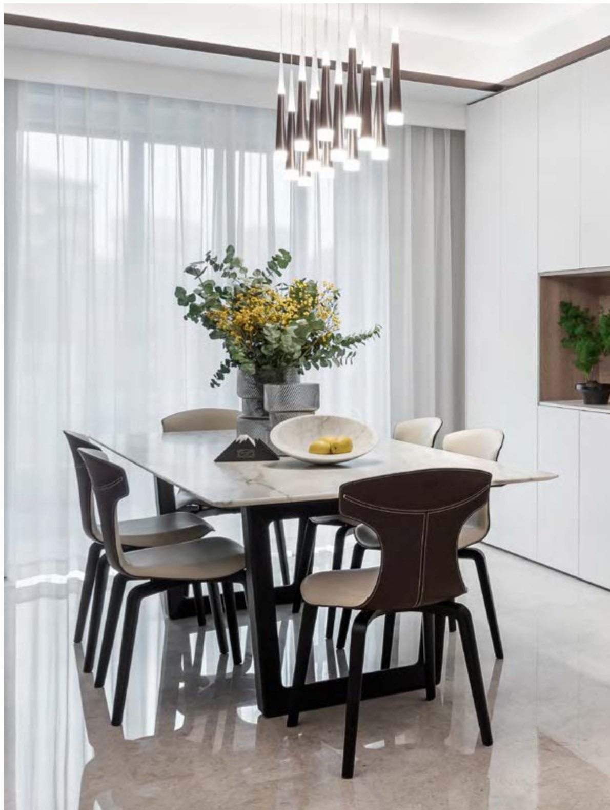
↑ ↗ Bolero table 220×110 , semi-brilliant Calacatta gold marble ↑ ↗ Montera chairs, Pelle Frau® leather Saddle Extra Testa di Moro / Pelle Frau® leather SC 51 Panna ↑ ↗ Rips large and small pot ↑ ↗ Pura bowl