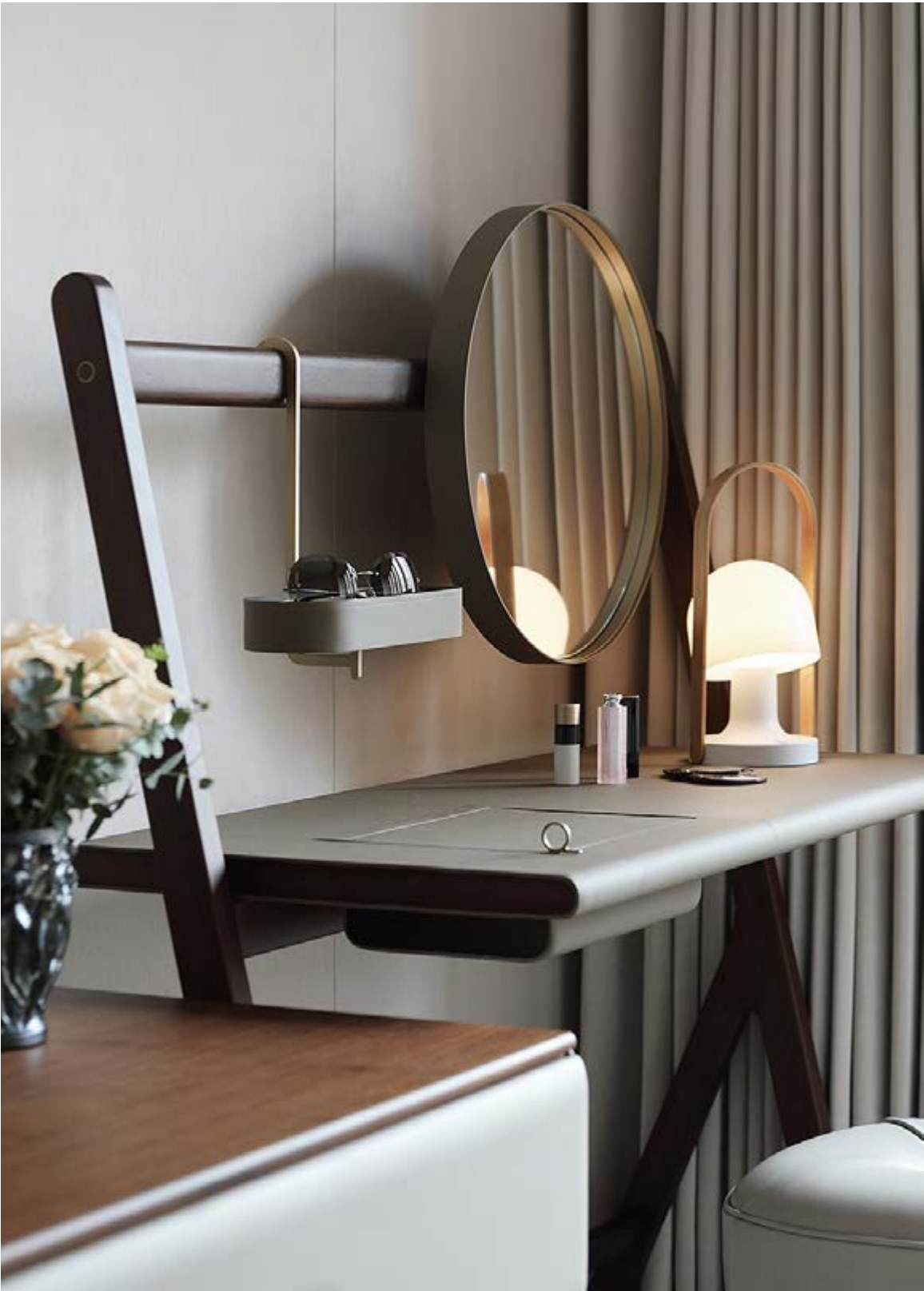
↑ ↗ Ren dressing table, Pelle Frau® leather Saddle Extra Talpa / Canaletto walnut ↗ Lepli 39×39 ottoman, Pelle Frau® leather SC 31 Quarzo Fumè ↗ Lola Darling bed, Pelle Frau® leather SC 31 Quarzo Fumè ↗ Moondance night table, Pelle Frau® leather SC 31 Quarzo Fumè / Canaletto walnut top and back ↗ Moondance chest of drawers, Pelle Frau® leather SC 31 Quarzo Fumè / Canaletto walnut top and back