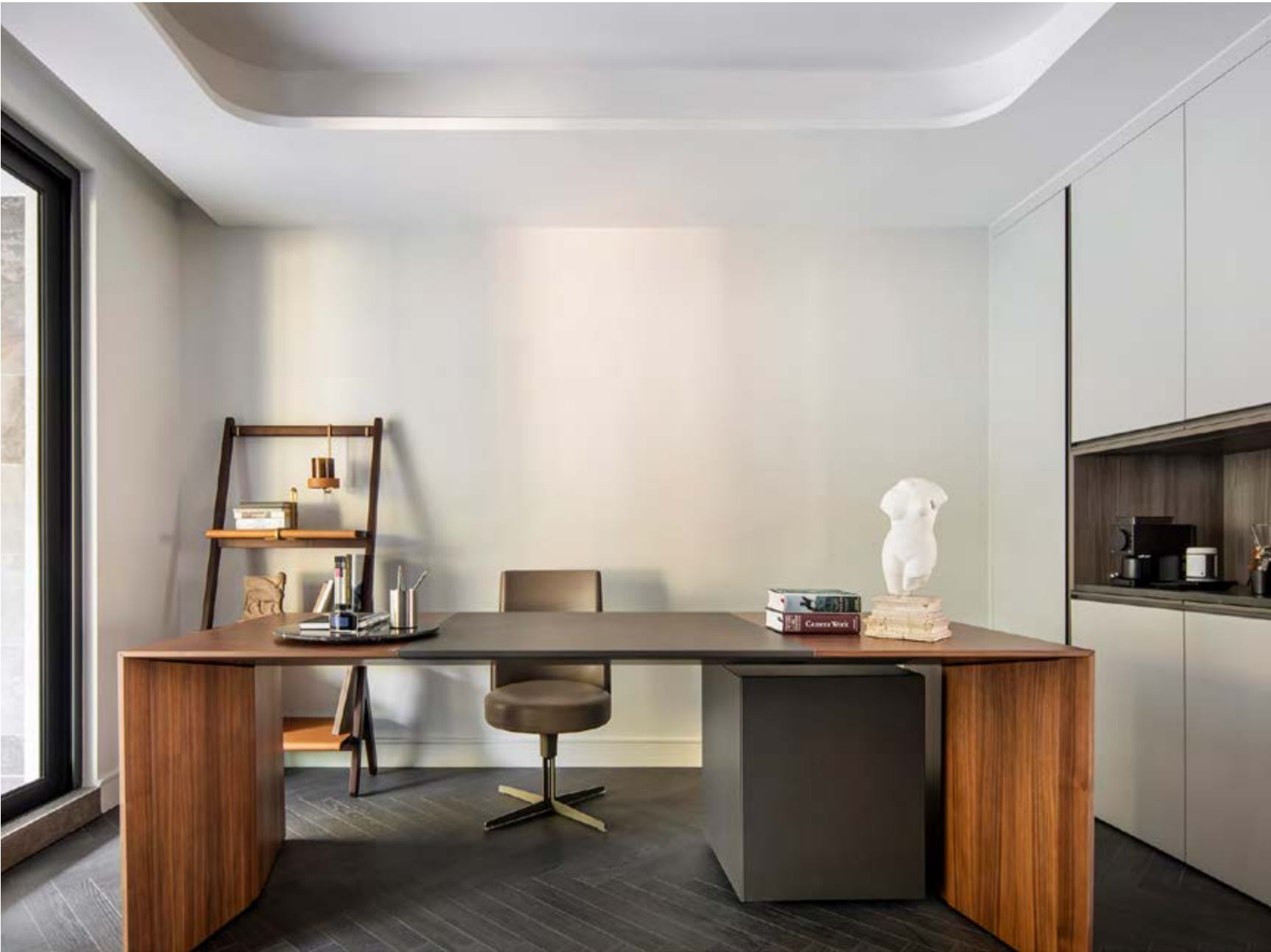
↑ Jeff chair with swivel base, Pelle Frau® leather Nest Pomice* ↑ ↗ Ren low bookcase, Pelle Frau® leather Saddle Extra Cammello / Canaletto walnut