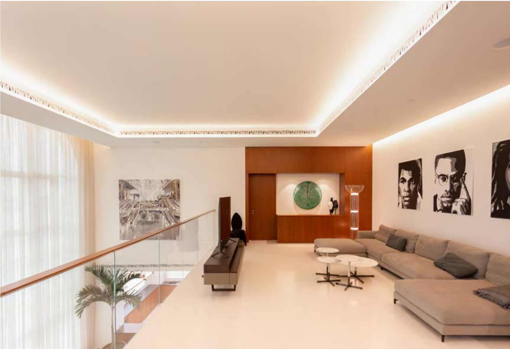
↑ Bob ø 45 h43 small table, Calacatta marble top ↑ Bob ø 80 h32 small table, Calacatta marble top ↗ Jay Lounge armchair and ottoman, Pelle Frau® leather SC 21 Amianto / steel burnished finish base