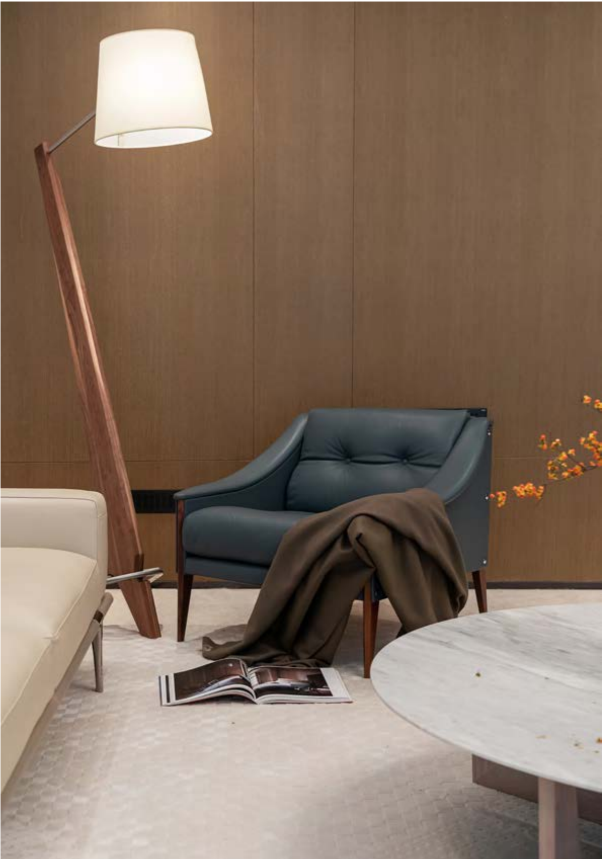
↶ Let it Be sofa, Pelle Frau® leather SC 51 Panna / Pelle Frau® Saddle Extra Corda ↑ Dezza 24 armchair, Pelle Frau® leather Nest Larimar