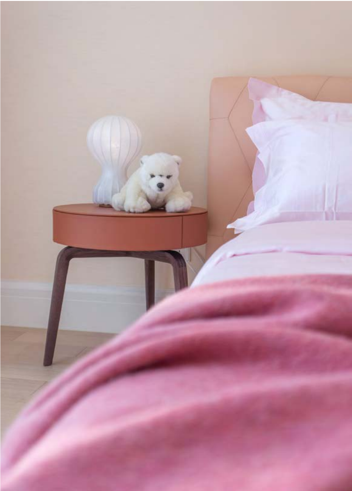
↶ Bluemoon bed, Pelle Frau® leather SC 72 Coriandolo* ↑ Fiorile with drawer, Pelle Frau® leather 75 Cognac* / ash in a moka stain base