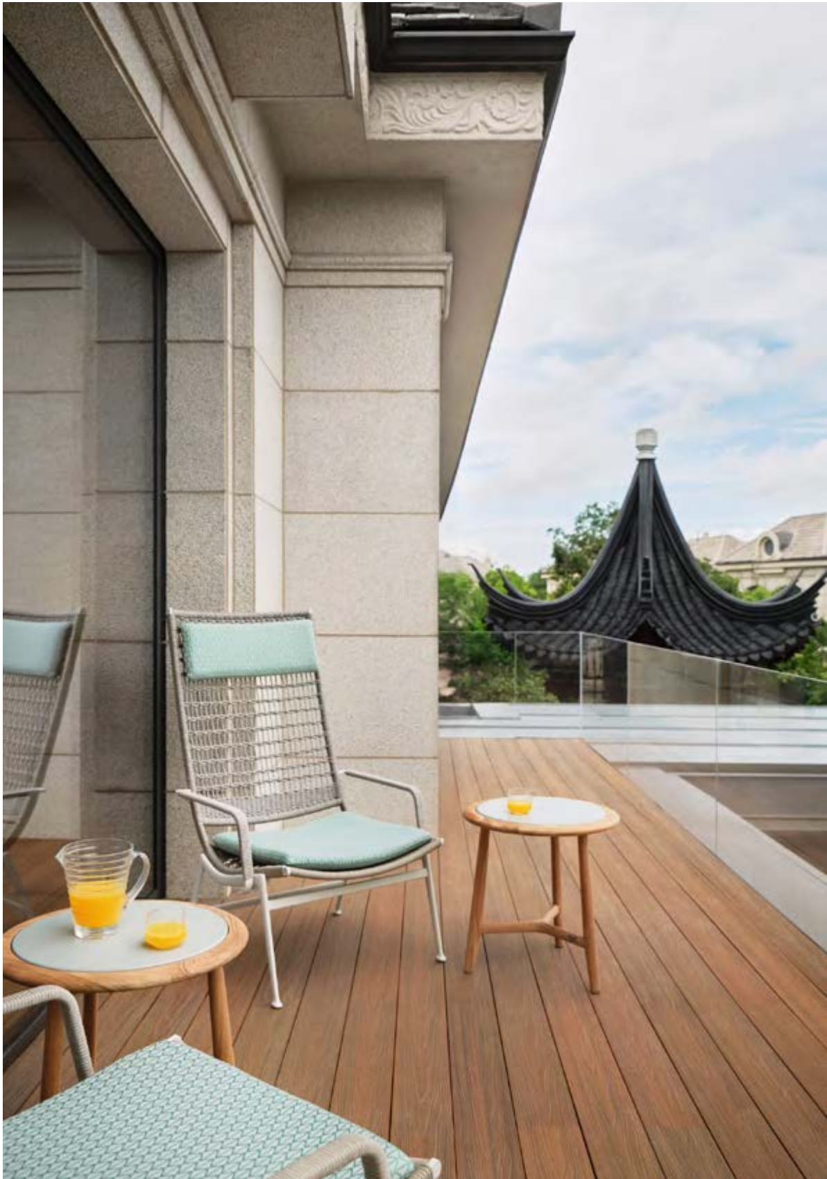
↖ Sparkler lamps, medium and small ↑ Solaria high back armchair with armrests, Loro Piana Interiors fabric Unito col. N Verde Acqua / stainless steel Gesso structure / Ecrù rope ↑ The Secret Garden ø 50 h52 small tables, Teak solid wood structure / Pale Green top