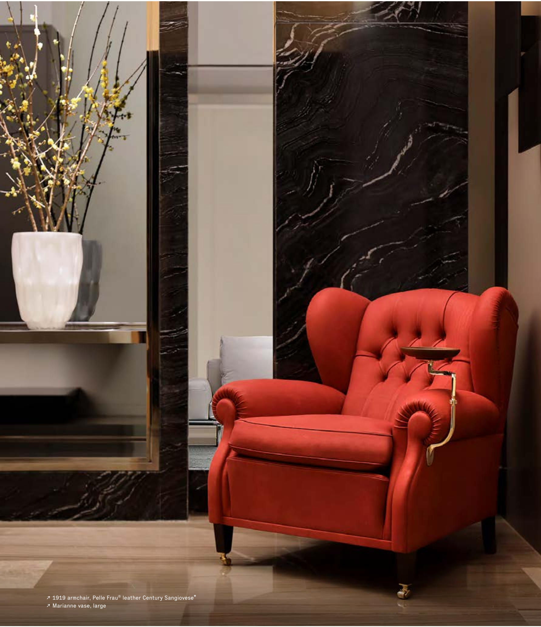
➤ 1919 armchair, Pelle Frau® leather Century Sangiovese* ➤ Marianne vase, large

By incorporating the classic design and exquisite quality of Poltrona Frau products, they have crafted a living space that opens the door to the hustle and bustle of the world, and when closed, fulfills all expectations of home for meals and seasons, providing satisfaction in every aspect.