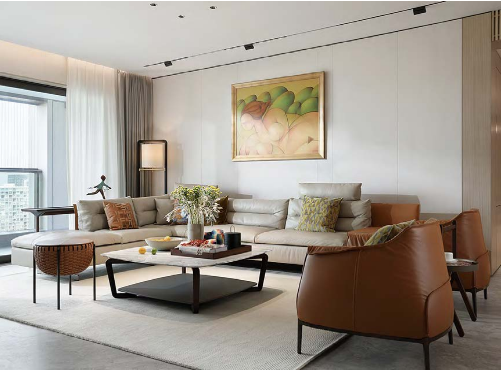
↑ Grantorino sofa, Pelle Frau® leather Saddle Extra Cammello / Nest Madreperla ↑ Journey decorative cushion, Tannery ↑ Fiorile 120×120 cm dual-shelf table, veined Arabescato marble / Pelle Frau® leather SC 26 Topo / ash in a moka stain ↑ Cestlavie ø46 small table with storage, Pelle Frau® leather Saddle Extra Cammello / SC 66 India/ Galvanised feet ↑ Fidelio lamp ↑ Archibald armchair, Pelle Frau® leather SC 66 India