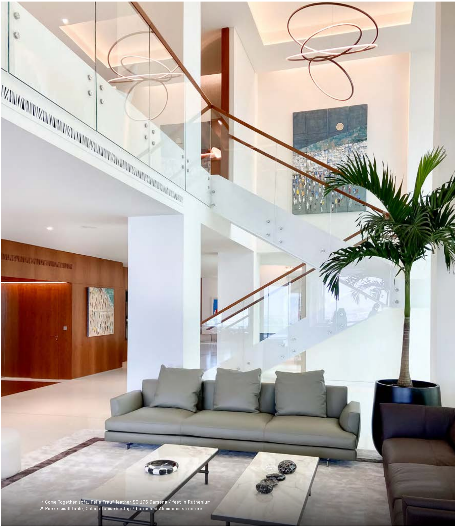
➤ Come Together sofa, Pelle Frau® leather SC 176 Darsena / feet in Ruthenium ➤ Pierre small table, Calacatta marble top / burnished Aluminium structure

Connecting the two levels is a sculptural white staircase, creating a double-height living space that exudes brightness and airiness. Elegant walnut boiserie with illuminated niches graces both levels. The finishes are distinguished by the use of neutral and warm colors, imparting a welcoming and sophisticated touch to the interiors of this coastal abode.