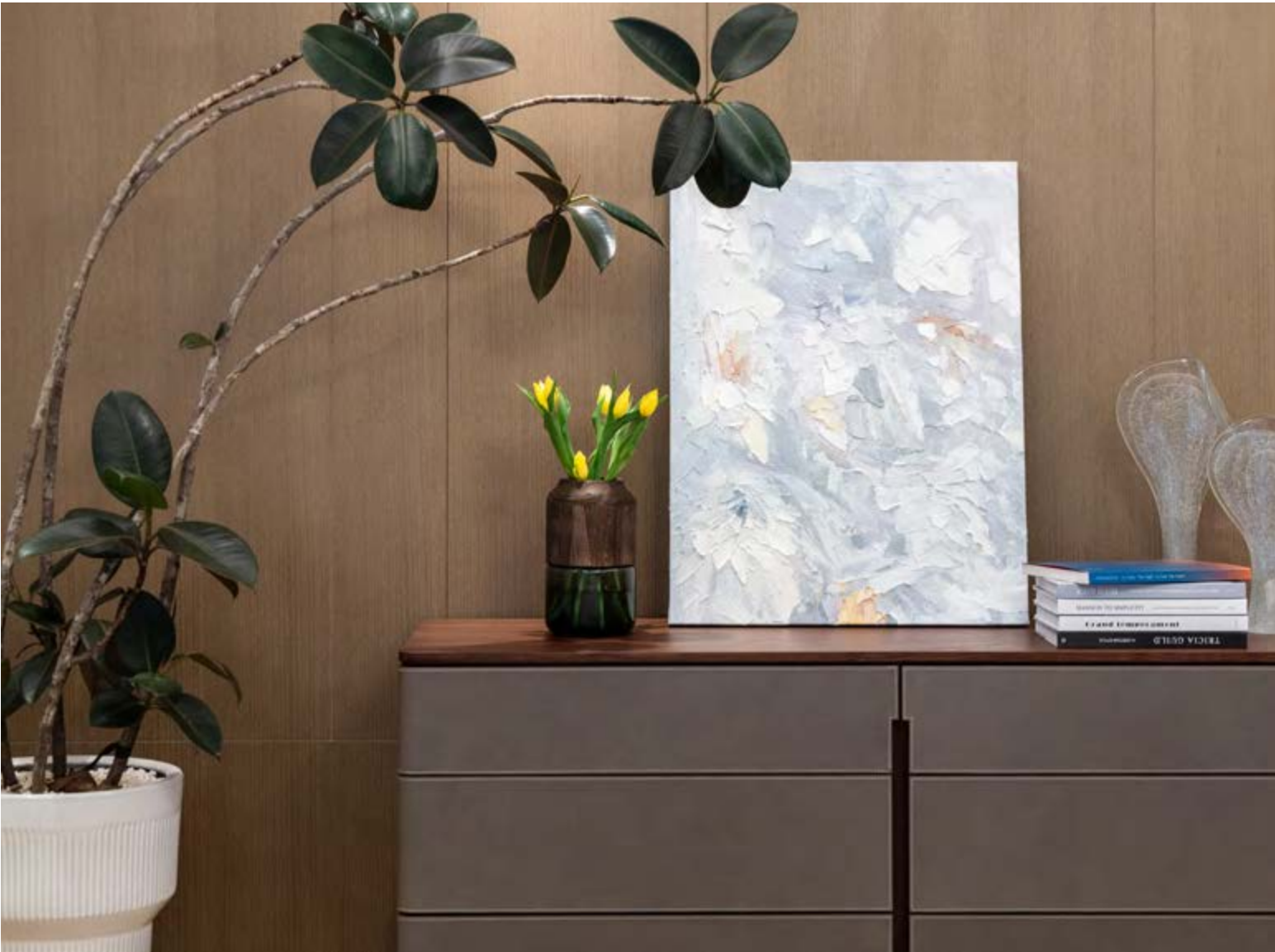
↑ Fidelio Notte chest of drawer, Pelle Frau® leather Saddle Extra Polvere / Canaletto walnut ↗ Isadora chair, Saddle Extra Polvere