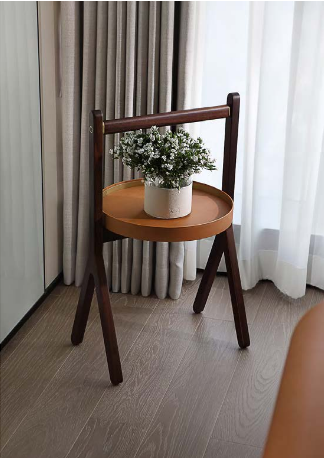
↑ ↗ Ren side table, Pelle Frau® leather Saddle Extra Cammello / Canaletto walnut structure ↑ Leather Pot wide vase, Pelle Frau® leather SC 06 Calicot ↗ Fred desk, Pelle Frau® leather Saddle Extra Cammello / ash in a wengè stain base ↗ Gingr chair, Pelle Frau® leather Saddle Extra Testa di Moro / SC 66 India / ash in a wengè stain base ↗ Turner bookcase, Pelle Frau® leather Saddle Executive Ink / Canaletto walnut