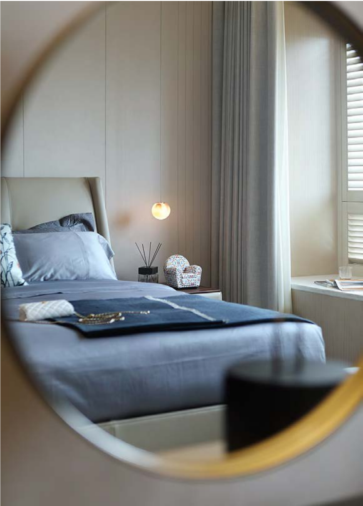
↑ Ren ø 75 round mirror, Pelle Frau® leather Saddle Extra Talpa / Canaletto walnut ↑ ↗ Suzie Wong bed, Pelle Frau® leather Nest Madreperla / ash in a moka stain feet ↗ Moondance night table, Pelle Frau® leather Nest Madreperla / Canaletto walnut top and back ↗ Lepli 39x39 ottoman, Pelle Frau® leather Nest Calcedonio