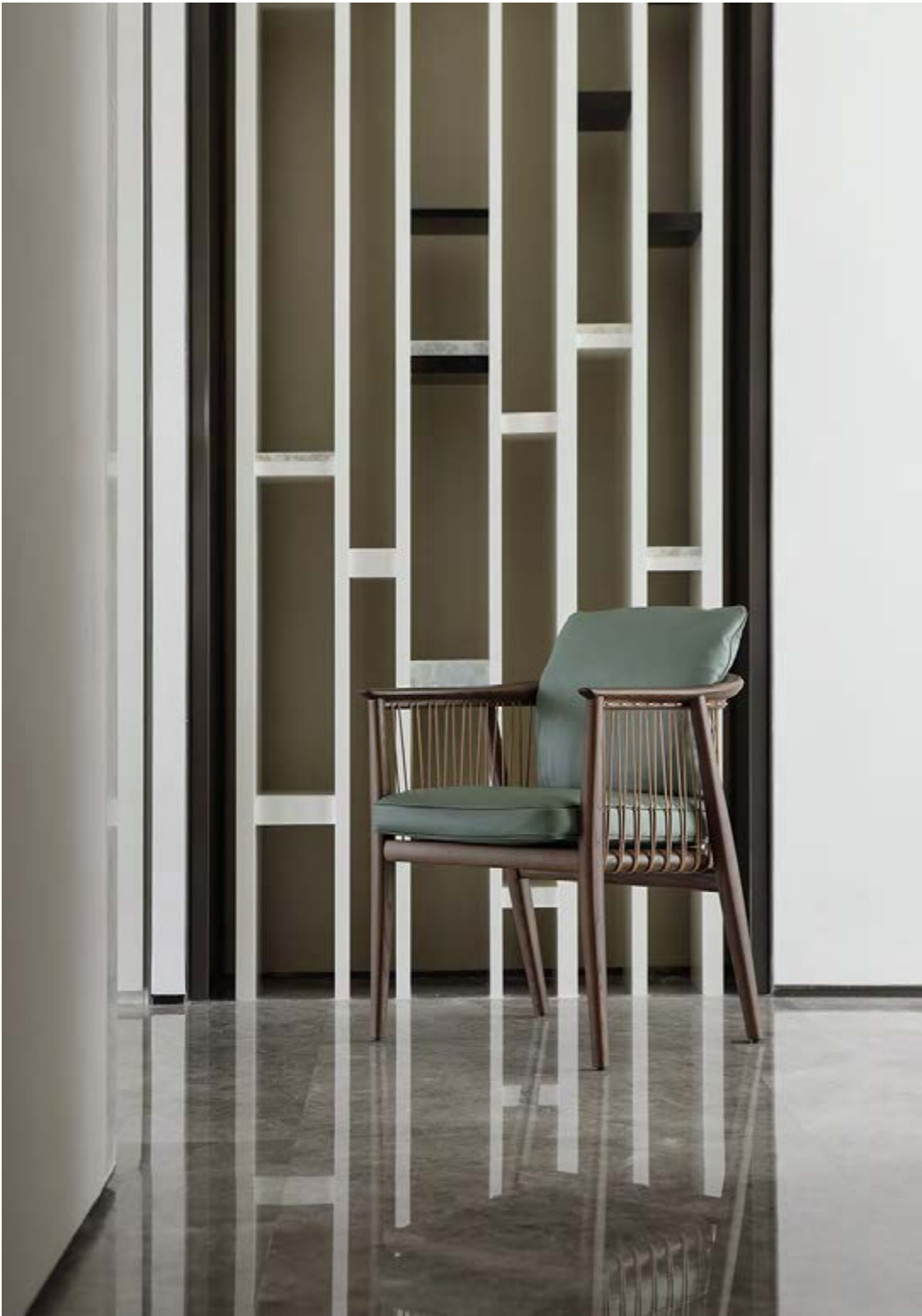
↖ Fidelio Console, brilliant Calacatta marble top / 32 Ash in a wengé stain base ↖ Leather Pot vase, Pelle Frau® leather SC 255 Belladonna ↑ Viola small armchair, Pelle Frau® leather SC 180 Celadon / ash in a moka stain feet