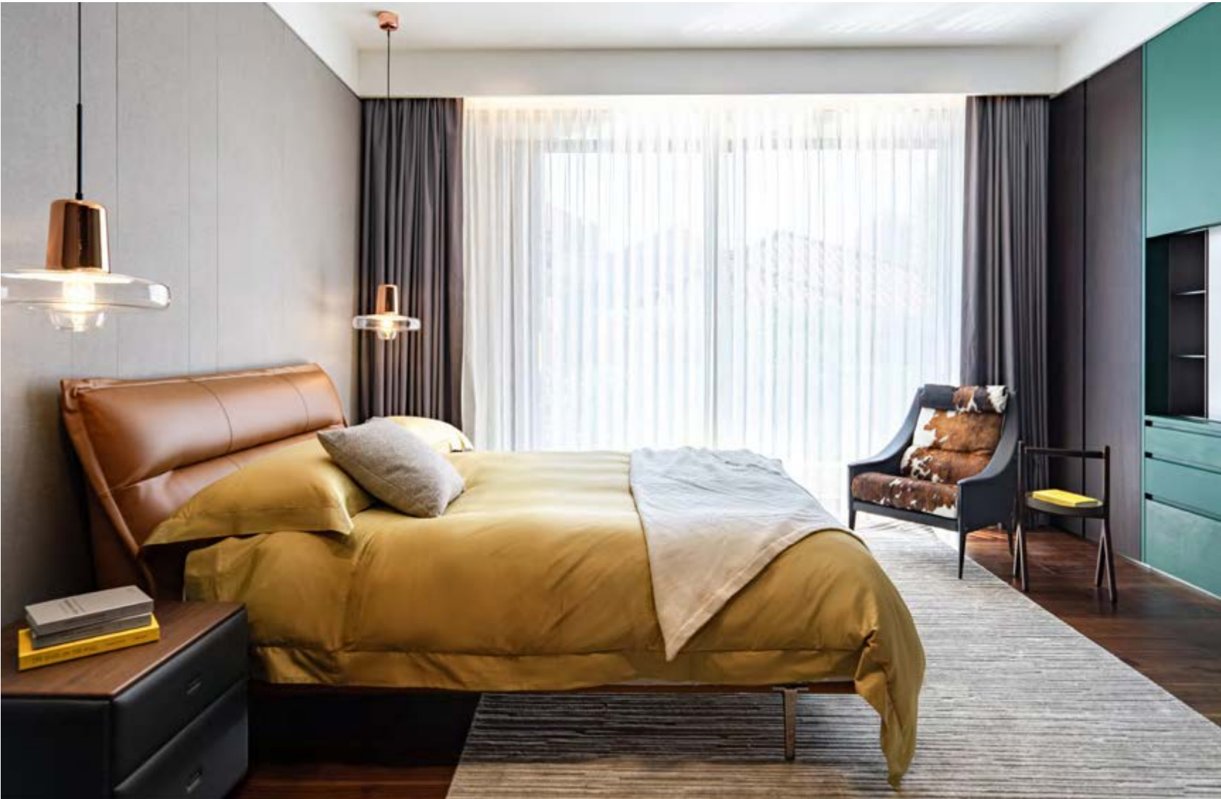
↑ Mr Moonlight bed, Pelle Frau® leather Saddle Extra Cammello / SC 66 India ↑ ↗ Moondance night table, Pelle Frau® leather SC 176 Darsena / Canaletto walnut ↑ Dezza 48 armchair, Pelle Frau® leather SC 20 Inchiostro / Cavallino "brown spots" ↑ Ren side table, Pelle Frau® leather Saddle Extra Polvere / Canaletto walnut ↗ Coupè bed, Pelle Frau® leather SC 176 Darsena / fabric Milano col. 03 ↑ Nivola sofa, Pelle Frau® leather SC 176 Darsena / fabric Milano col. 03 ↗ Bob coffee table Ø 45 h 52, Pelle Frau® leather SC 176 Darsena