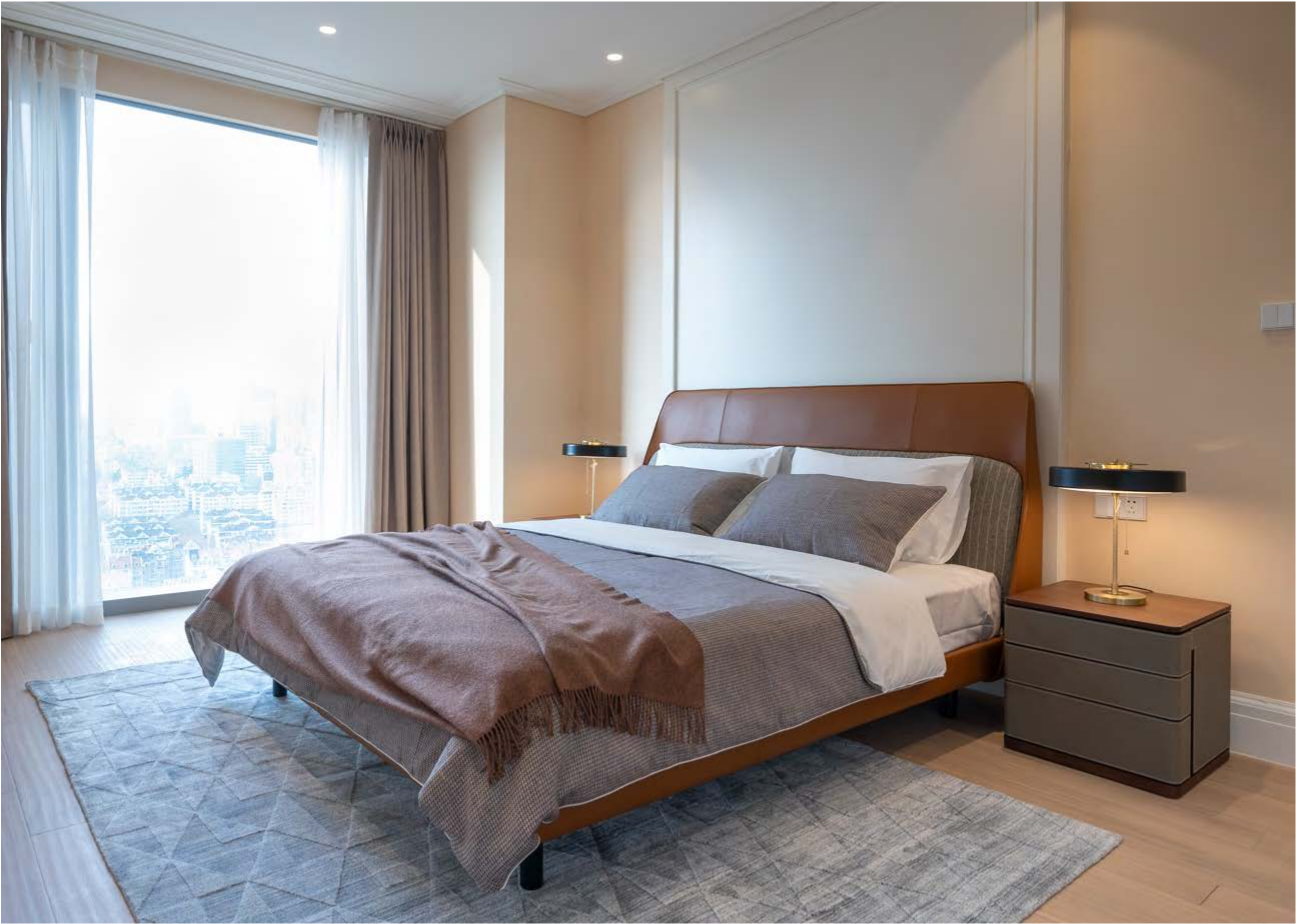
➤ Coupè bed, Pelle Frau® leather SC 68 Sahara / fabric London col. Gray ➤ Fidelio Notte night table, Pelle Frau® leather Saddle Extra Talpa / Canaletto walnut top