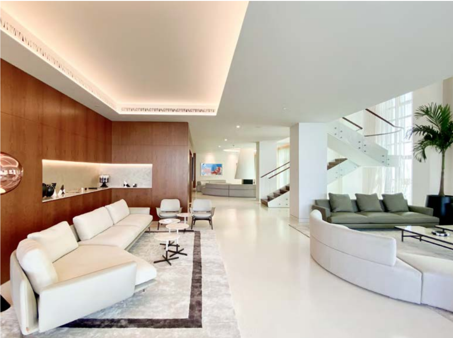
↑ Get Back sofa, Pelle Frau® leather SC 31 Quarzo Fumè / fabric Gabàn col. 01 / Ruthenium feet ↑ Martha armchair, Pelle Frau® leather Saddle Extra Polvere / Pelle Frau® leather Nest Luna / ash in a moka stain legs ↑ Bob ø 45 h52 small tables, Calacatta marble top ↗ Bretagne sofa, Pelle Frau® leather SC 80 Bruno Havana / aluminum in a gunmetal grey base ↗ Willy armchair, Pelle Frau® leather Nest Pomice ↗ Pierre small table, Calacatta marble top / burnished Aluminium structure