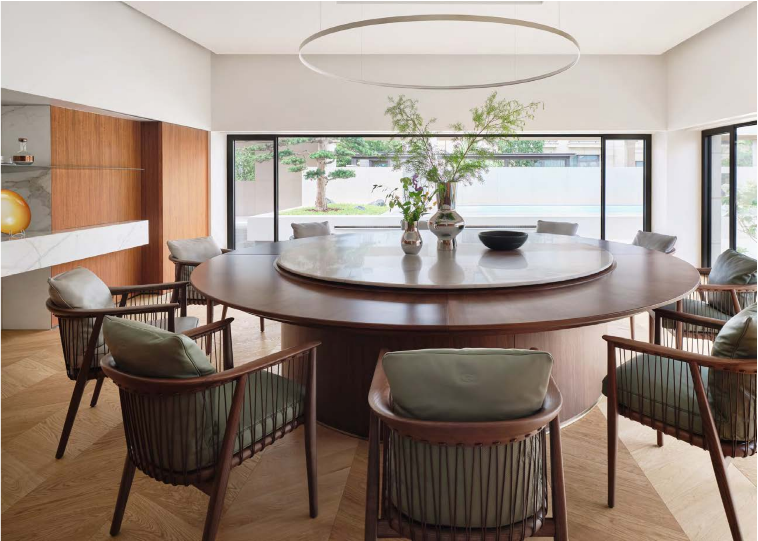
↗ Viola chairs, Pelle Frau® leather SC 180 Celadon / leather cording dark brown / ash in a moka stain structure