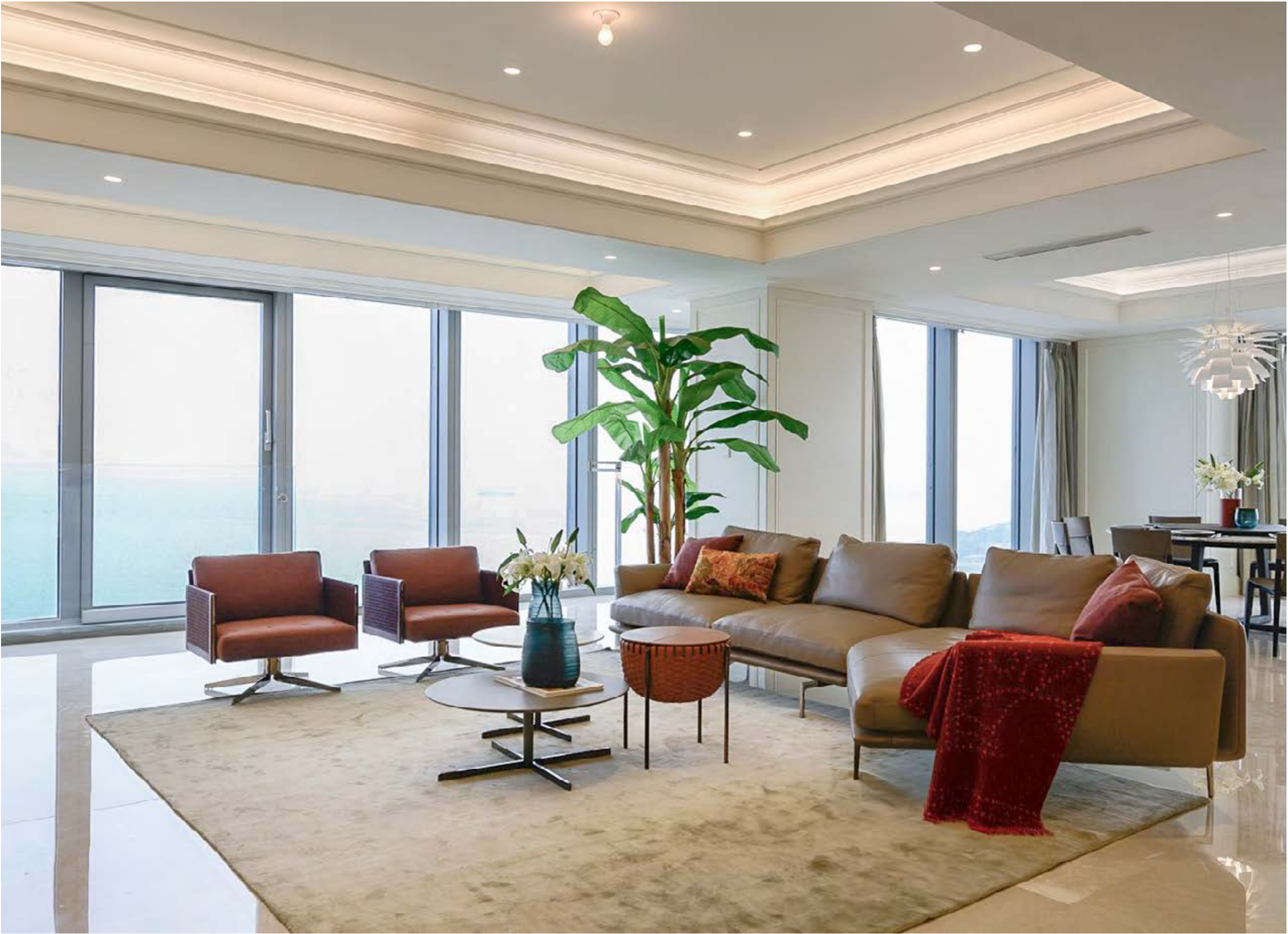
➤ Get Back sofa, Pelle Frau® leather Nest Pomice ➤ Clayton armchair, Pelle Frau® leather Soul Diana / fabric Giano col. 9 (lighter side) / ruthenium feet ➤ Cestlavie ø46 small table with storage, Pelle Frau® leather Saddle Extra Cammello / gunmetal grey finish aluminium