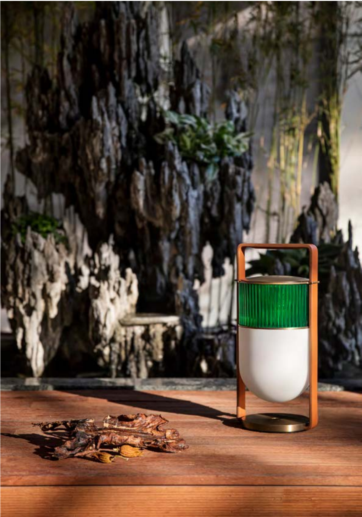
↑ Xi table lamp, emerald glass / Pelle Frau® leather Saddle Extra Cammello