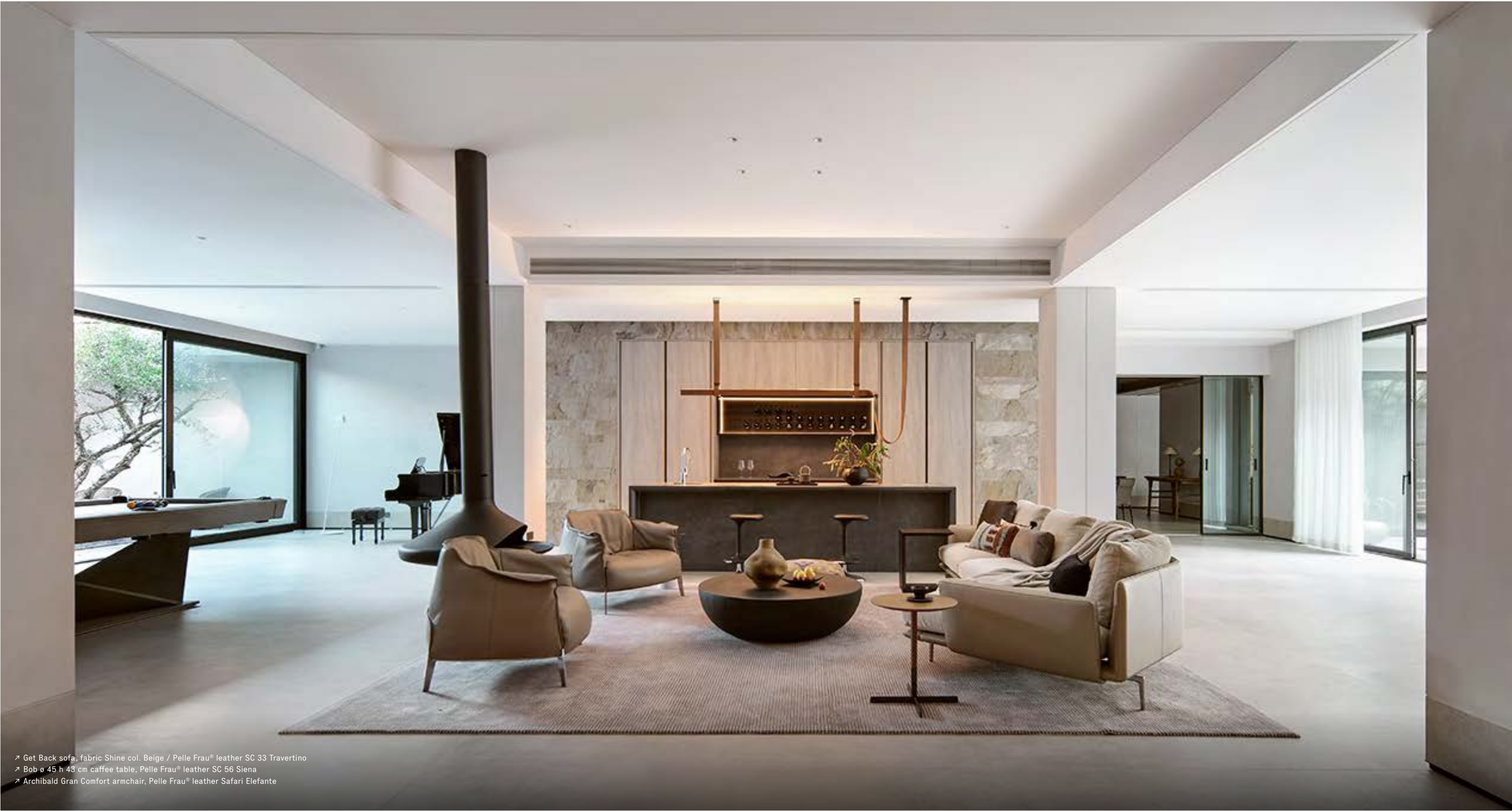
➤ Get Back sofa, fabric Shine col. Beige / Pelle Frau® leather SC 33 Travertino ➤ Bob ø 45 h 43 cm caffè table, Pelle Frau® leather SC 56 Siena ➤ Archibald Gran Comfort armchair, Pelle Frau® leather Safari Elefante