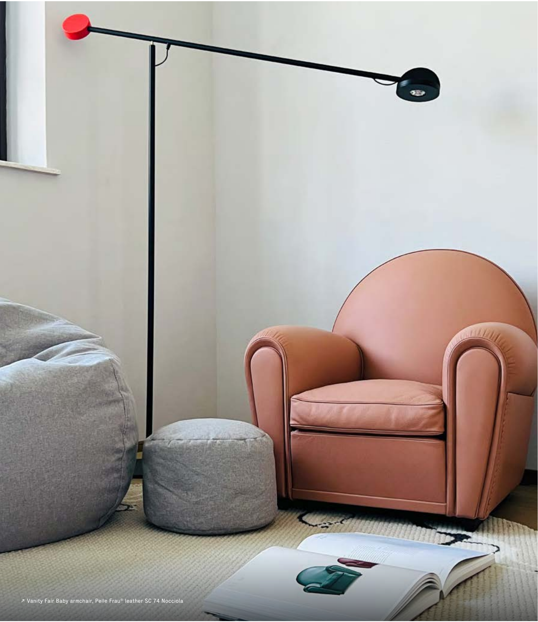
➤ Vanity Fair Baby armchair, Pelle Frau® leather SC 74 Nocciola

The Poltronafrau series of products integrate appearance and color into space, endowing space value with creative spirit and professional expression.