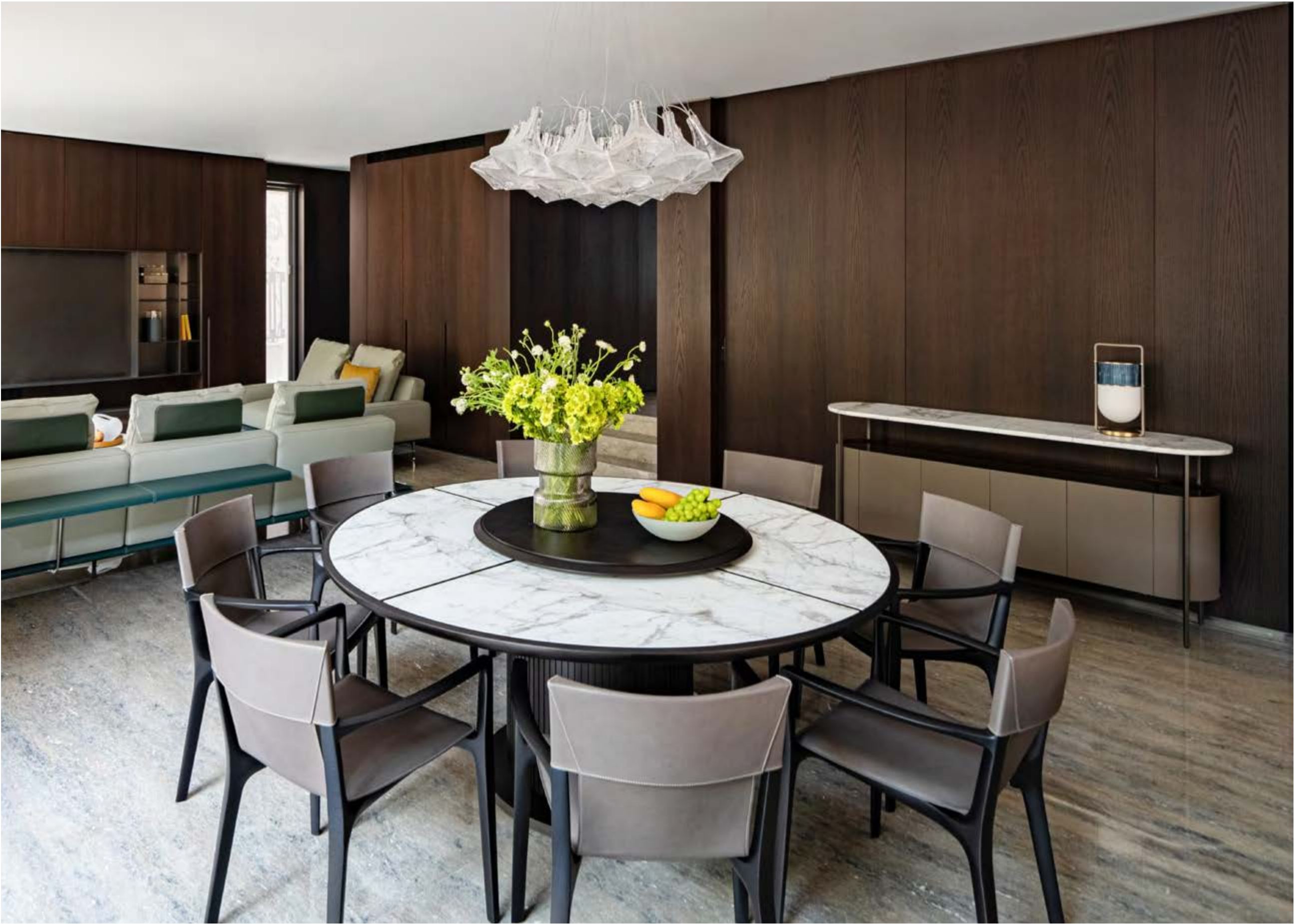
➤ Isadora chairs, Pelle Frau® leather Saddle Extra Polvere / ash in a wenge stain ➤ Mi low cabinet, Pelle Frau® leather Saddle Extra Polvere / brilliant Calacatta gold marble top ➤ Xi table lamp, sapphire glass