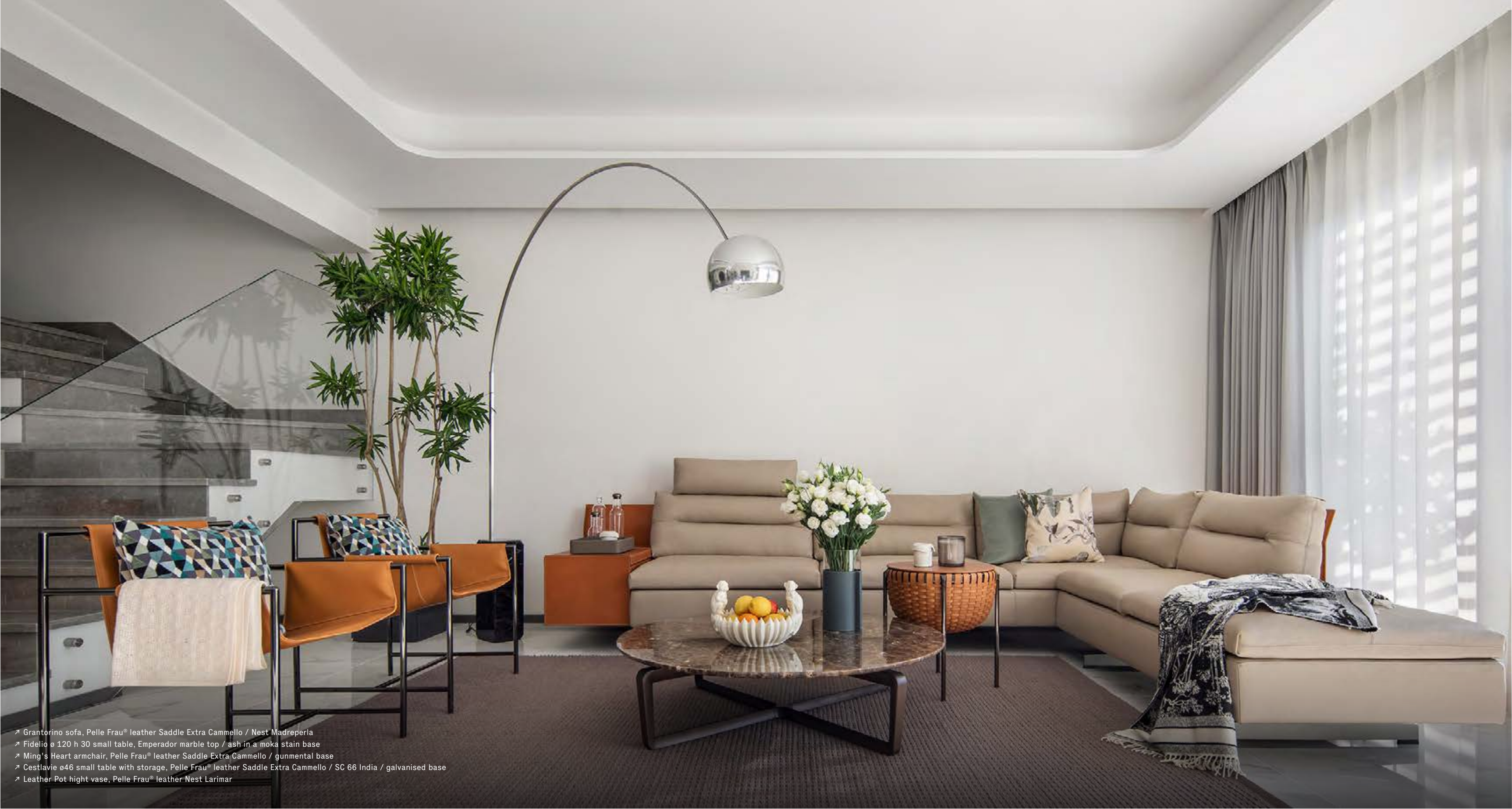
➤ Grantorino sofa, Pelle Frau® leather Saddle Extra Cammello / Nest Madreperla ➤ Fidelio ø 120 h 30 small table, Emperador marble top / ash in a moka stain base ➤ Ming's Heart armchair, Pelle Frau® leather Saddle Extra Cammello / gunmental base ➤ Cestlavie ø46 small table with storage, Pelle Frau® leather Saddle Extra Cammello / SC 66 India / galvanised base ➤ Leather Pot hight vase, Pelle Frau® leather Nest Larimar