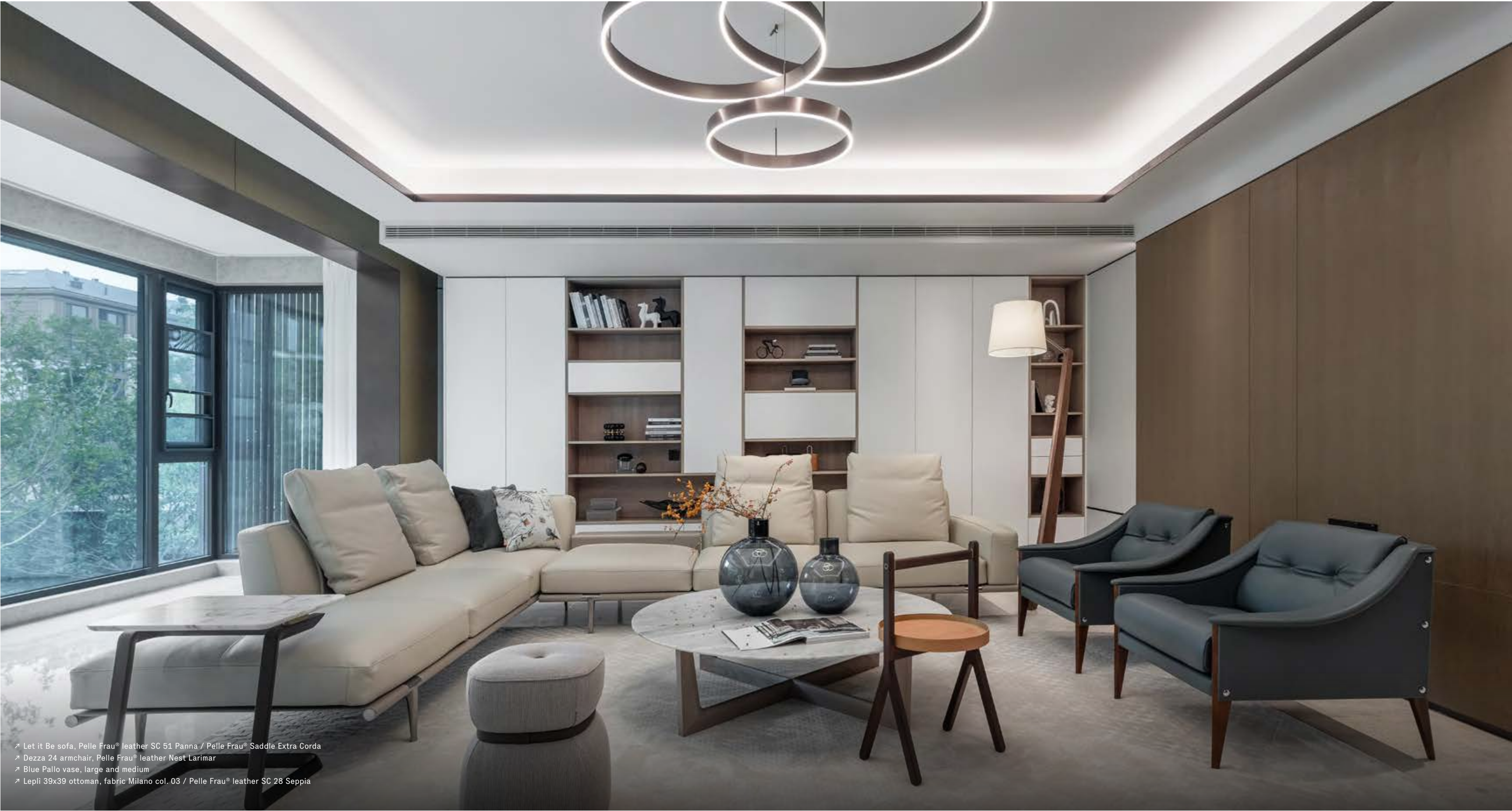
➤ Let it Be sofa, Pelle Frau® leather SC 51 Panna / Pelle Frau® Saddle Extra Corda ➤ Dezza 24 armchair, Pelle Frau® leather Nest Larimar ➤ Blue Pallo vase, large and medium ➤ Lepli 39x39 ottoman, fabric Milano col. 03 / Pelle Frau® leather SC 28 Seppia