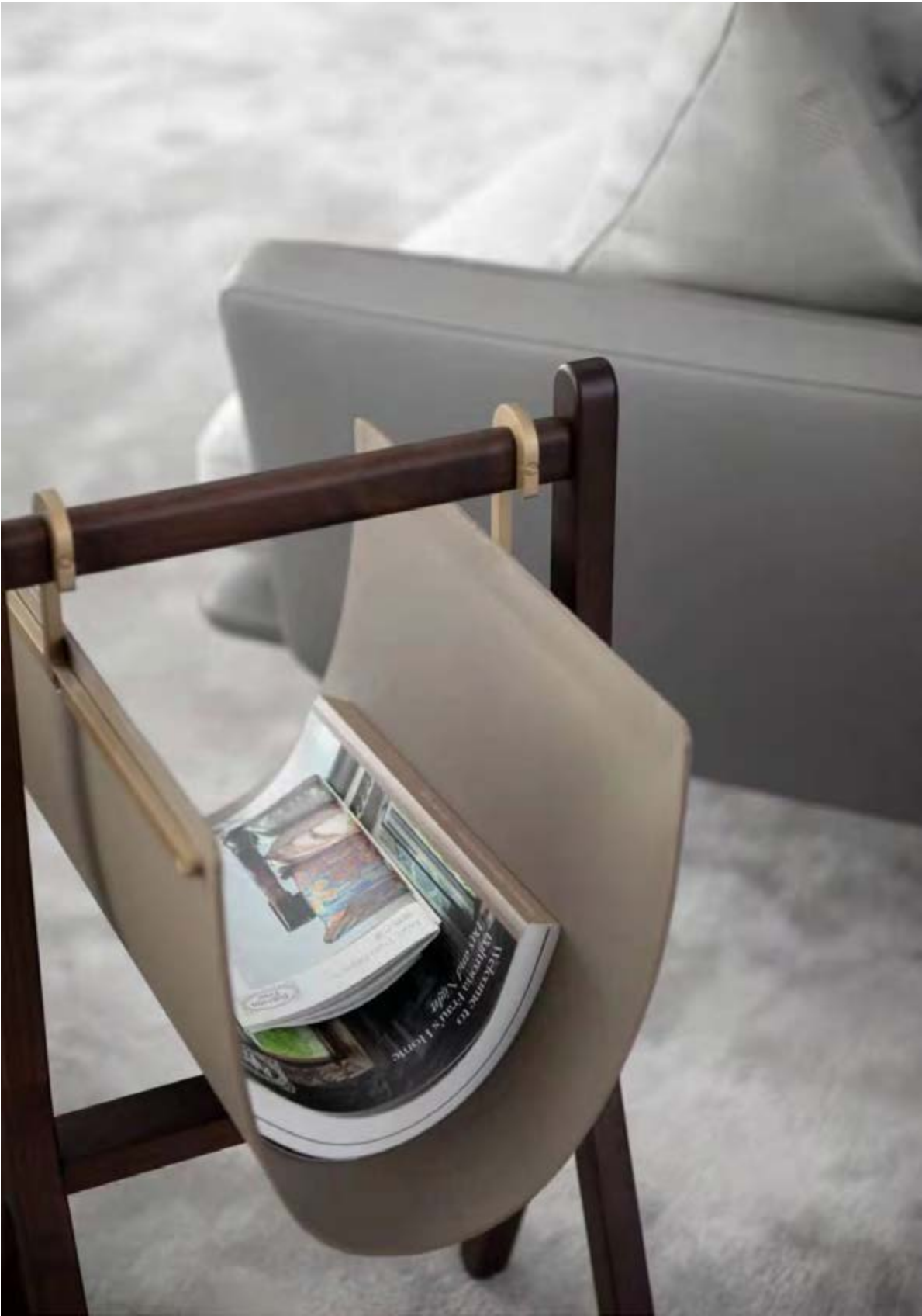
↖ Pillow armchair, Pelle Frau® leather SC 128 Carminio ↖ Mini Vanity Fair, Pelle Frau® leather SC 128 Carminio ↑ Ren magazine rack, Pelle Frau® leather Saddle Extra Talpa