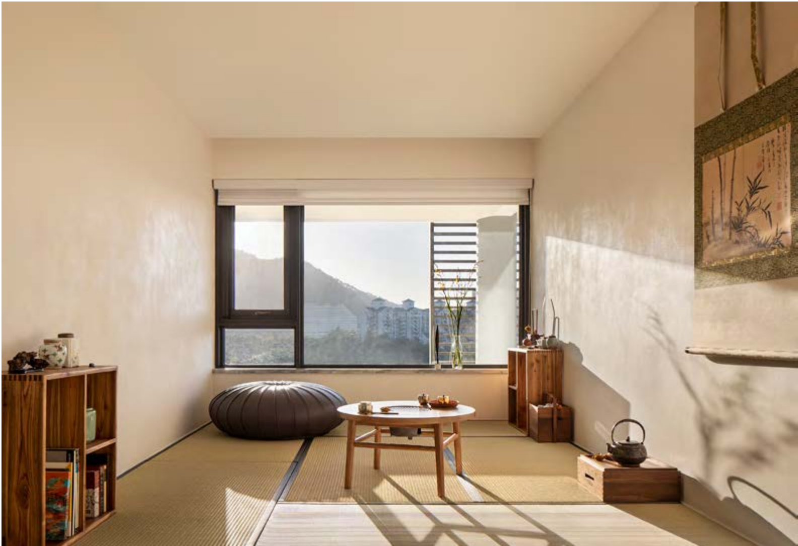
↑ ↖ Esdra ottoman, Pelle Frau® leather SC 258 Mist