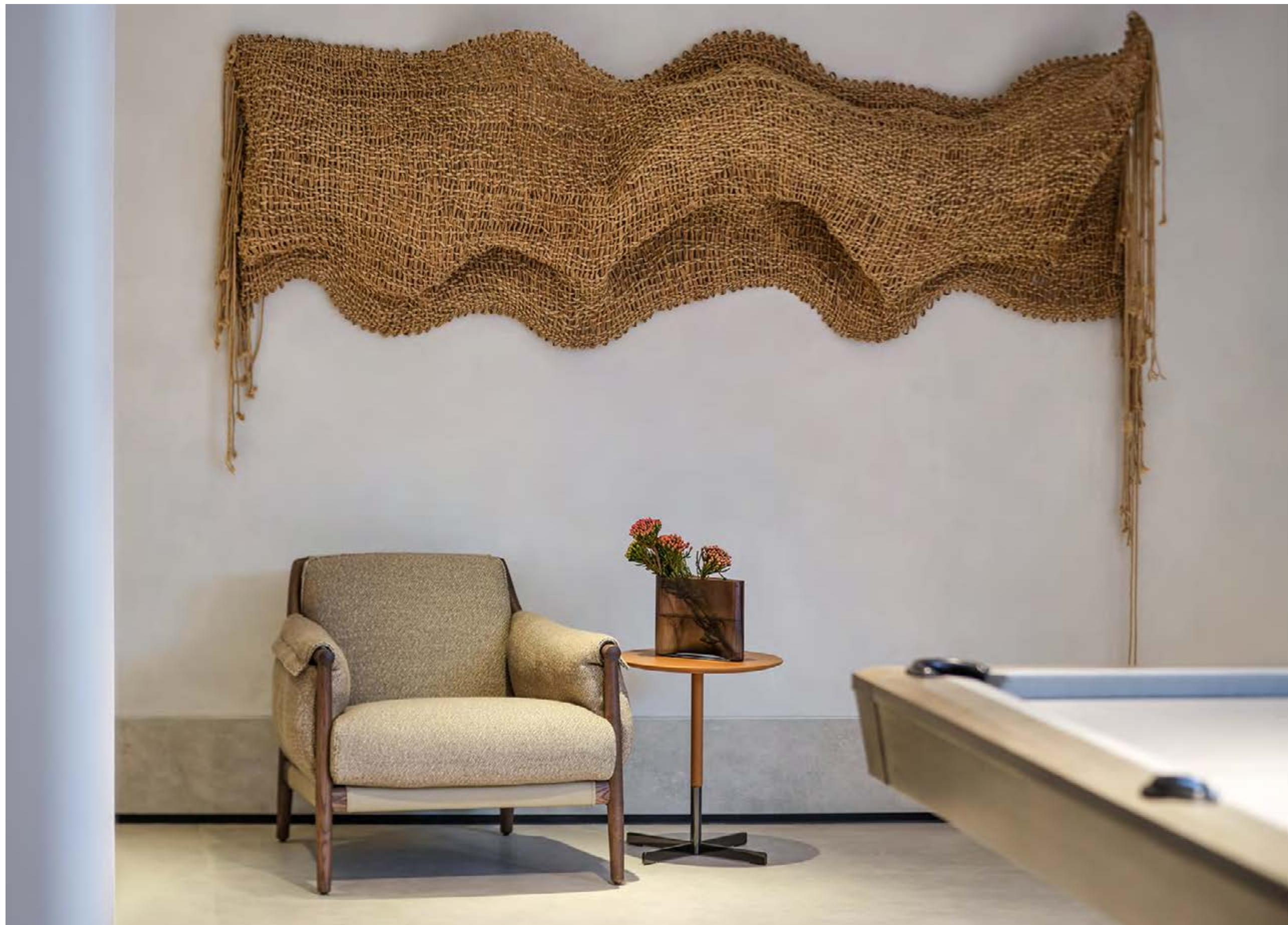
↵ Times Lounge armchair, Pelle Frau® leather SC 33 Travertino / fabric Gaban col. 5403 ↵ Bob coffee table Ø 45 h 52, Pelle Frau® leather SC 66 India