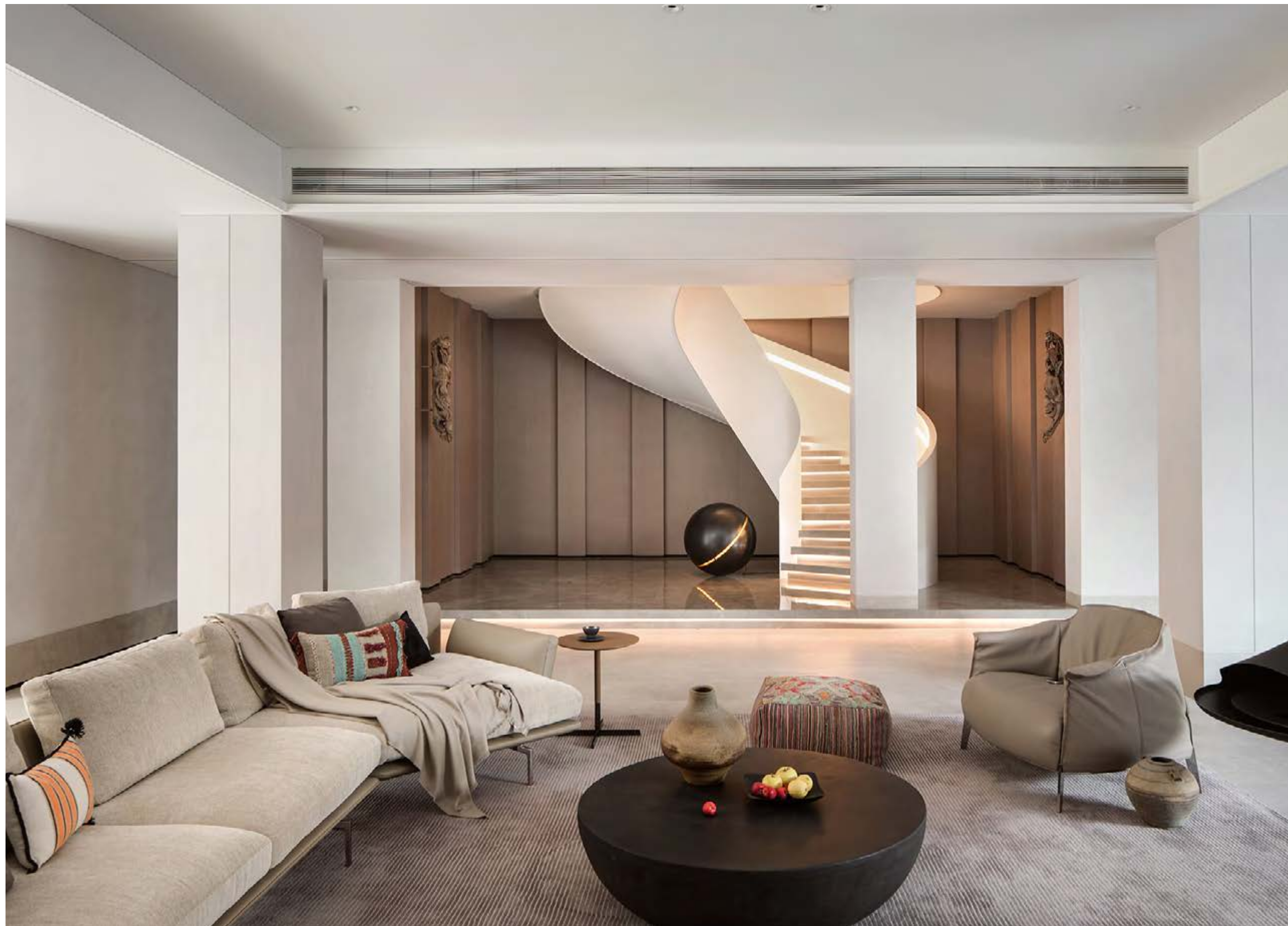
↖ Get Back sofa, Pelle Frau® leather SC 33 Travertino / fabric Shine col. Beige ↖ Archibald Gran Comfort, Pelle Frau® leather Safari Elefante ↖ Bob coffee table Ø 45 h 52, Pelle Frau® leather SC 56 Siena