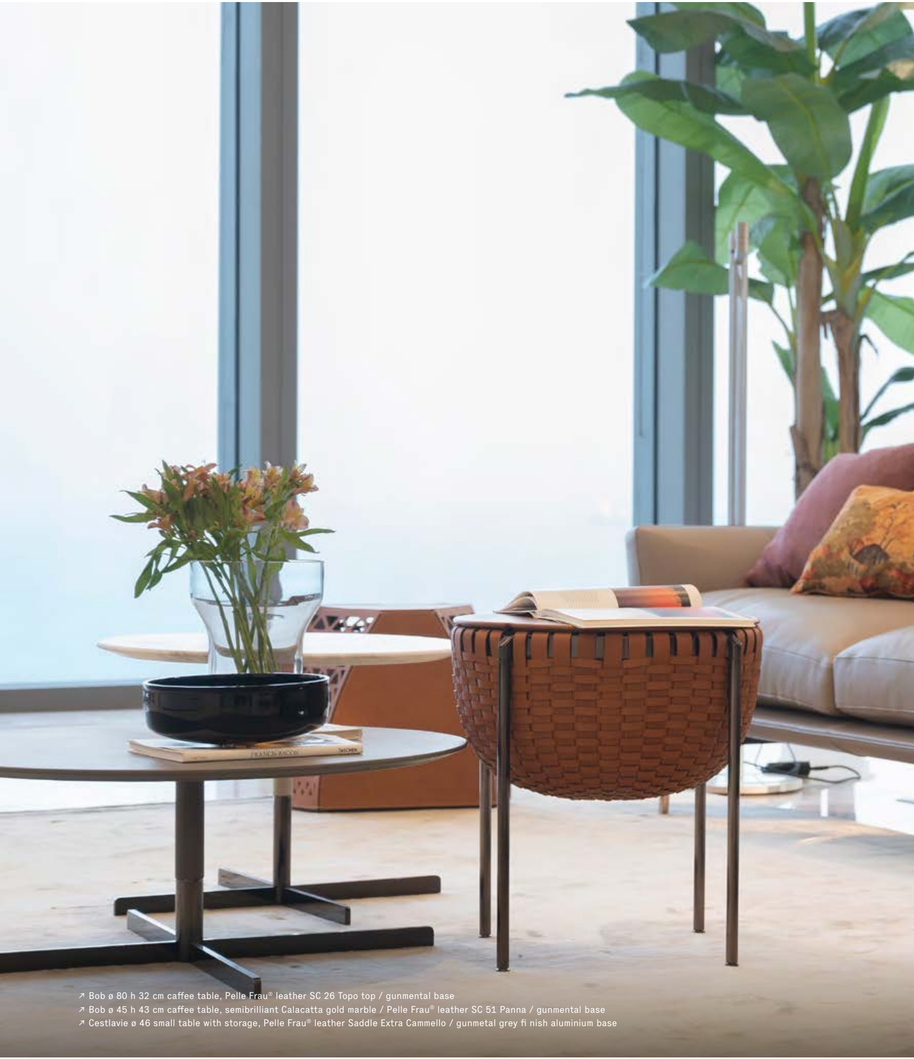
➤ Bob ø 80 h 32 cm coffee table, Pelle Frau® leather SC 26 Topo top / gunmetal base ➤ Bob ø 45 h 43 cm coffee table, semibrilliant Calacatta gold marble / Pelle Frau® leather SC 51 Panna / gunmetal base ➤ Cestlavie ø 46 small table with storage, Pelle Frau® leather Saddle Extra Cammello / gunmetal grey finish aluminium base

Whether it is the morning sun or the sunset, here you can overlook the bustling city, admire the blue sea, find the joy of life in comfort, and enjoy a drink outside the window.