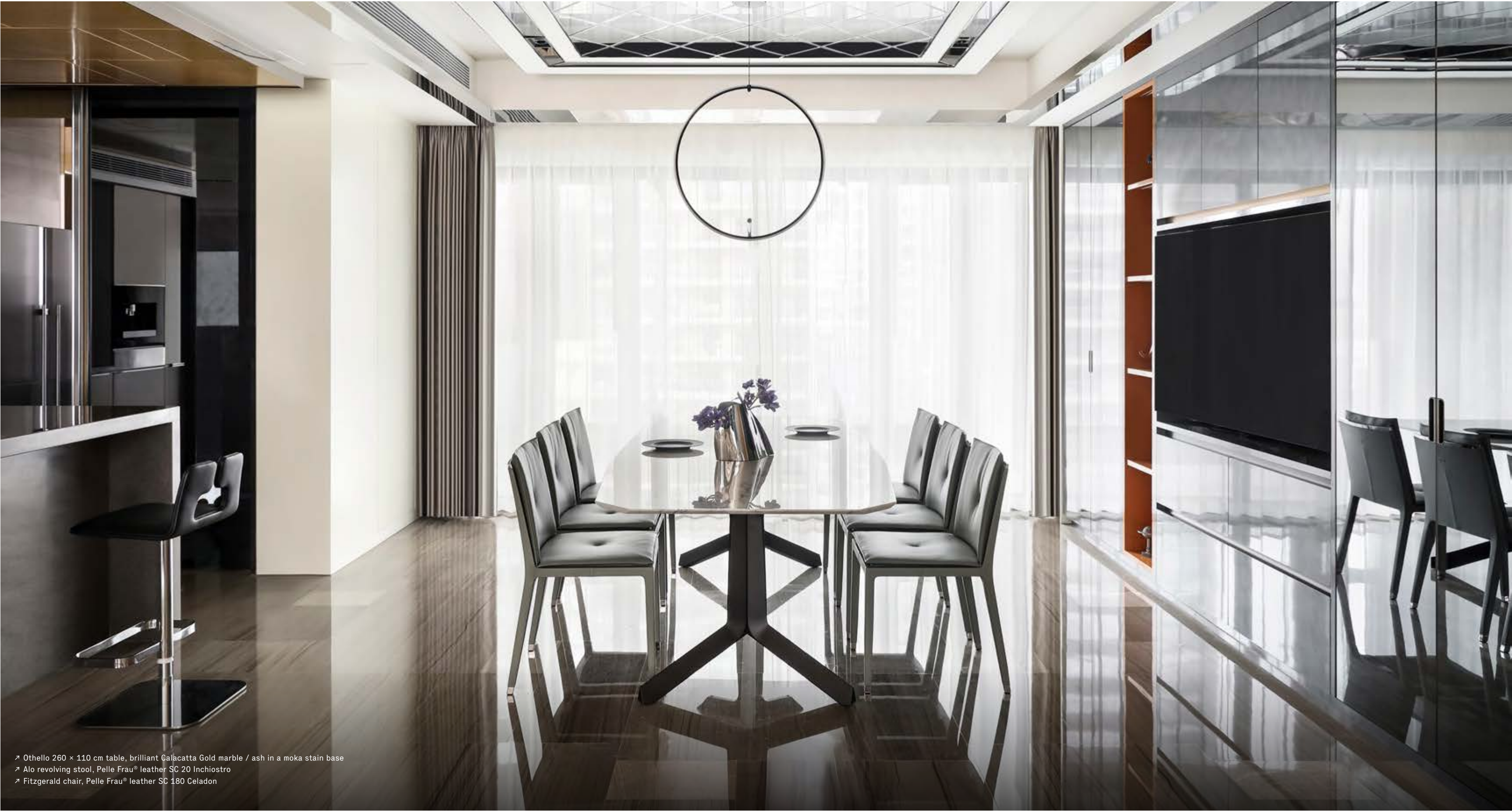
➤ Othello 260 × 110 cm table, brilliant Calacatta Gold marble / ash in a moka stain base ➤ Alo revolving stool, Pelle Frau® leather SC 20 Inchiostro ➤ Fitzgerald chair, Pelle Frau® leather SC 180 Celadon