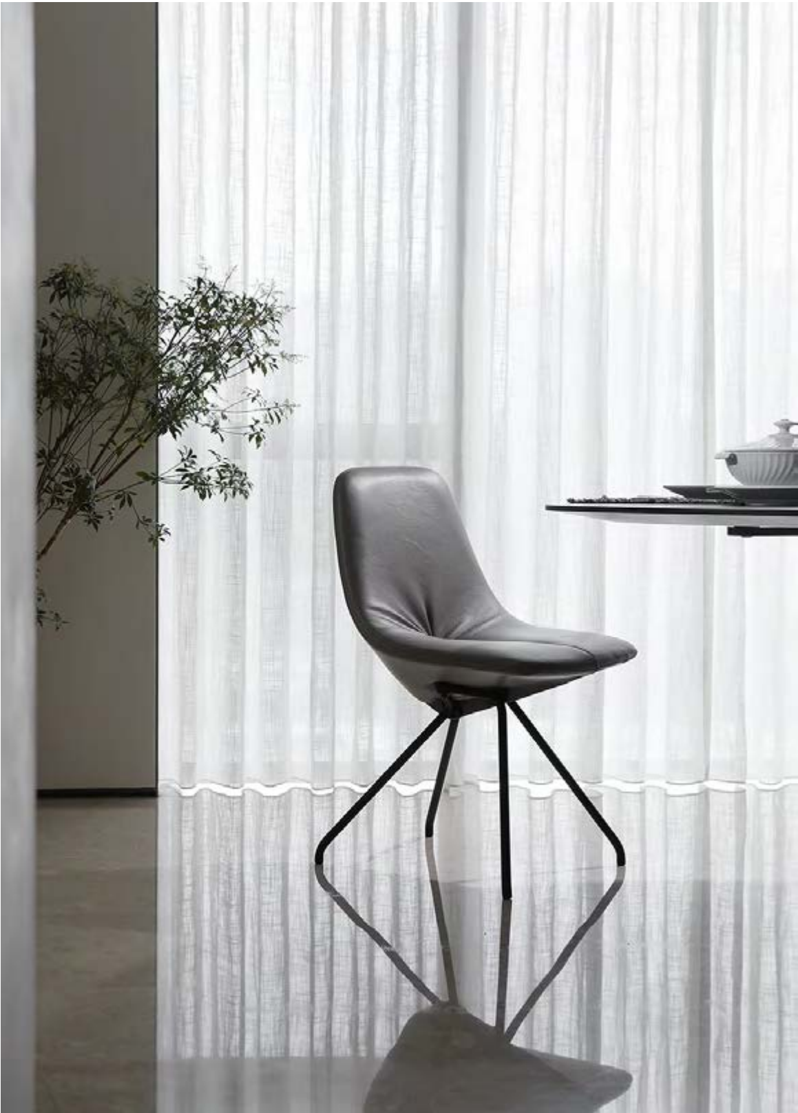
↑ ↗ Du 30 chair , Pelle Frau® leather SC 26 Topo ↗ Mesa Due Ø 135 h 75 cm round table, ash in a wengè stain top / Pelle Frau® leather Saddle Extra Polvere base