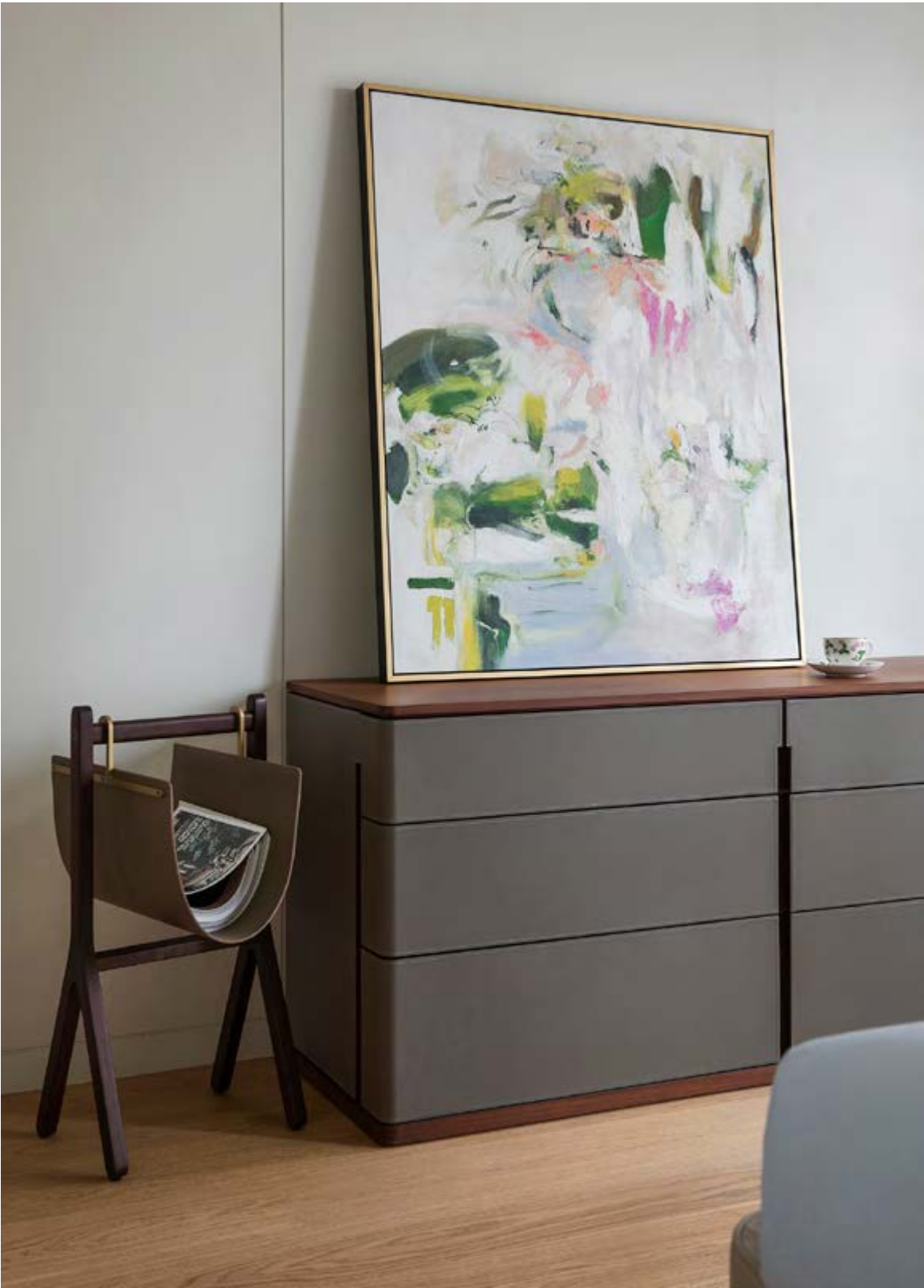
↖ Lola Darling bed, Pelle Frau® leather Nest Cemento ↖ Clayton bench, Pelle Frau® leather SC 51 Panna ↑ Fidelio Notte chest of drawers, Canaletto walnut top / Pelle Frau® leather Saddle Extra Polvere ↑ Ren magazine rack, Pelle Frau® leather Saddle Extra Talpa