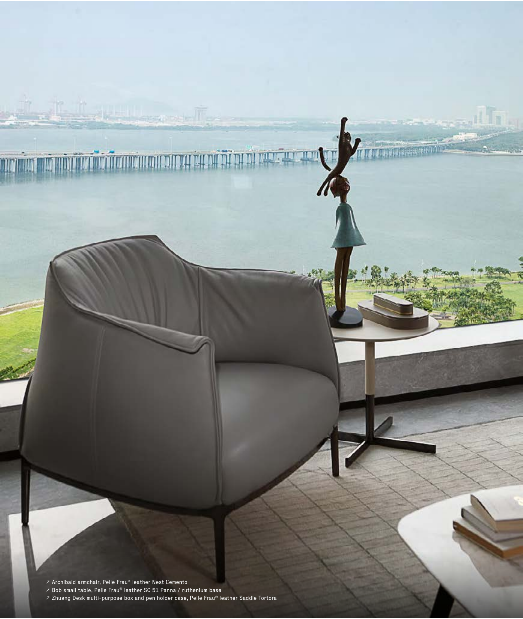
➤ Archibald armchair, Pelle Frau® leather Nest Cemento ➤ Bob small table, Pelle Frau® leather SC 51 Panna / ruthenium base ➤ Zhuang Desk multi-purpose box and pen holder case, Pelle Frau® leather Saddle Tortora

The apartment with unparalleled sea view is designed with wood combined with marble and other hard furnishings to set a plain style tone for the space. The designer made visual extensions in the limited space, focusing on creating a sense of space in the area, while meeting the client's needs in terms of color matching, and building two completely different schemes through different soft furnishings. The owner is a woman of taste, with an elegant aesthetic and the pursuit of high quality of life, whose carefully purchased accessories can be seen everywhere in every area of the house. Create a comfortable modern urban space.