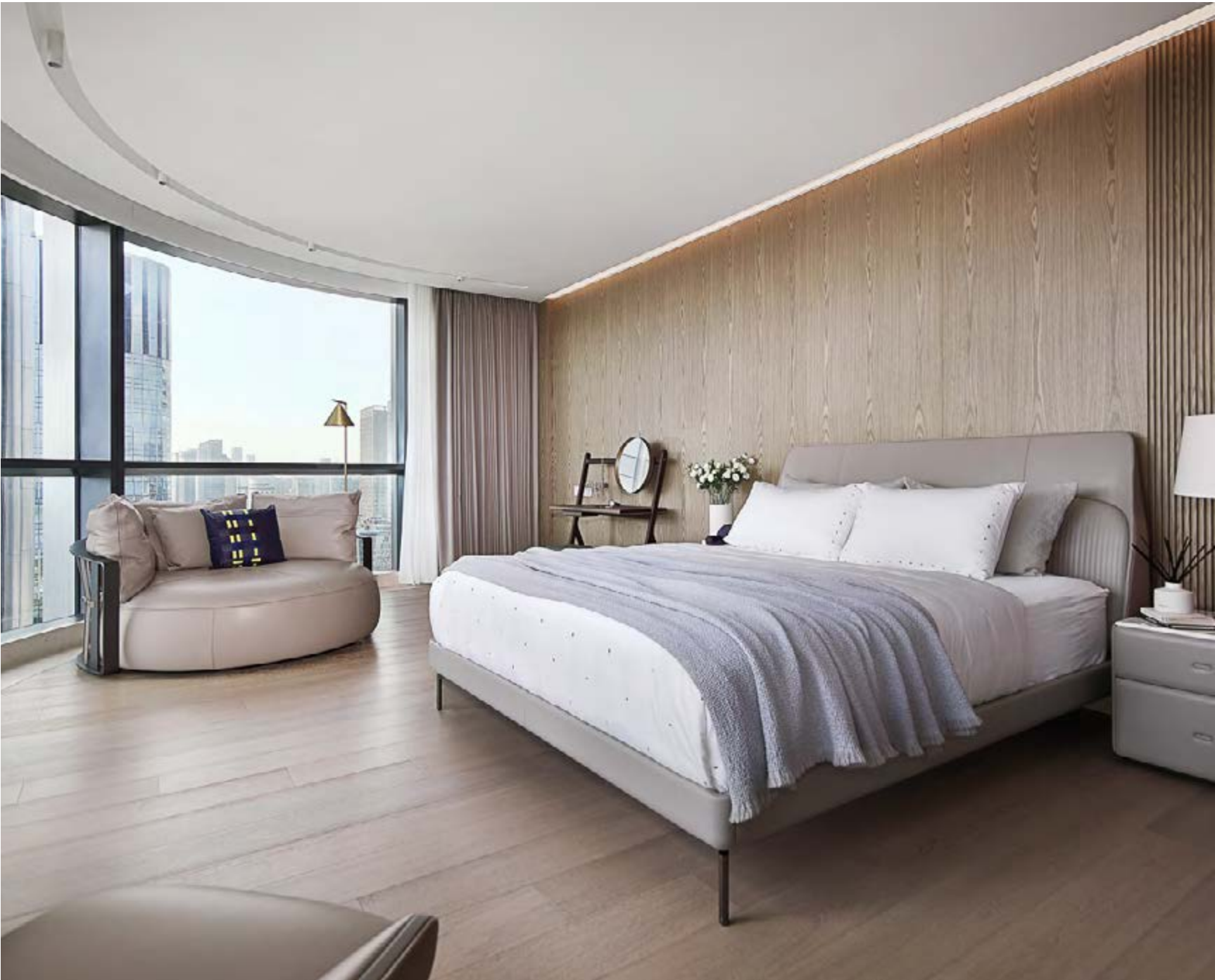
↑ Coupè De Luxe bed, Pelle Frau® leather Nest Salgemma / gunmetal steel feet ↑ Scarlett round sofa, Pelle Frau® leather Saddle Extra Talpa / Nest Salgemma ↑ Journey 47 × 47 cm cushion, col. Gion ↗ Moondance night table, Pelle Frau® leather Nest Salgemma / semibrilliant Calacatta marble top / Canaletto walnut back ↗ Ren dressing table, Pelle Frau® leather Saddle Extra Talpa / Canaletto walnut structure ↗ Lepli 39 × 39 cm ottoman, Pelle Frau® leather SC 180 Celadon / SC 66 India