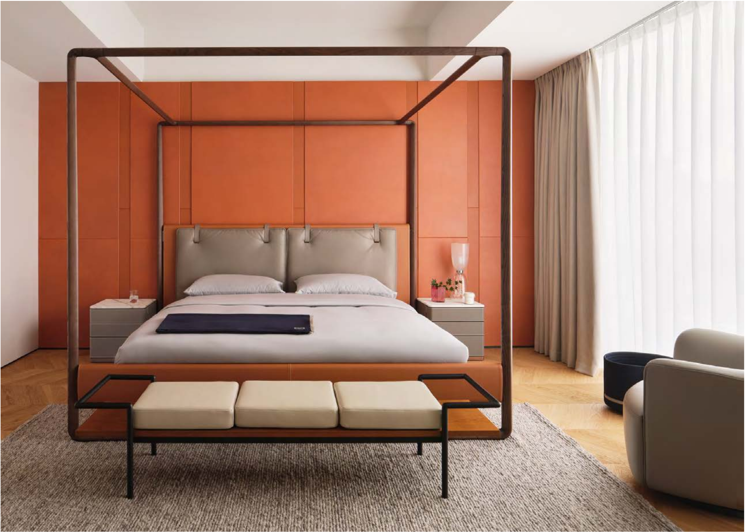
➤ Volare bed, Pelle Frau® leather Saddle Extra Cammello / Pelle Frau® leather Nest Pomice ➤ Aida armchair, Pelle Frau® leather SC 34 Maggese / wooden base