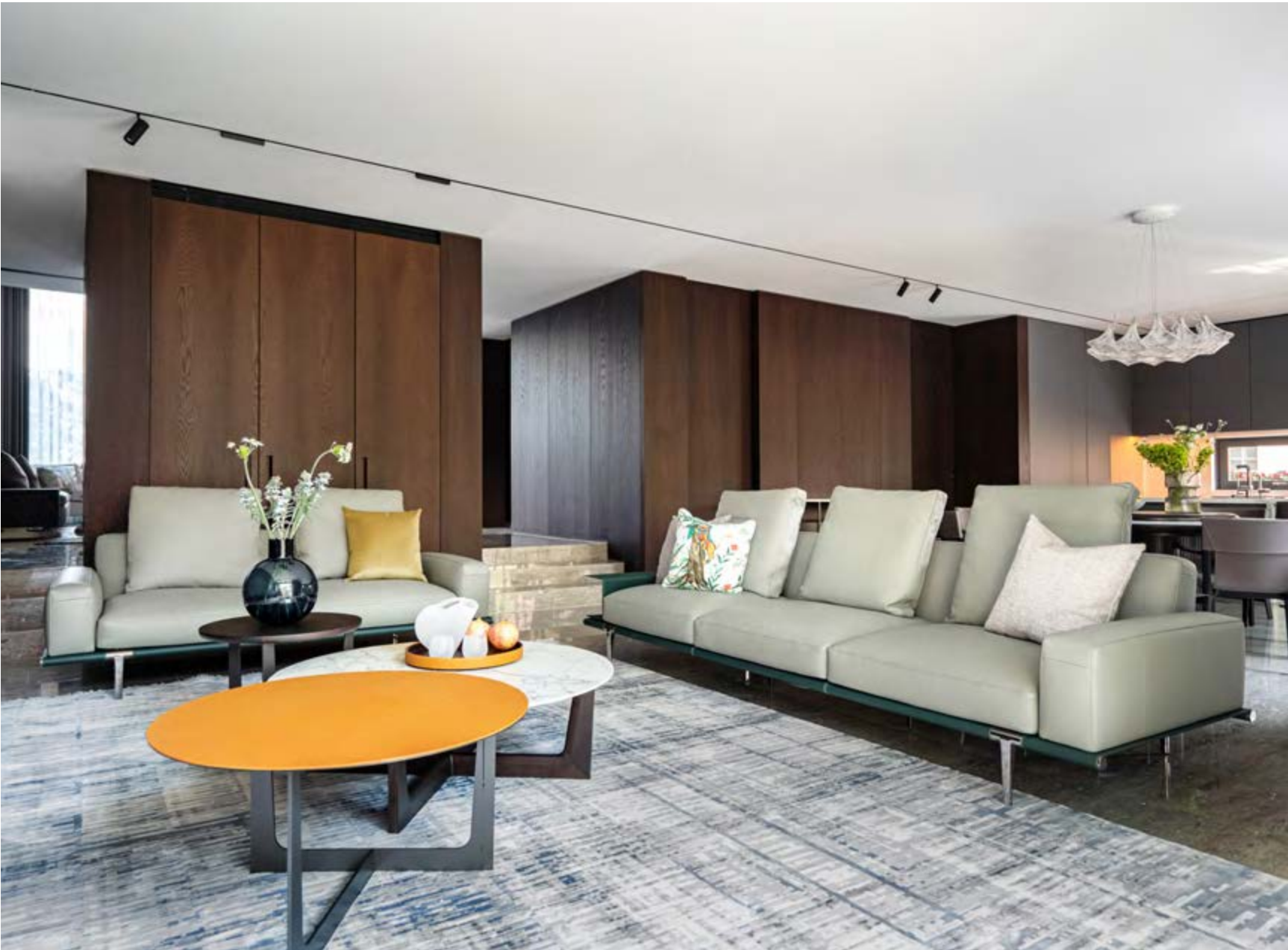
↑ Let it Be sofas, Pelle Frau® leather Saddle Avocado / SC 173 Glauco ↑ Ilary coffe table Ø 80 h 45, Pelle Frau® leather Saddle Extra Cammello / brushed burnished steel ↑ Ilary coffe table Ø 110 h 35, Calacatta marble, ash in a moka stain ↗ 1919 armchair, Pelle Frau® leather Heritage Bordeaux ↗ Ren side table, Pelle Frau® leather Saddle Extra Polvere