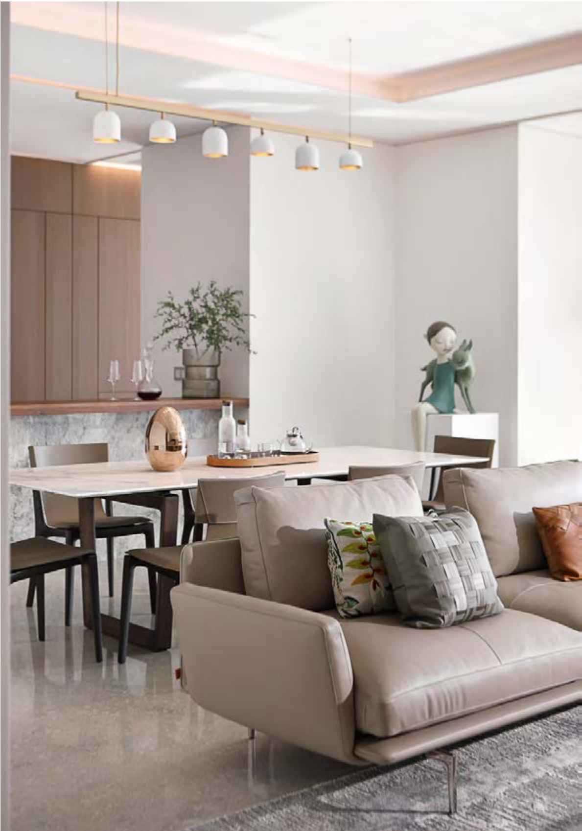
↖ Jay Lounge armchair and ottoman, Pelle Frau® leather Soul Whitney ↖ Bob ø 45 h 52 small table, brilliant Calacatta marble top / gunmetal finish base ↑ Bolero 250 × 100 table, brilliant marble top / ash in a moka stain ↑ Isadora chair, Pelle Frau® leather Saddle Extra Talpa / ash in a moka stain structure ↑ Rips vase