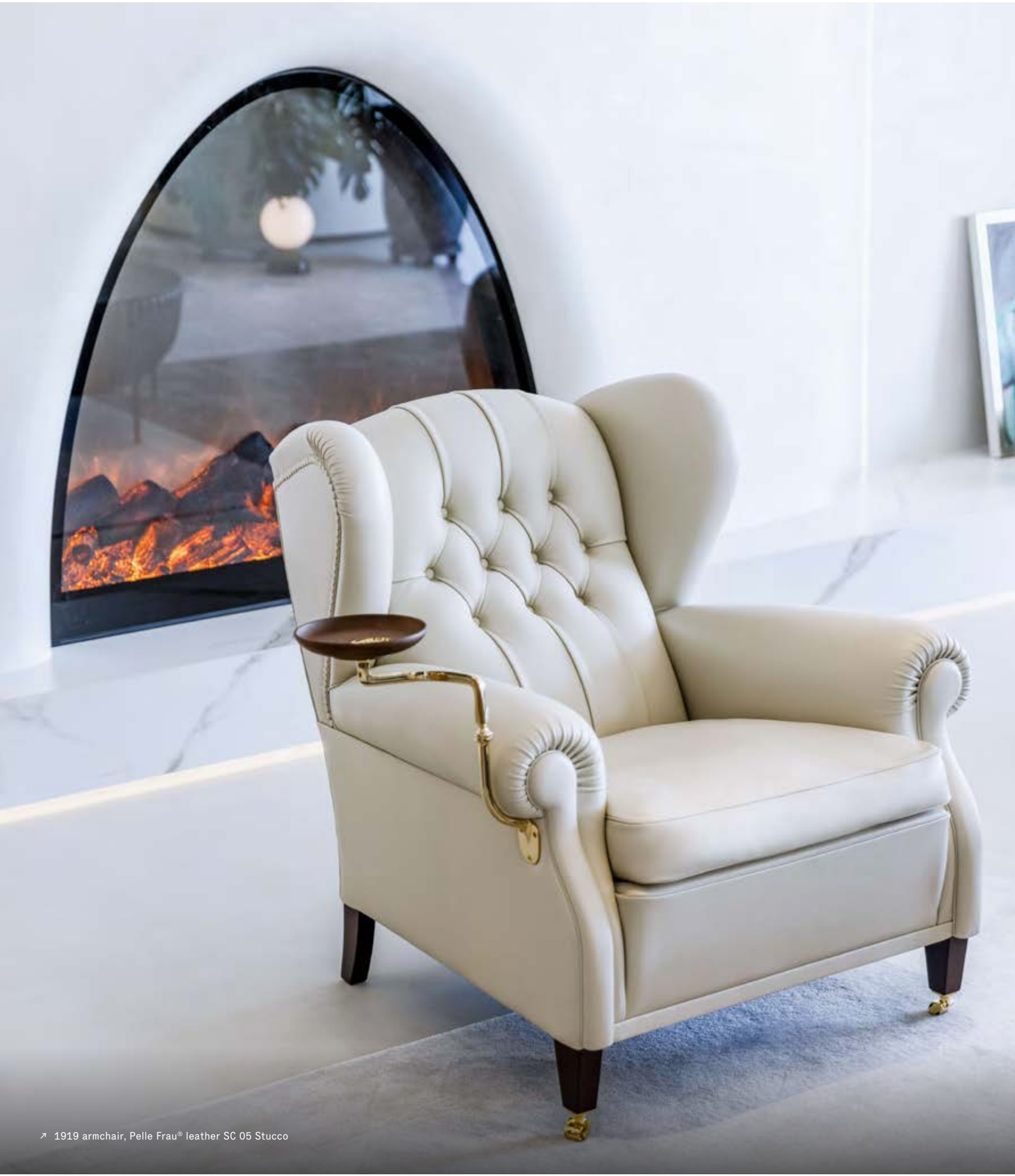
➤ 1919 armchair, Pelle Frau® leather SC 05 Stucco

The leather material and craftsmanship details of the Poltrona Frau products inject exquisite soul into this ambience. Located adjacent to Beijing's Olympic Forest Park, you could overlook the beautiful National Stadium, which brings you a sense of joy and relaxation, both from the view outside the window and the comforting premium Poltrona Frau iconic products in the apartment.