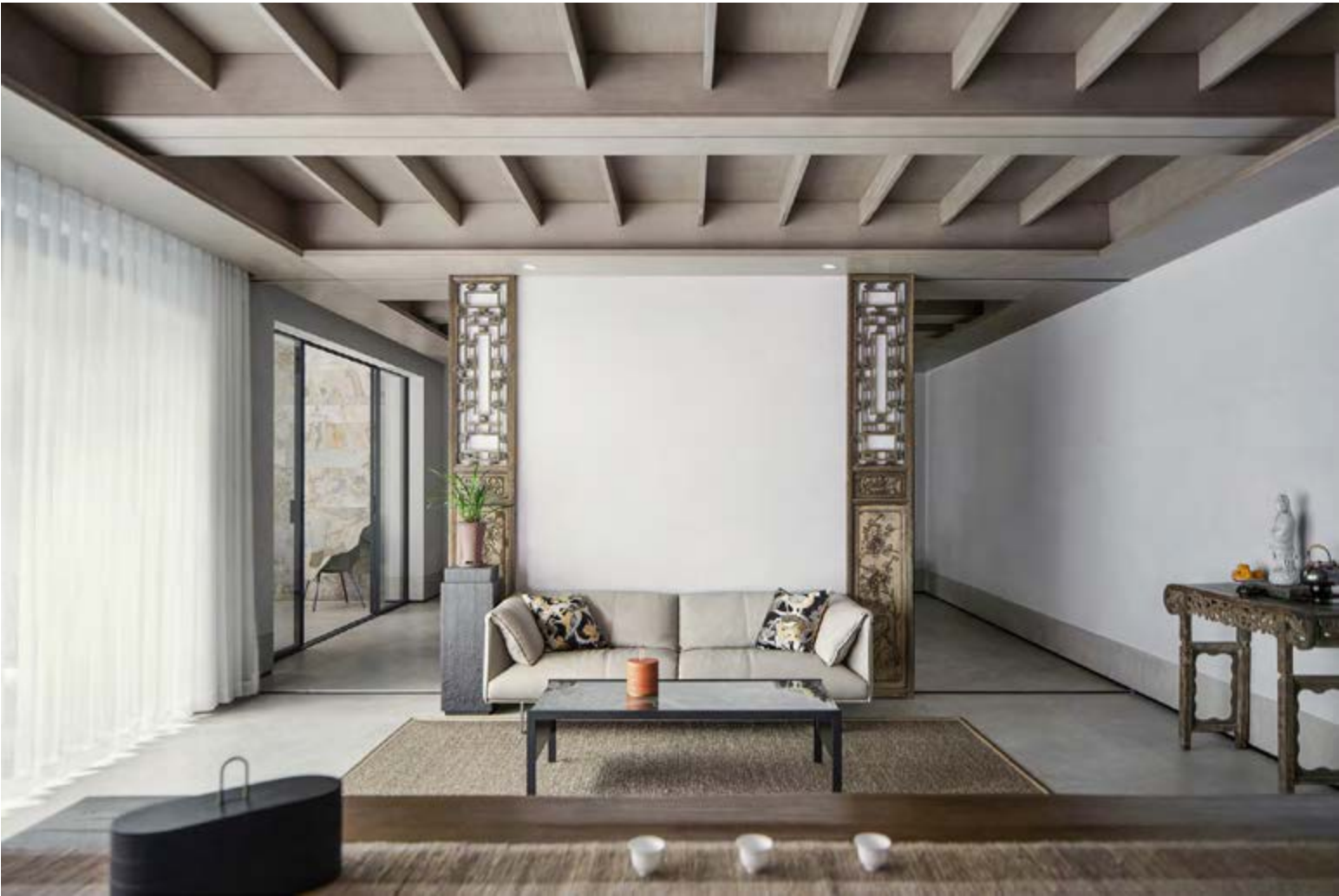
↑ John-John sofa, Pelle Frau® leather Nest Salgemma ↗ Viola small armchair, Pelle Frau® leather SC 40 Cachemire with natural leather rope dark / brown and wenge ash structure