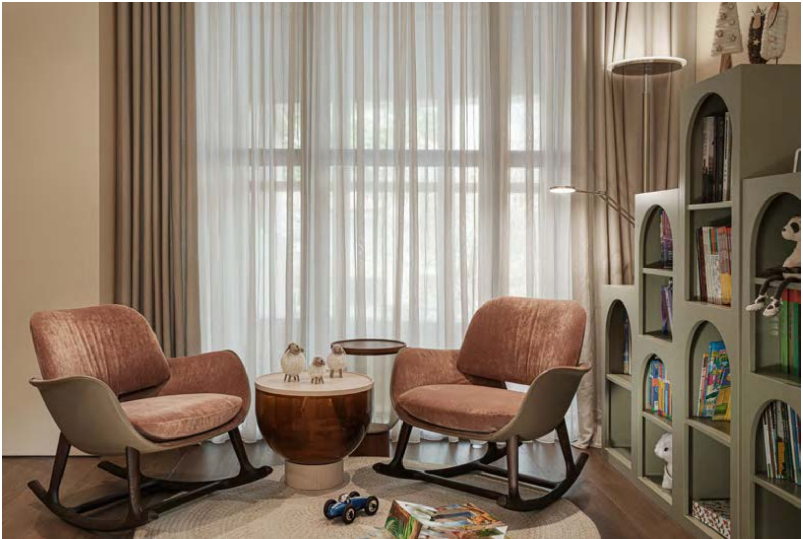
↵ John-John bed, Pelle Frau® leather SC 263 Lilla* ↵ Fiorile with drawer, Pelle Frau® leather Saddle Avorio / ash in a moka stain base ↑ Martha rocking armchair, Pelle Frau® leather Talpa / fabric Millerighe col. Rosa Antico* / ash in a moka stain base