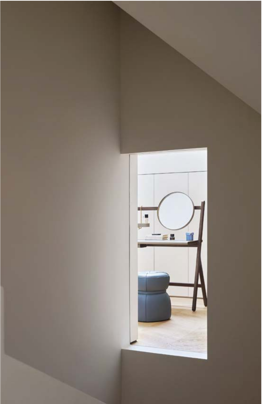
↖ John-john bed, Pelle Frau® leather SC 22 Chiffon ↖ Fiorile with drawer side table, Pelle Frau® leather SC 34 Maggese / ash in a moka stain ↖ Xi lamp table, sapphire glass ↑ Ren dressing table, Pelle Frau® leather Saddle Extra Talpa ↑ Lepli 39×39 ottoman, Pelle Frau® leather SC 274 Fresco Blue