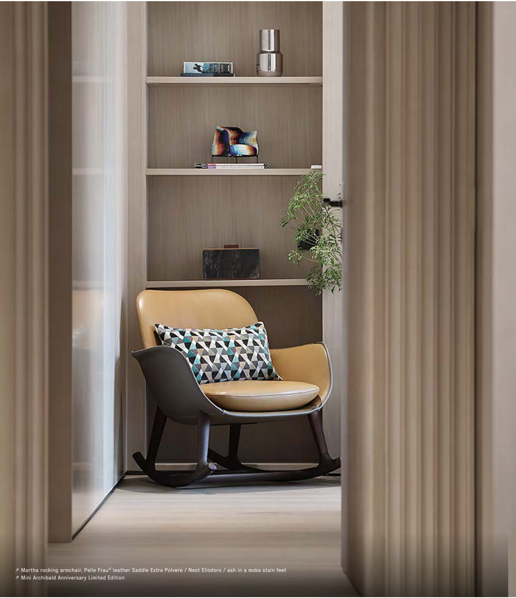
➤ Martha rocking armchair, Pelle Frau® leather Saddle Extra Polvere / Nest Eliodoro / ash in a moka stain feet ➤ Mini Archibald Anniversary Limited Edition

The designer presented a rich spatial experience for the owner in the plan, integrating the concept of "art can make life more lifelike" in this large family centered on life.