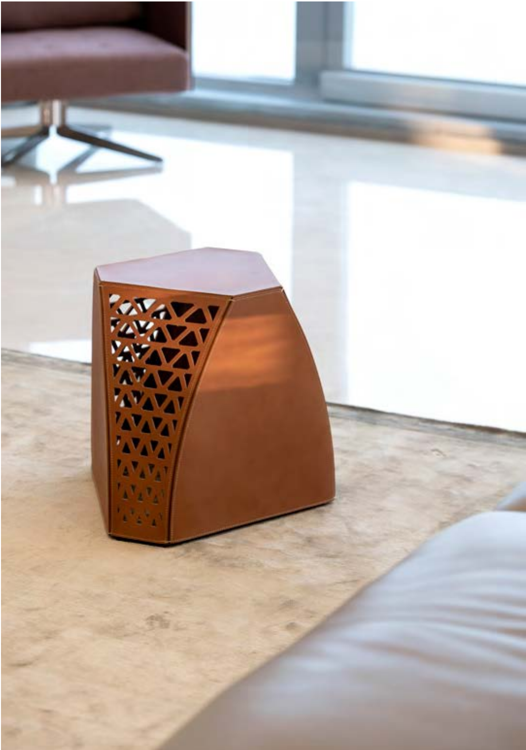
↖ Oceano trunk, Pelle Frau® leather SC 98 Ribes* ↖ Hudson coffee table, Pelle Frau® leather Saddle Extra Talpa ↖ ↑ Hudson coffee table, Pelle Frau® leather SC 68 Sahara