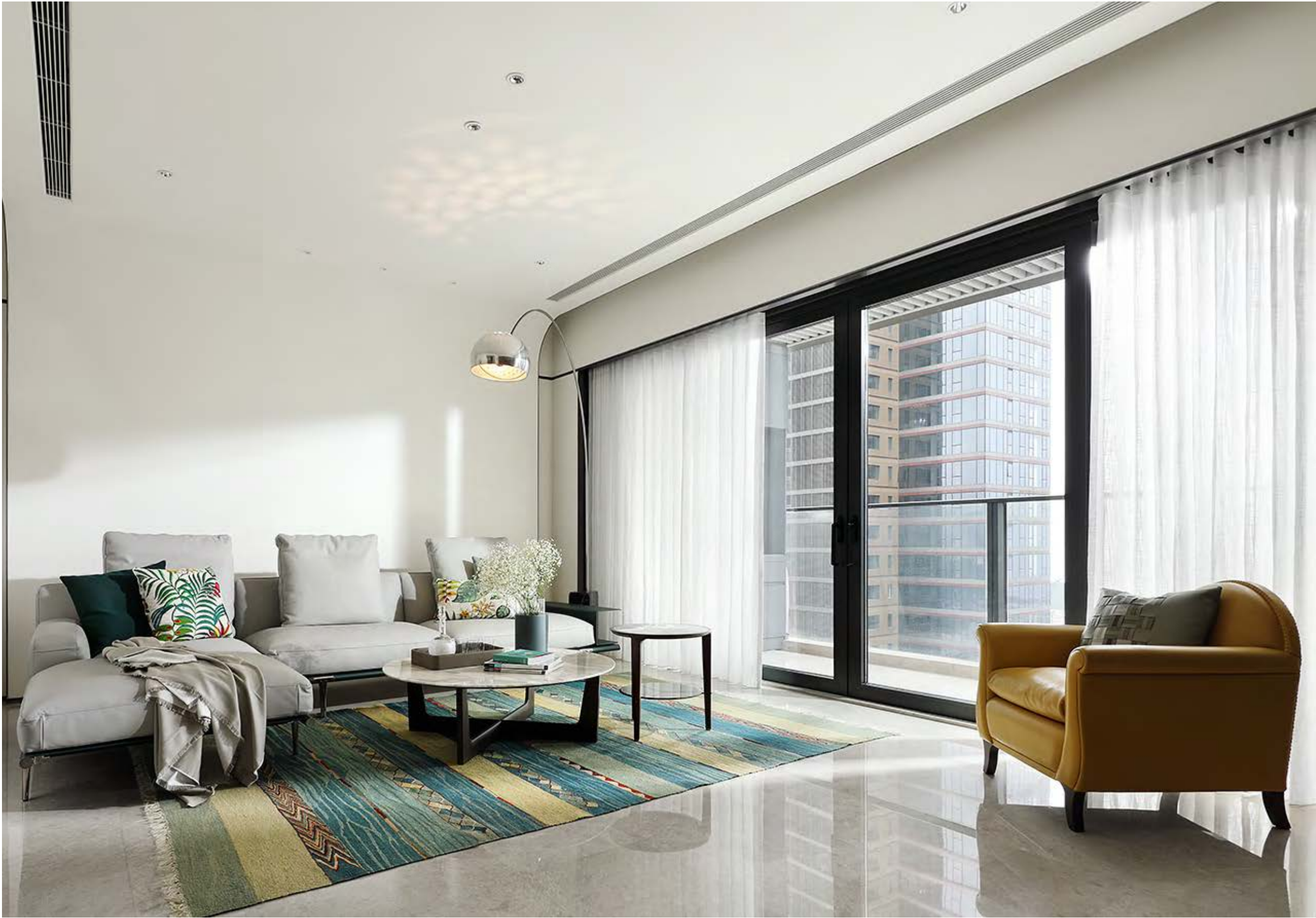
➤ Let it Be sofa, Pelle Frau® leather Saddle Extra Polvere / ash in a wenge stain ➤ Mi low cabinet, Pelle Frau® leather Saddle Extra Polvere / brilliant Calacatta gold top ➤ Xi table lamp, sapphire glass