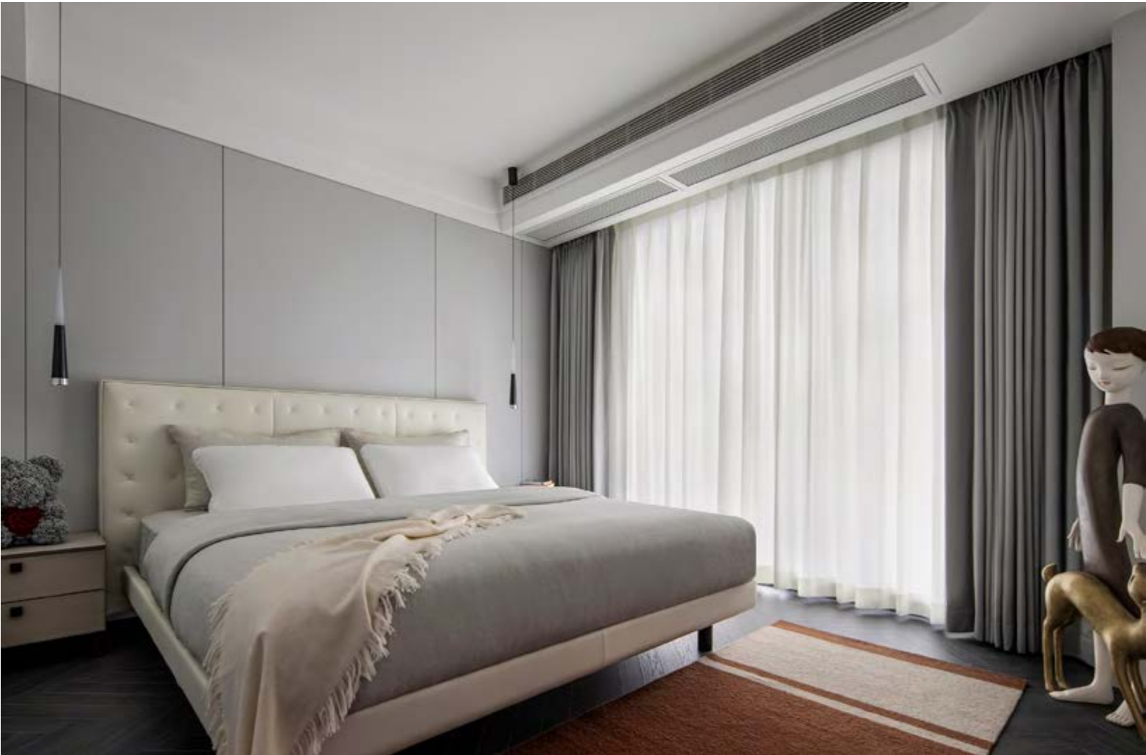
↑ ƚ Più Notte night table*, Pelle Frau® leather SC 31 Quarzo Fumè ↑ Jack bed*, Pelle Frau® leather SC 0 Polare ↑ Land 90x280 cm rug*, col. rust