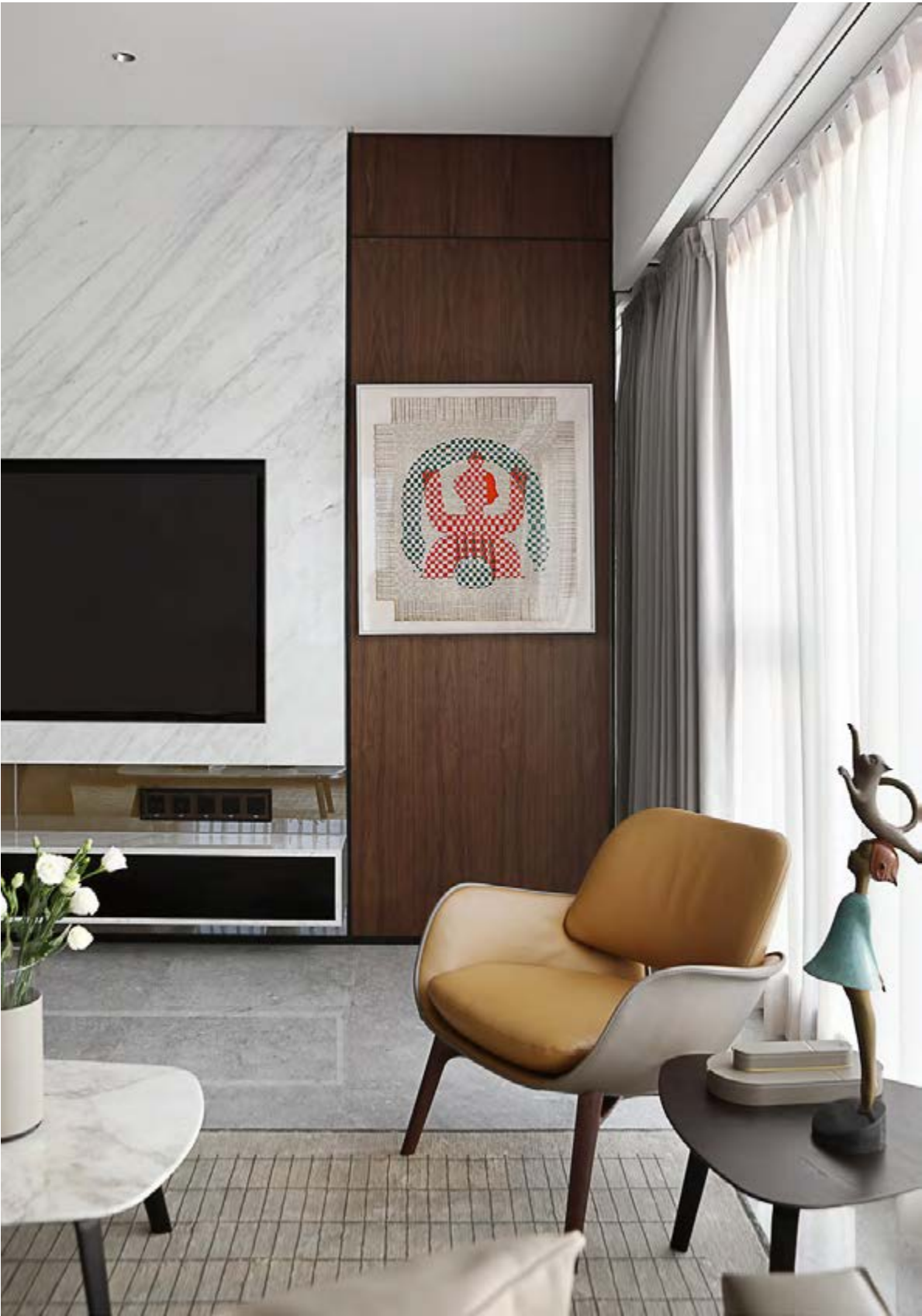
↶ Le Spighe stool, Pelle Frau® leather SC 51 Panna / American walnut veneer ↑ Martha armchair, Pelle Frau® leather Saddle Extra Polvere / Nest Eliodoro / ash in a moka stain feet ↑ Fiorile 58×56 h 37 small table, ash in a wengè stain top and base