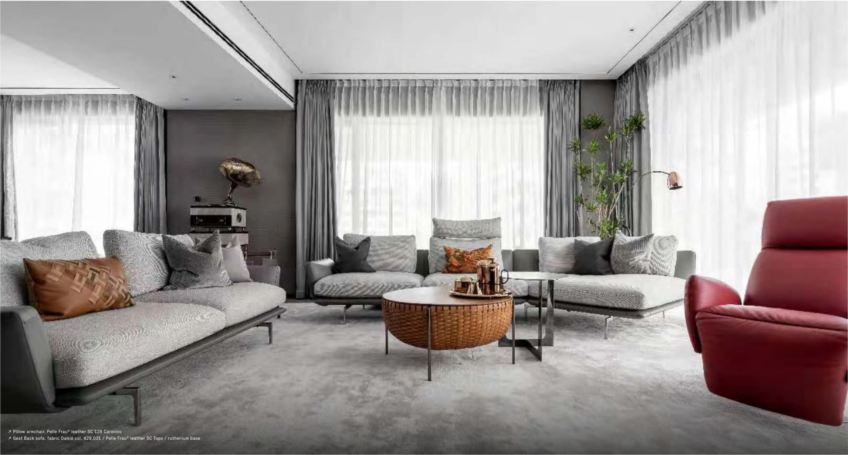
➤ Pillow armchair, Pelle Frau® leather SC 128 Carminio ➤ Gest Back sofa, fabric Damiè col. 429.031 / Pelle Frau® leather SC Topo / ruthenium base