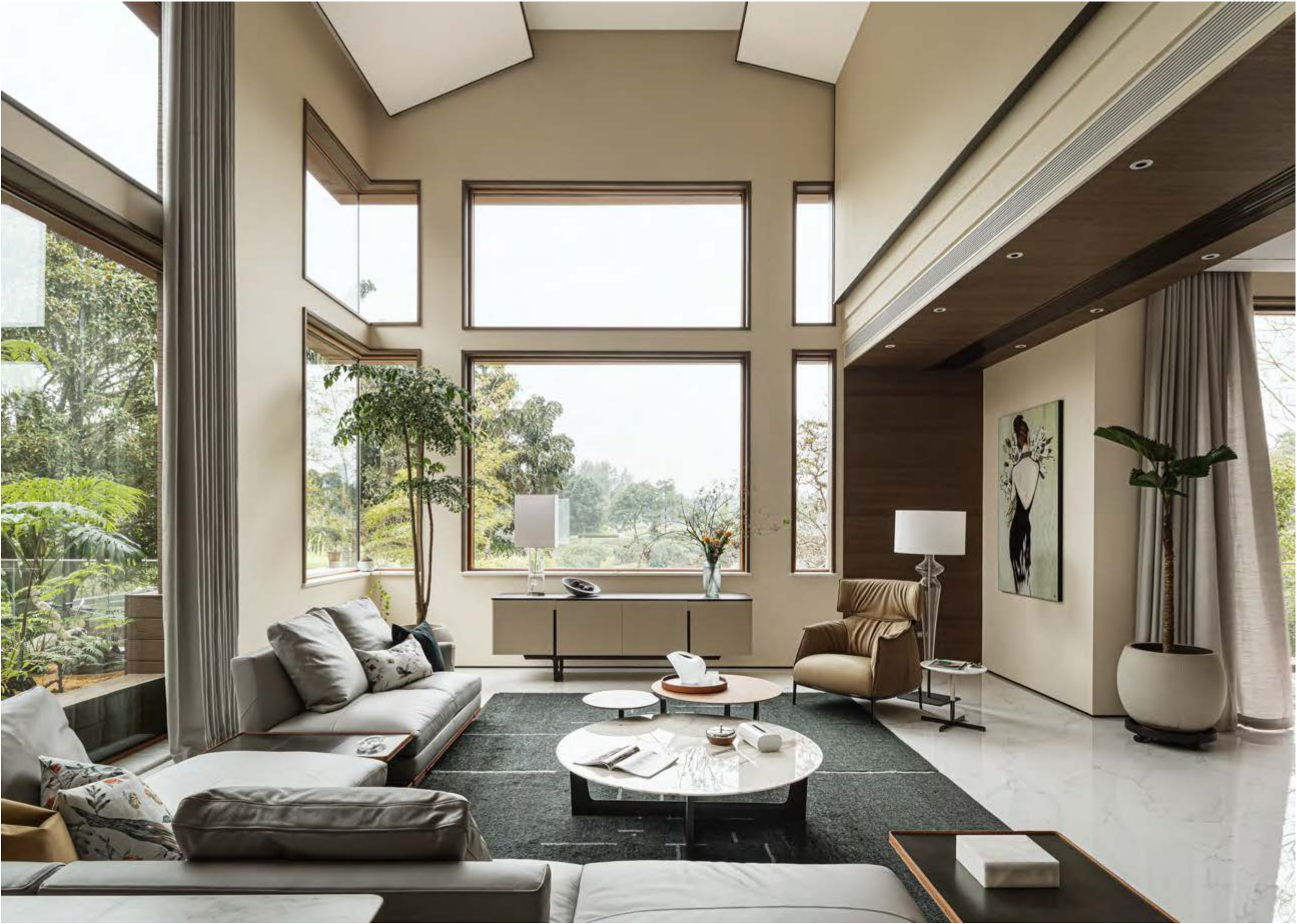
➤ Come Together sofa, Pelle Frau® leather SC 23 Tortora / Saddle Extra Cammello ➤ Archibald King armchair, Pelle Frau® leather Century Khaki* ➤ Ilary ø 110 h 35 cm, brilliant Calacatta Gold marble / ash in a moka stain base