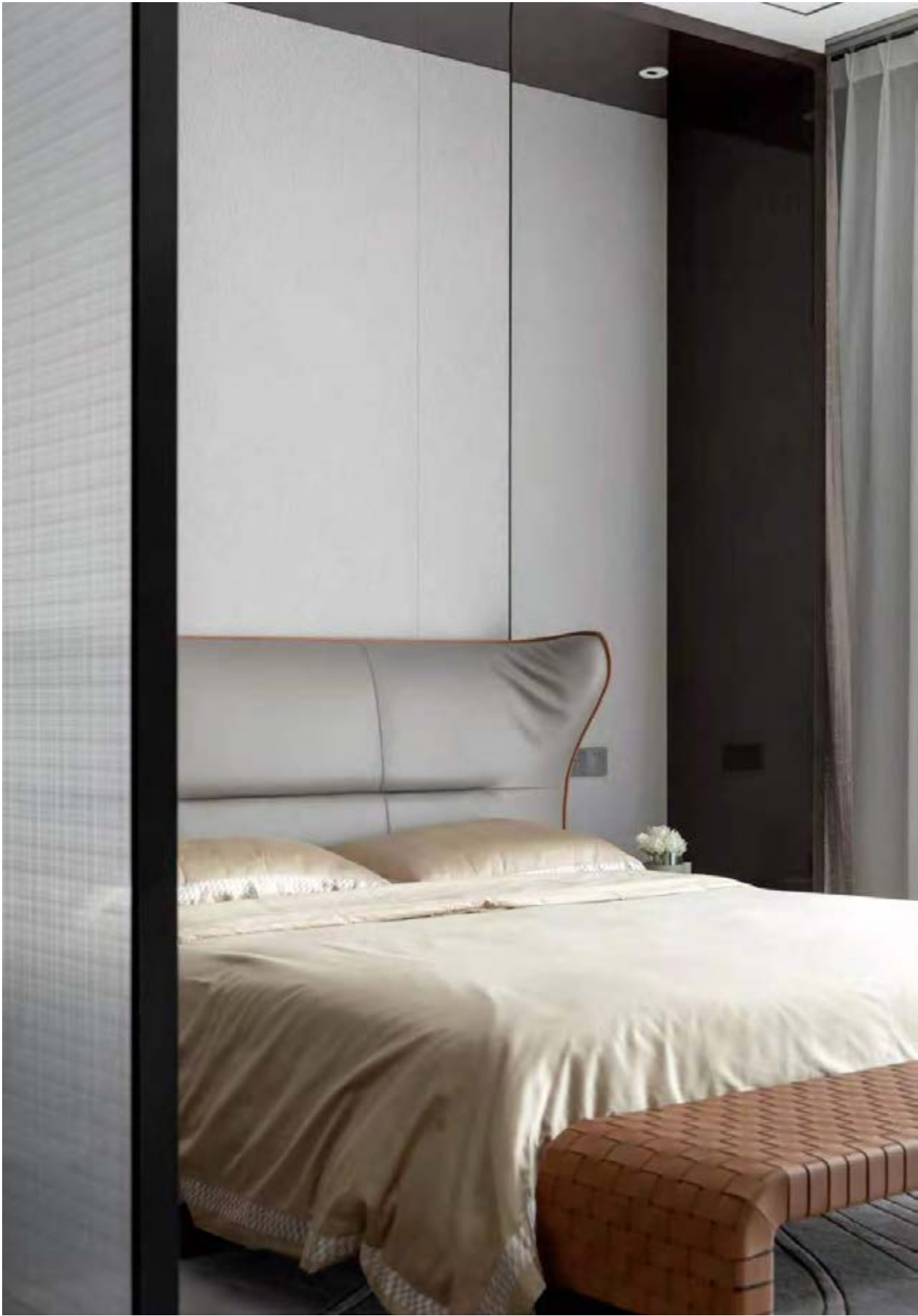
↑ ↗ Mamy Blue bed, Pelle Frau® leather Saddle Extra Cammello / SC 26 Topo ↑ Nivola armchair, Pelle Frau® leather Saddle Extra Cammello / SC 28 Seppia ↑ Fidelio Notte night table, Pelle Frau® leather Saddle Extra Cammello / Canaletto walnut top ↑ Xi table lamp, sapphire glass ↑ Brera bench, Pelle Frau® leather Saddle Extra Cammello / ash in a moka stain