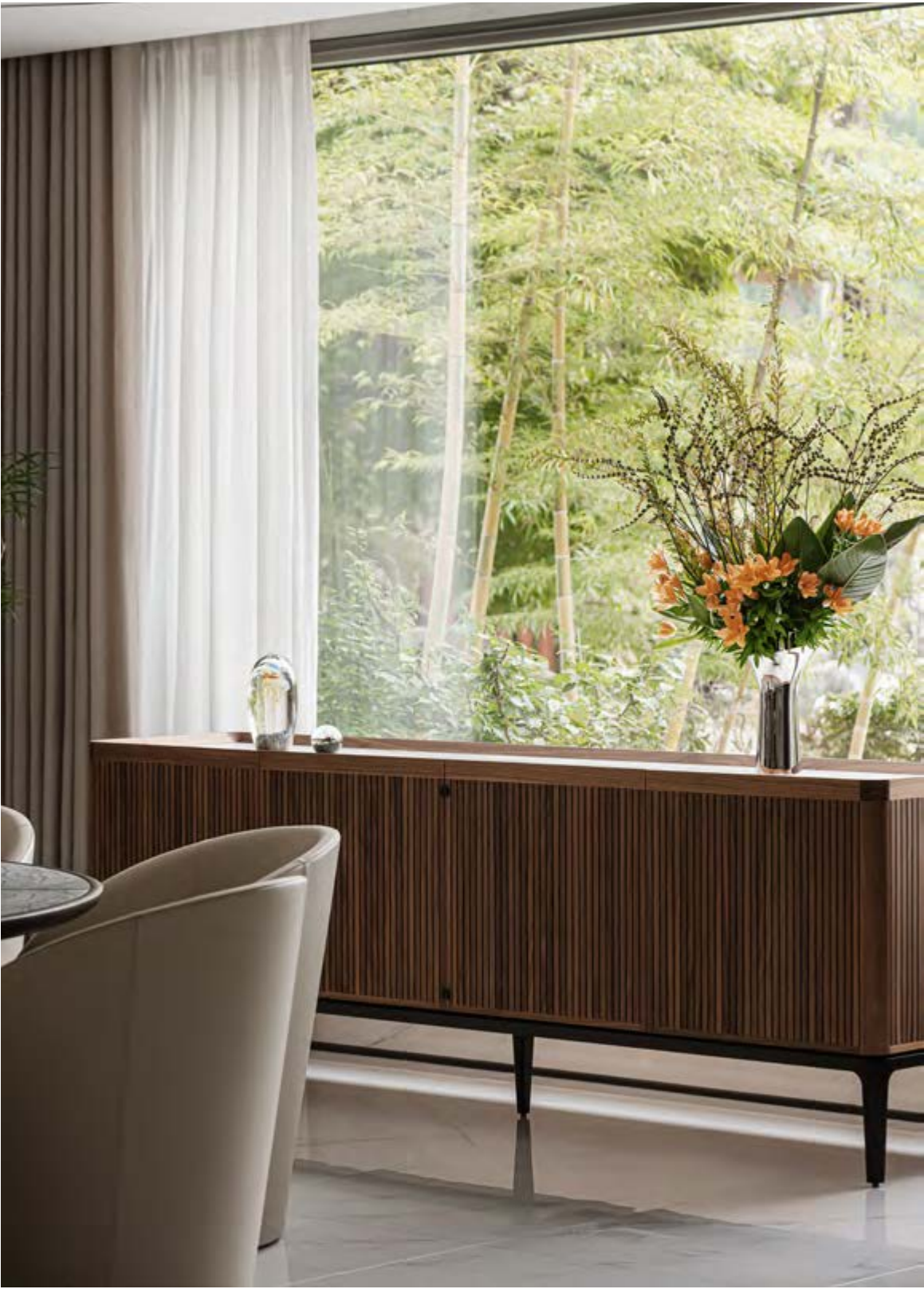
↑ ↖ Intervista armchair, Pelle Frau® leather SC 51 Panna ↖ Fidelio drinks cabinet, Pelle Frau® leather Saddle 07 Oliva / semi-brilliant Fior di Pesco marble top / ash in a moka stain back CECCOTTICOLLEZIONI products ↑ ↖ Full Table round Ø180, walnut moka structure / Mediterraneo marble top ↑ ↖ Neverfull low cabinet, American walnut / brown walnut base / Cervairole marble top